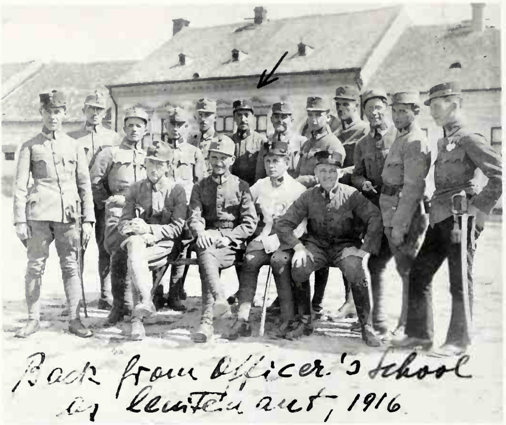
Scenes from the Great War, with Reich's own captions