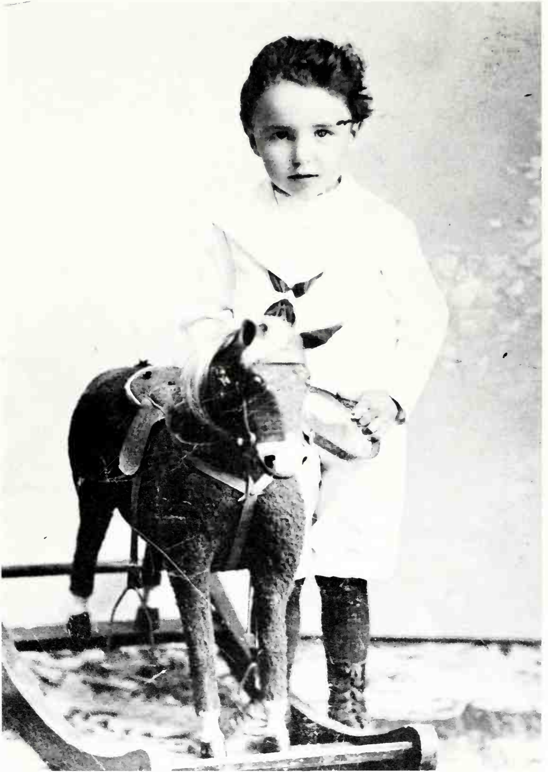
Wilhelm Reich at age three, 1900