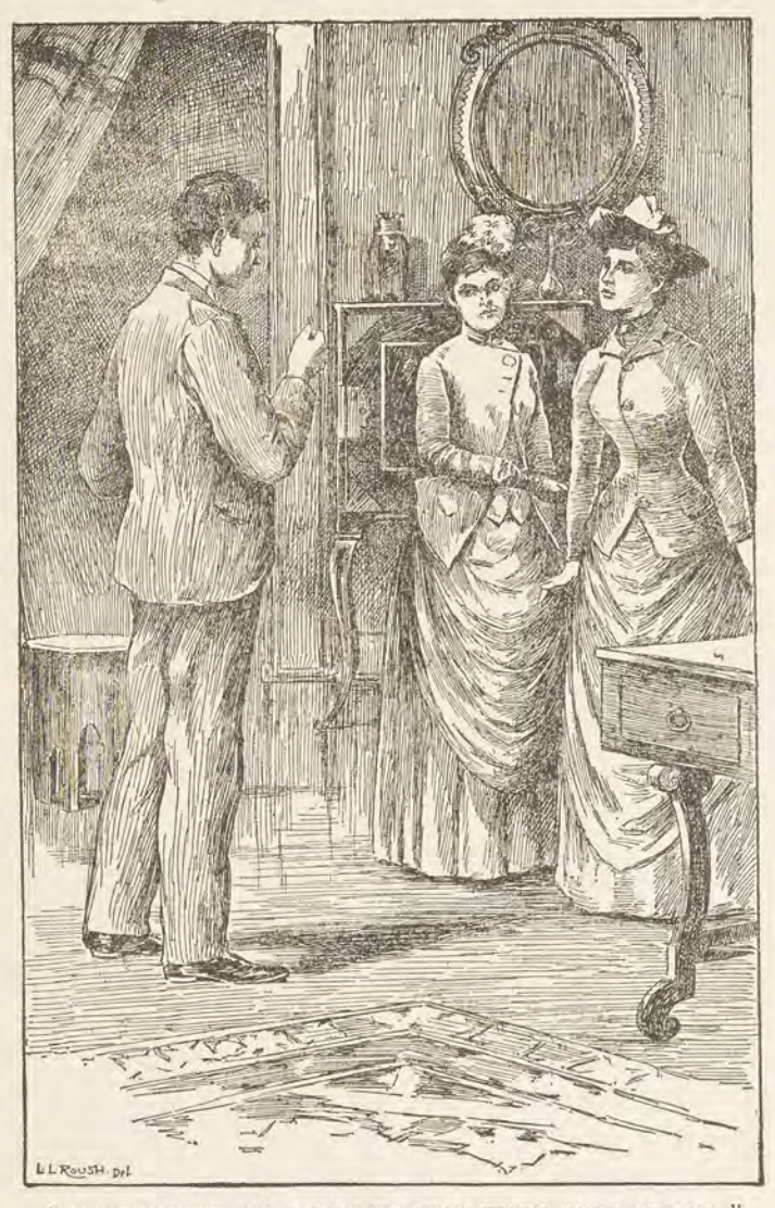
"SAM EXAMINED THE RUBY RING FROM EVERY POINT OF VIEW."