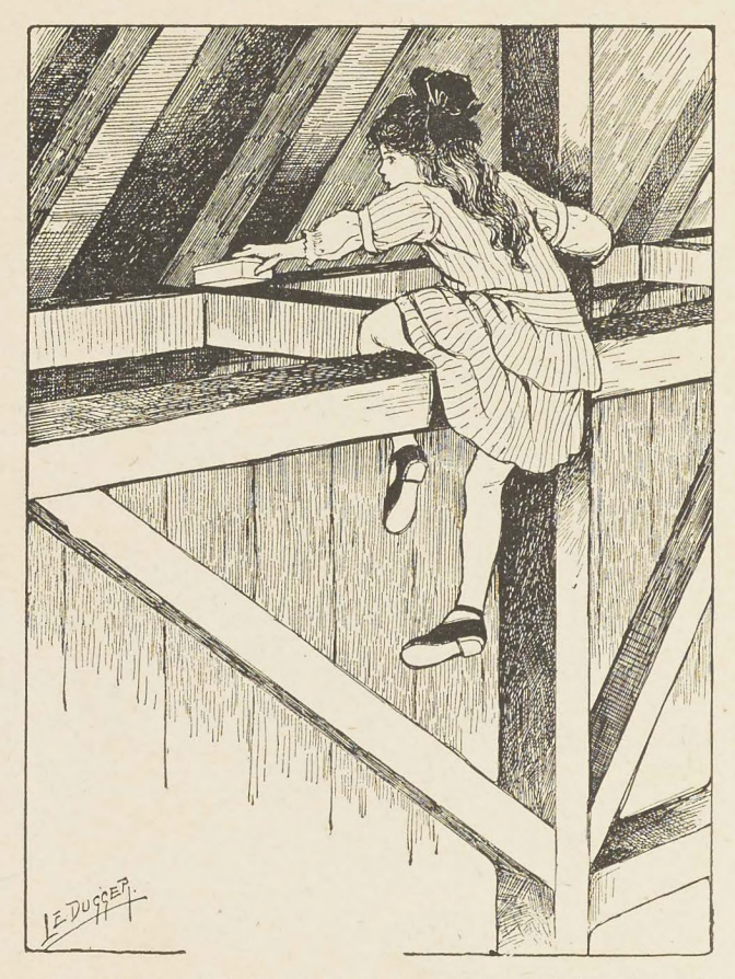
The perilous ascent was made at last, and the little box shoved far back into the corner. (See page 13.)