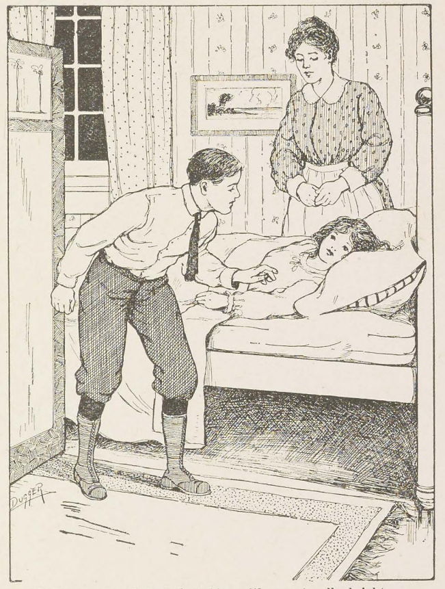
Polly turned and looked at him with unnaturally bright eyes. (See page 16.)