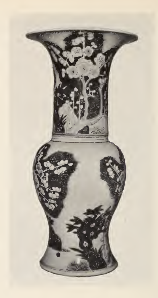
IMPORTANT BLUE AND WHITE BEAKER VASE KANG HSI