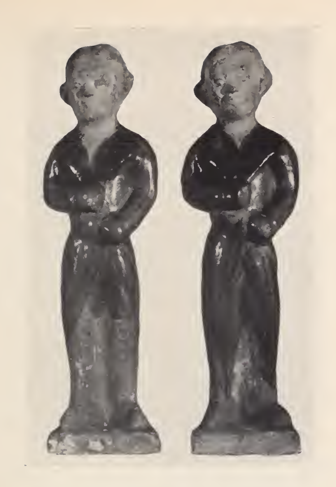
PAIR OF RARE EXCAVATED GLAZED FIGURINES TANG PERIOD [NUMBER 271]