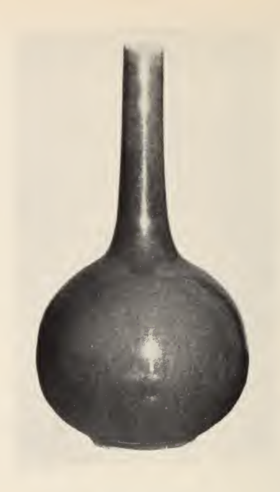
FINE GLAZED LANG YAO VASE EARLY KANG HSI PERIOD [NUMBER 351]

351 IMPORTANT LANG YAO VASE Globular shape with tall cylindrical neck, covered with Sang-de-Boeuf glaze typical of the class, showing much clotting and rich depth of various ranges. The base is celadon glaze with brownish crackle, also typical of this famous class of Early Lang Yaos. The slight splash on the side exposing the paste is an attractive element of this bottle. Height, 16 inches