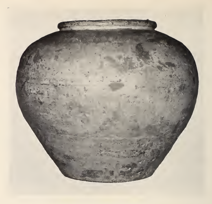
IMPORTANT LARGE POTTERY JAR HAN PERIOD [NUMBER 283]