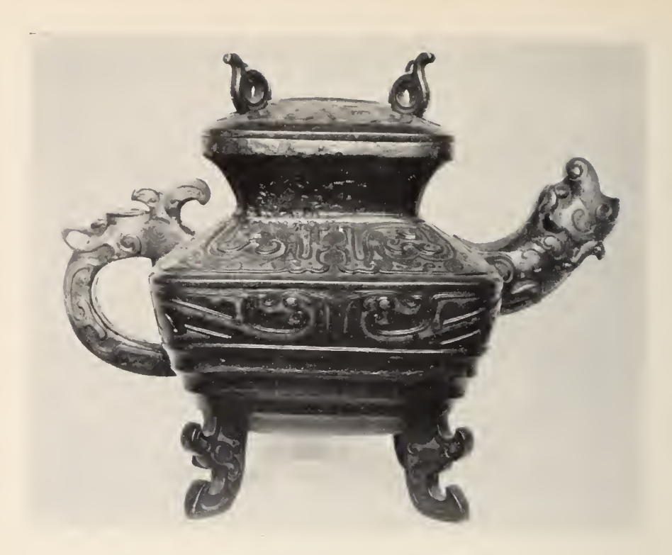
TANG SACRIFICIAL WINE VESSEL INLAID WITH SILVER AND GOLD [NUMBER 174]