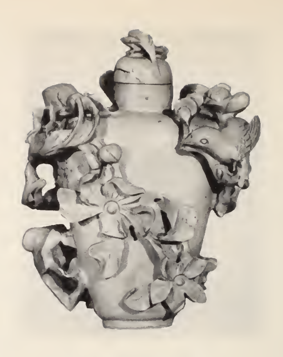
RICHLY CARVED TURQUOISE SNUFF BOTTLE [NUMBER 8]