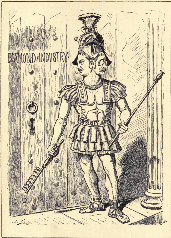
FROM THE LANTERN , CAPETOWN