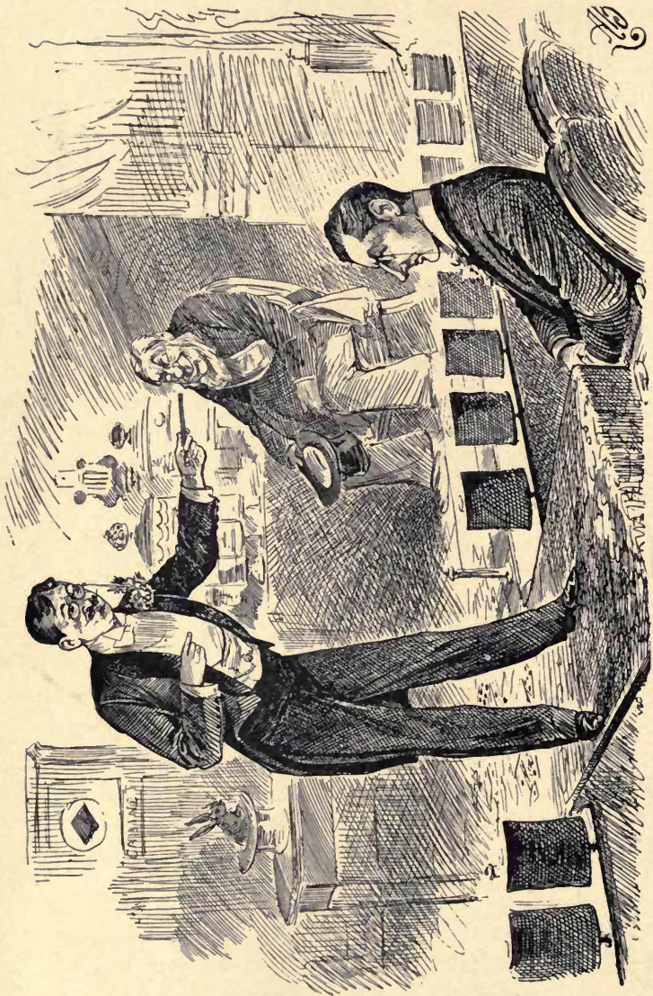
(Published by permission of "Moonshine")