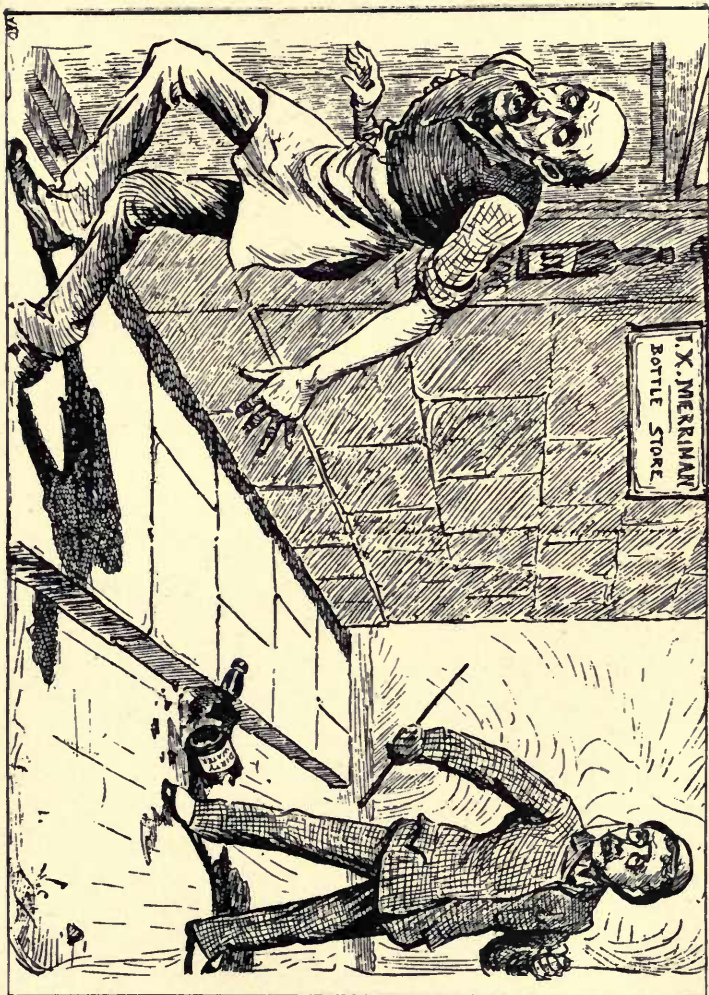
FROM THE LANTERN, CAPE TOWN