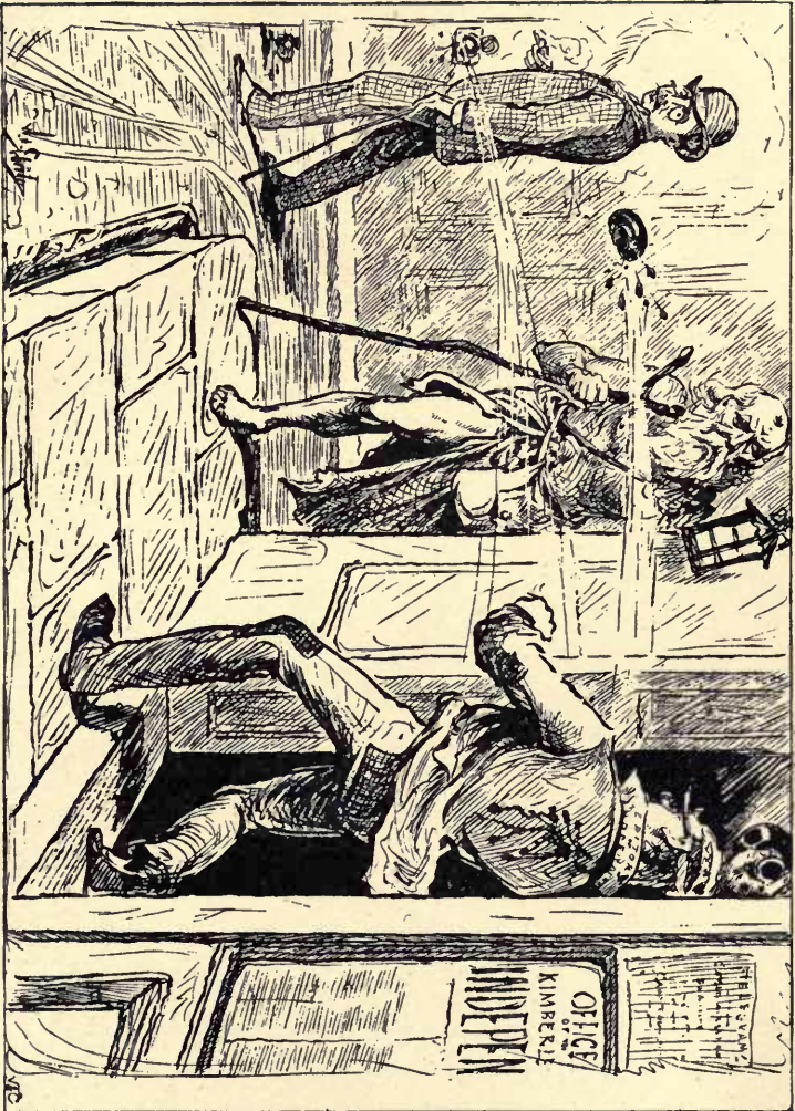
FROM THE LANTERN, CAPE TOWN