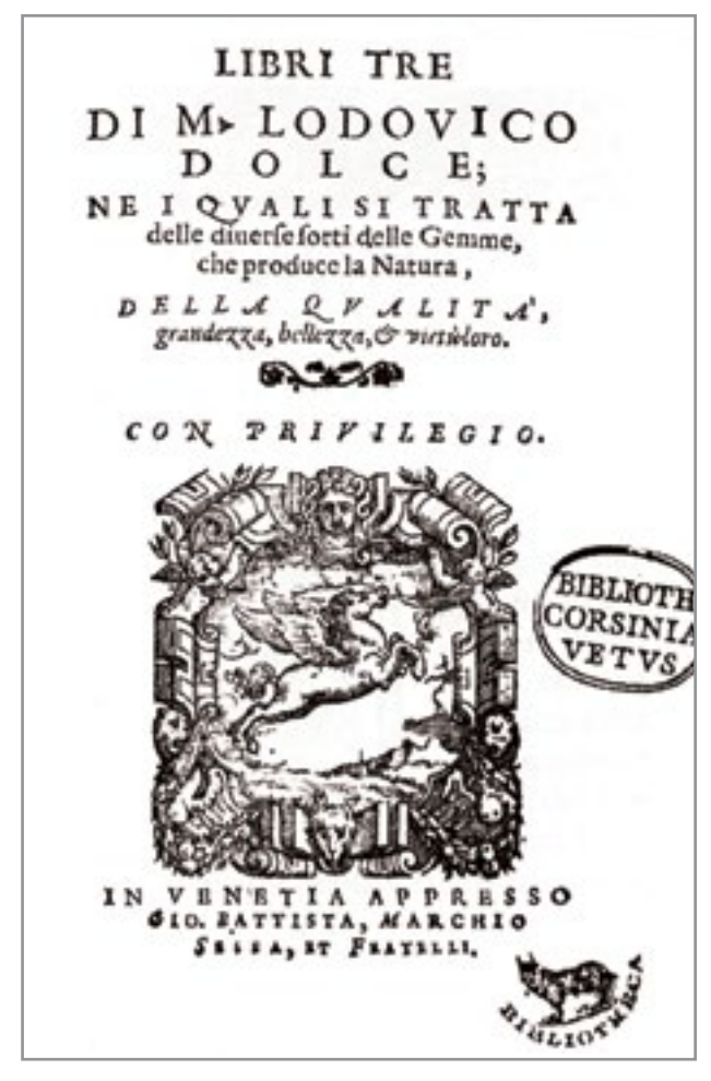
Figure 4: The title page of Lodovico Dolce's 1565 translation of Camillo Leonardi's 1502 book, nowhere showing the name of the true author. This is a typical case of Renaissance-style plagiarism, yet with the very effective outcome of spreading knowledge on gem materials with their proper Italian names.

tenera ('soft' aquamarine) and cristallo (quartz). Unfortunately no description of the samples was provided, so their transparency and rough/cut state are unknown. Only indirectly can we infer that all samples were single gems except for rubini 3 (three rubies measured as a single sample) and zaffiri 2 (two 'sapphires', actually spinel, again measured together). All the names used by Galileo were the current Italian gem names, which were those given by Lodovico Dolce (1565; Figure 4) when translating Camillo Leonardi's (1502) Speculum Lapidum (Mirror of Stones). Dolce's definitions include a description of the colour for some gems (e.g. topazio is a yellow stone), but the colours of several of Galileo's samples cannot be inferred.