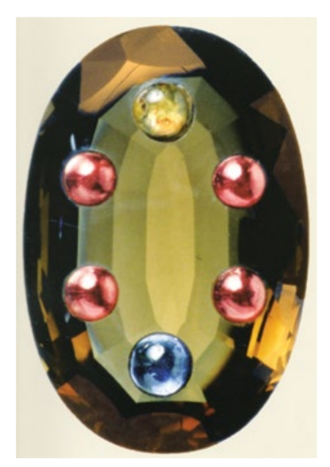
Figure 5: The Medici coat of arms, a Florentine artwork made in 1590–93 that originally decorated the front of the disassembled cabinet of grand duke Ferdinand I (1587– 1609). It provides a good example of the need for scientific gemmology to be applied to historical jewels. The faceted 6 \times 4 \times 2 cm stone was originally believed to consist of a 'topaz of Spain' (citrine), and was set with six half-spheres of rock-crystal (four had backs painted in red, one in blue and one was left unpainted). The half-spheres simulate rubies, a sapphire and a diamond (Heikamp, 1963). The faceted stone was recently re-identified as a smoky quartz (Fantoni and Poggi, 2012, p. 54, Fig. 1). This artwork is preserved as Inv. 13201 in the historical collection of the Museo di Storia Naturale, Sezione di Mineralogia e Litologia, Università di Firenze.

to determine if Archimedes could accurately test the composition of objects made by two alloyed precious metals, and extended its use to gem materials. He did not even describe the gem materials he measured, but apparently only took for granted the names provided by the merchant(s) who loaned or sold the samples to him, with only the precaution of checking their spelling against Dolce (1565), which was the gemmological reference book in Italian of his time (again, see Figure 4).