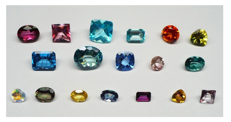
Figure 1 (above and below): Surface-coated topaz specimens treated by various techniques to obtain different colours are available nowadays from various producers. The red cushion-cut stone above weighs ??? and measures ??? \times ???; the blue square-cut stone in the upper row below weighs 5.39 ct and measures 6.1 \times 6.0 mm.

While methods (a) and (b) produce surface coatings which are easily (at least partly) removable or scratched by normal wear of the faceted stones, techniques (c) and (d) claim a more permanent surface coating. Although 'diffusion into the