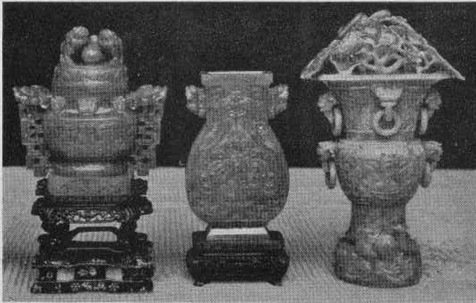
Carved Jade Vases

By the Chinese, jade is valued above all other worldly possessions; it is even used as specie in the payment of debts. The Chinese believe that the five cardinal virtues—charity (love), modesty, courage, justice, and wisdom—are united in this gem. It is considered the emblem of constancy, happi-