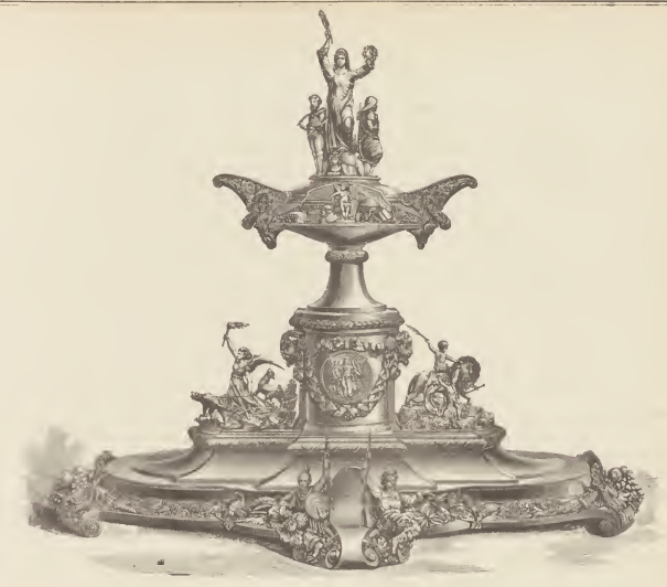
APPLETON'S ART JOURNAL. BY PRIMINSON.