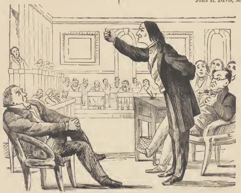
MR. HAIRSPRINGTWISTER :- "JUST LET ME GET HOLD OF HIM ONCE !"