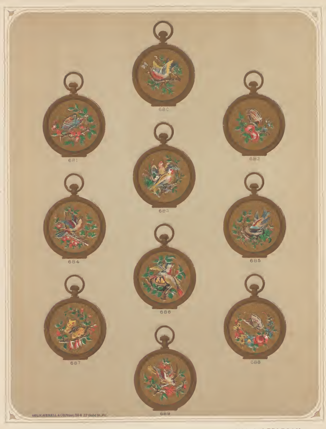
EXAMPLES OF ENAMEL WORK INTRODUCED BY ROBBINS & APPLETON. 1 BOND STREET, NEW YORK. 8 SUMMER ST. BOSTON 5 TRIBUNE BUILDING, CHICAGO. HOLBORN CIRCUS, LONDON, ENG.