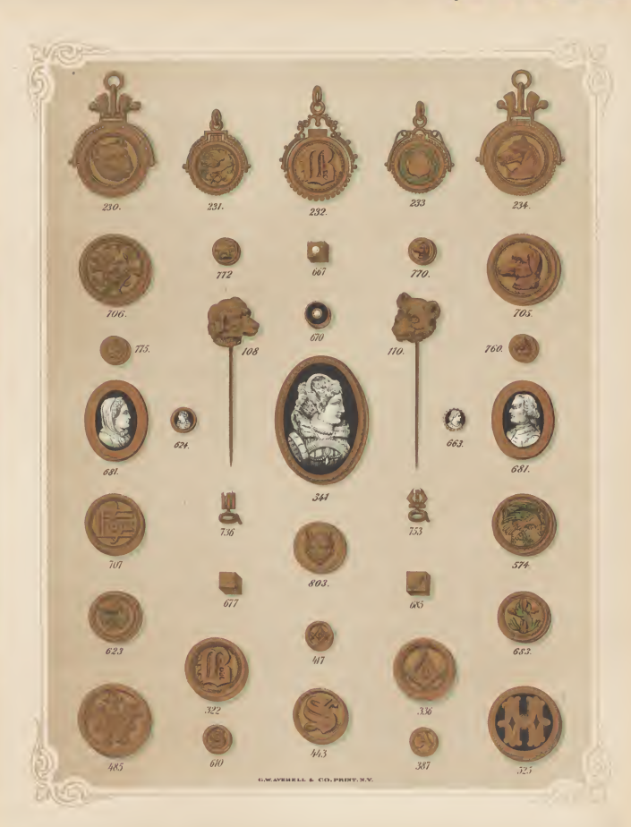
EXAMPLES OF FINE JEWELRY, MANUFACTURED BY MILLER BROS-11 MAIDEN LANE, N Y.