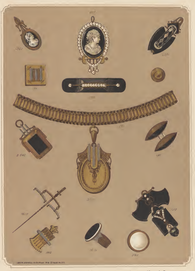
EXAMPLES OF FINE GOLD JEWELRY, FROM THE STOCK OF MULFORD, HALE & COTTLE. THE PLATINUM FURNISHED BY H. M. RAYNOR.