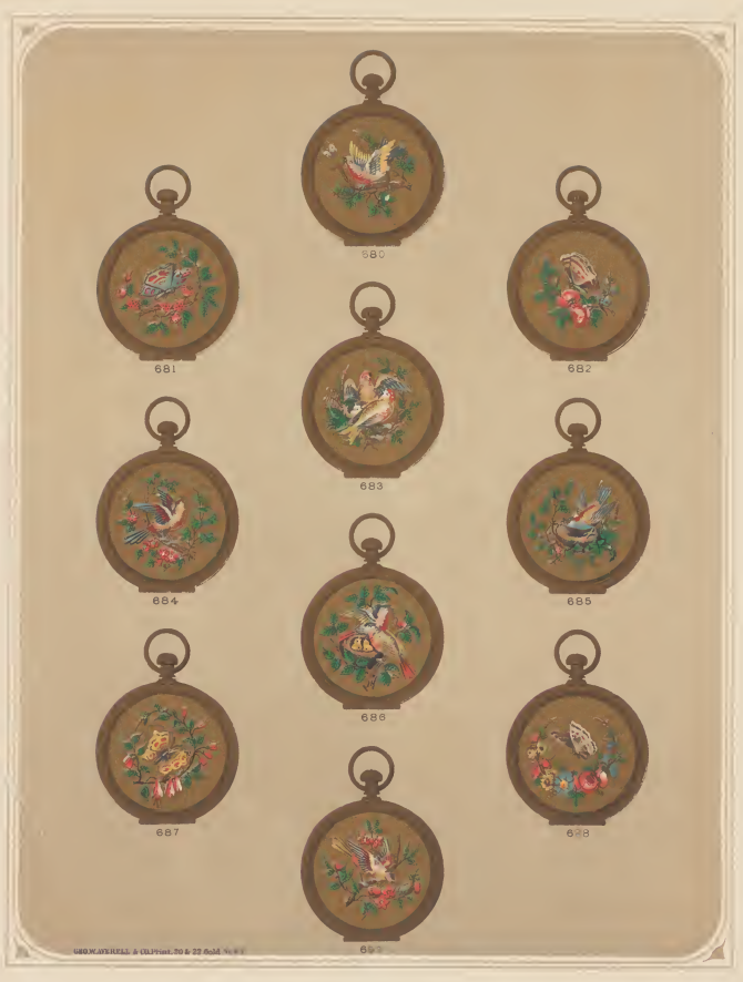
EXAMPLES OF ENAMEL WORK INTRODUCED BY ROBBINS & APPLETON. I BOND STREET, NEW YORK. & SUMMER ST. BOSTON. 5 TRIBUNE BUILDING, CHICAGO. HOLBORN. CIRCUS., LONDON, ENG.