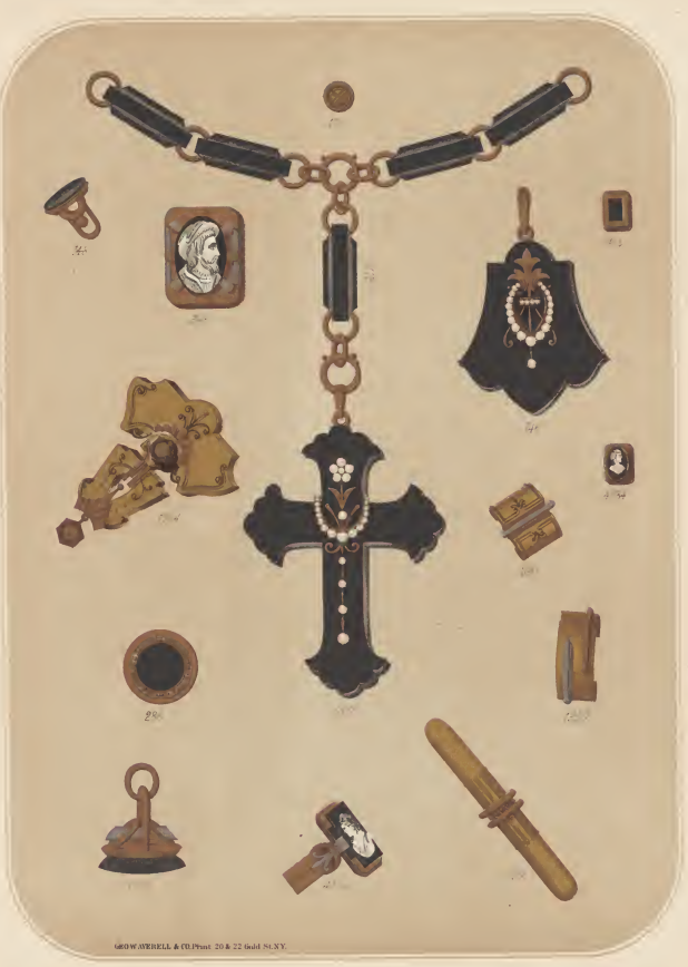
EXAMPLES OF FINE GOLD JEWELRY, FROM THE STOCK OF MULFORD, HALE & COTTLE. THE PLATINUM FURNISHED BY H. M. RAYNOR.