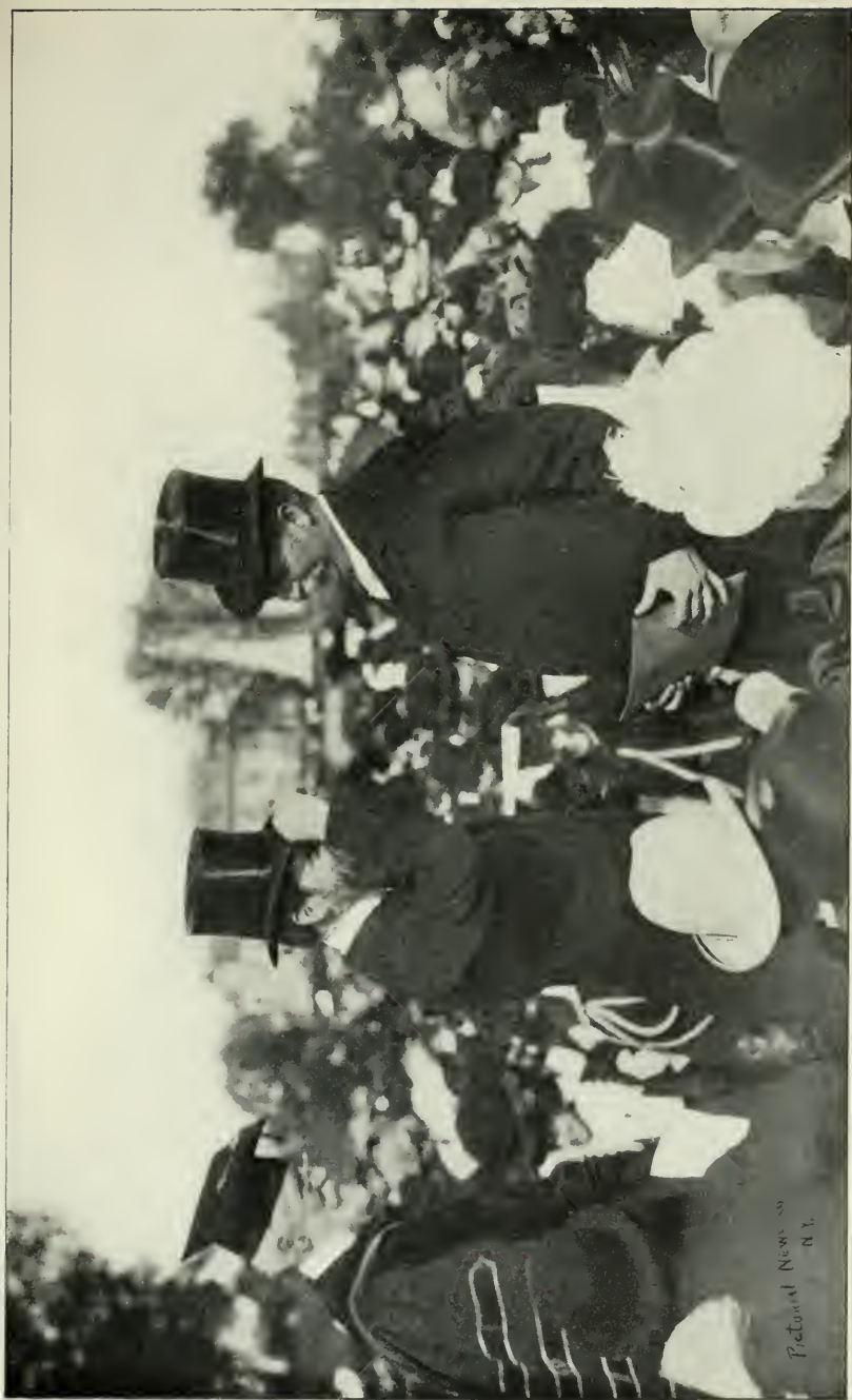
Meeting of the Governors of New York and Massachusetts.