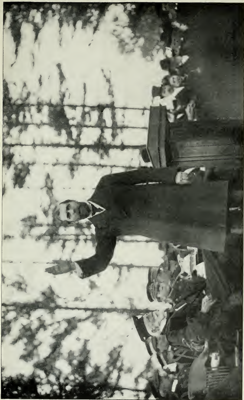
Governor Hughes speaking.