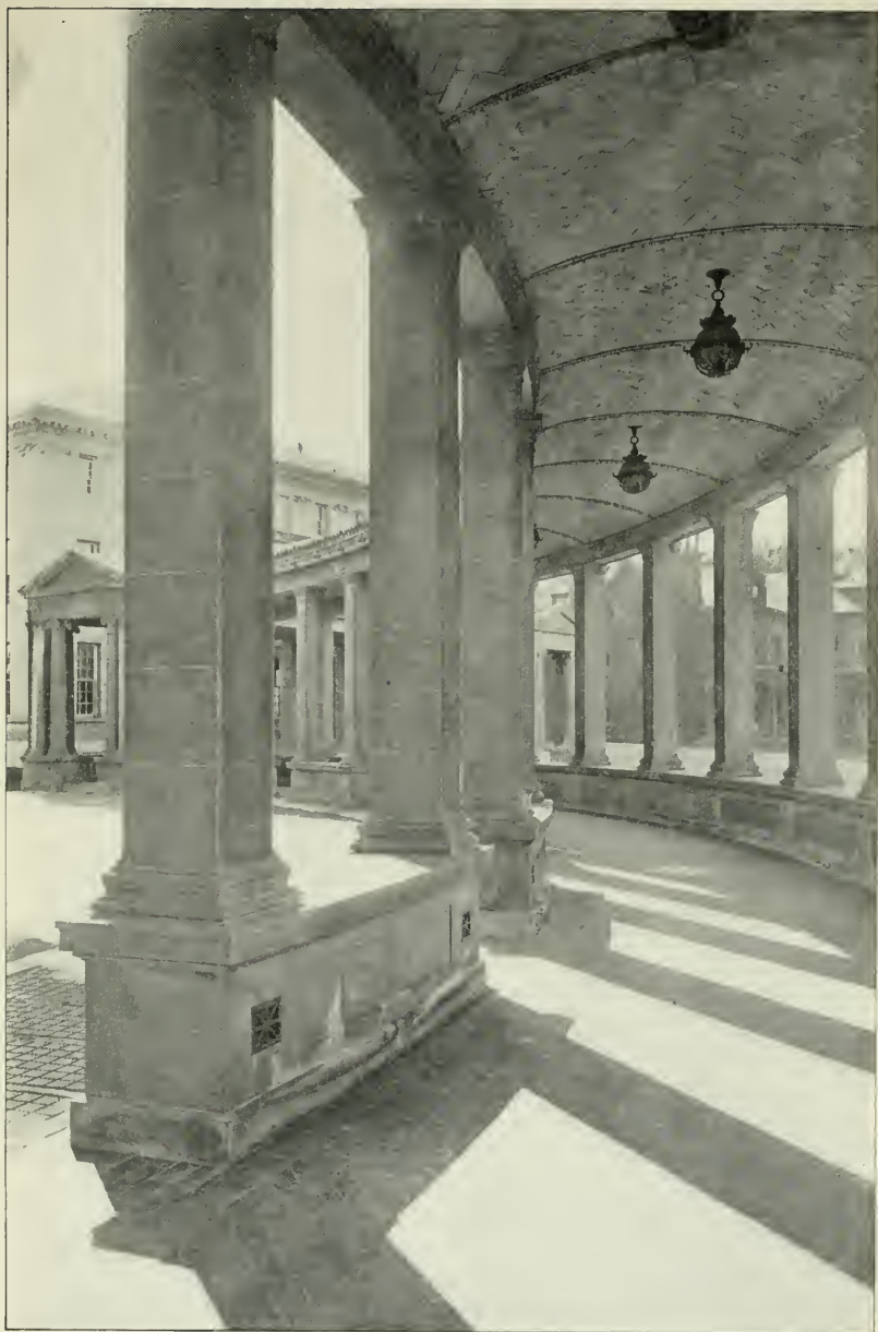
Hall of Fame, New York University, interior of Colonnade.