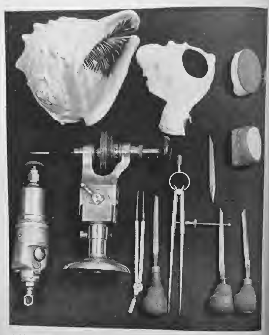
Articles used in cameo cutting. Whole shell at top, back of shell removed, buffer and cameo blank mounted. At bottom are shown an air tool, graver blades and other mentioned articles.

and select the quality and color of the background of the cameo to be carved. If the subject is blond, a lighter section is selected. If brunet a dark section is used. Blond, brunet and beautiful gray hair have been successfully reproduced on this type of shell. Take a pencil and mark a patch about an eighth of an inch larger all around than the finished work is to be. In the same manner as before cut this patch from the last section.