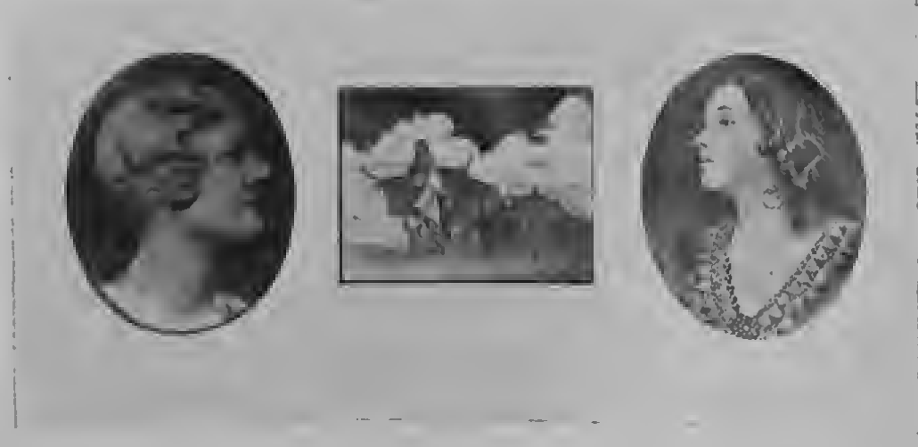
Navajo and Longhorns 1 15/16 inches long Subject unknown Katherine Cornell 1 5/16 inches high 1 15/16 inches long 2 in Note details of hair, cloud effects and embroidery. 2 inches high

After excess material is ent away remove the remaining peneil marks with an eraser and use a hard pencil to resketch the silhouette. Draw more carefully than before as to detail and correctness of the profile and general ontline. Keep in mind that a little material must be left for the very last part of the carving for once material is removed it is gone forever and cannot be replaced. If there