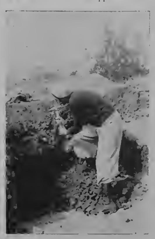
The author picks thunder eggs from a bank on the Priday Ranch.

There are several other beds on the Priday Raneh but we did not visit them for lack of time. Over-night camping is permitted but it is a dry eamp. Water, fuel for fires and warm clothing should be carried for the nights are cold and mountain showers come often. Anyone visiting central Oregon for gemmaterials will not be disappointed.