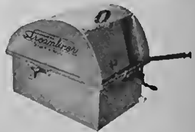
Built by Rockhounds For Rockhounds

Been waiting for that ideal diamond saw? Here it is. The new STREAMLINER designed and built by rockhonnuls for rockhonnuls. You'll like its neat appearance, excellent workmanship and sturdiness. Other features are its all-metal construction, positive action vise, sensitive gravity feed control, calibrated scale control for setting saw, and splash-proof design.