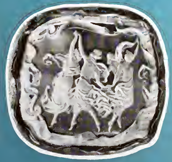
By Raymond Addison

APRIL , 1947 A National Magazine for GEM CUTTERS + COLLECTORS + JEWELRY CRAFTSMEN Hollywood, California