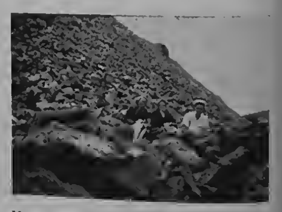
Mrs. Peters' party sitting in the midst of thousands of tons of obsidian.

right leads south to a shepherd's cabin where we parked. Glass Buttes have an elevation of 6390 feet although the two buttes are not quite 1900 feet above the surrounding plateau. These buttes, dating from the late Tertiary period. are extrnsions of volcanie glass or obsidian. Large chunks have weathered out of the surrounding material and are plentiful ou the low hills. My "pack horse" and I gathered much interesting material here. We found iridescent obsidian in almost every hue: rose, blue, green, purple and soft rainbow-like shades. We gathered three flow chunks of black, brown and clear gray obsidian and we found a rich amber shade which facets heautifully and looks like a lovely dark topaz. Silver sheen obsidian is plentiful aud I have seen some gold sheen that rivals the manufactured "goldstone" in brilliance. The iridescent obsidian must be sawed across the rainbow to get the best color effect. It makes beautiful eaboehons for use in jewelry that will not receive hard wear.