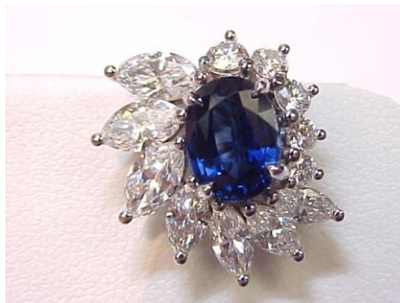
close up earring 2