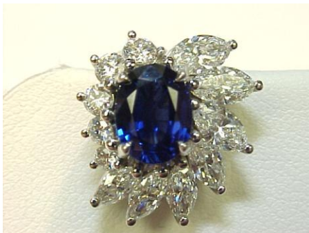
close up earring 1