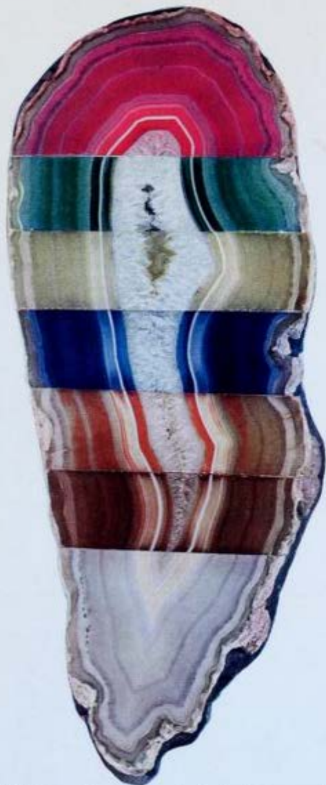
Section of polished agate, showing natural color at the lower end, and on the remainder various artificial colors.