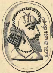
No. 16; real size.