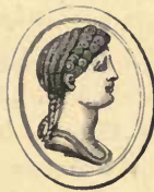
No. 7; one and a half times full size.