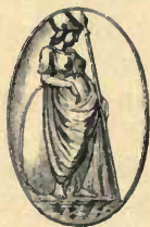
No. 22; one and