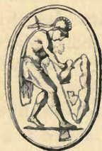
No. 133; one and