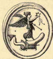
No. 46; one and a half times full size.

memory of his great naval victory over Ptolemy Soter I., off the shores of Cyprus in 306 B.C., which gave him command of the Mediterranean sea.