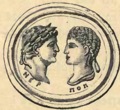
No. 79; one and a half times full size.