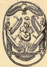
FIG. 2. Phoenician scarab of exceptionally delicate workmanship, dating probably from the 8th century B.C. The device consists of various sacred Egyptian and Assyrian symbols, arranged, without regard to meaning, simply as a decorative device. In the centre is the Egyptian god Horus seated on a lotus flower, between two winged cherubim of Assyrian style: at the top is the winged orb of the sun, the symbol of the sun-god Ra. One and a half times full size.

They apparently belong to a more purely native strain of art development than the gems of the next period, the eighth and seventh centuries B.C., which by their scarab form and the style of their devices indicate a strongly-marked Egypto-Assyrian influence which to a large extent appears to have resulted from the extensive Phoenician trade with Greece, and also from