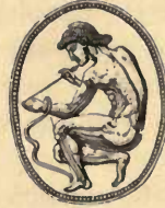
FIG. 3. Greek scarabaeoid of the best period of art about 480—460 B.C., and of the finest workmanship: one and a half times full size . In a private collection.

feeling the point of one of his arrows. He wears long hair, tied up behind his head like the marble statues of athletes, which