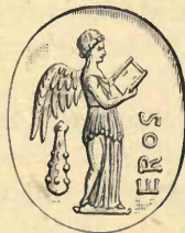
No. 40; double full size.