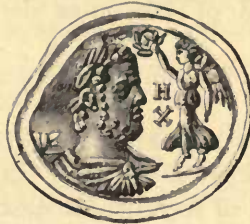
No. 81; one and