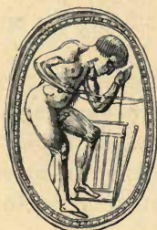
FIG. 4. Gem in the British Museum which shows an engraver at work using the bow and drill. Double full size.

Fig. 4, a very interesting Greek gem of the fifth century B.C. Greek gem-cutter. represents an engraver using the bow and drill on some small