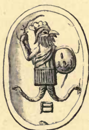
No. 13; real size.

On the back is a list of mystic Gnostic names—ΜΙΧΑΗΛ — ΓΑΒΡΙΗΛ — ΟΥΡΙΗΛ — ΡΑΦΑΗΛ — ΑΝΑΝΑΗΛ — ΠΡΟ- ΣΟΡΑΙΗΛ — ΥΑΒΣΑΗ, Michael, Gabriel, Uriel, Raphael, Ananael, Prosoraiel, Uabsae (Absael), the Angels in charge of the seven aeons.