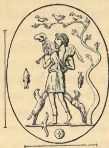
No. 48; the lines show the real size.