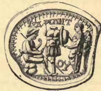
No. 101; one and a half times full size.