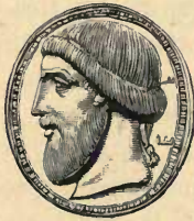
FIG. 7. Head of Zeus, of finest Greek work, illustrating the use of the diamond point, especially for the hair. In the British Museum. One and a half times full size.

Most of the details and all the artistic finish of a well Finish of gems. engraved gem was given by the use of the diamond-point, which allowed an amount of freedom of touch in the artist's hand far beyond what could be got with any of the other more mechanical tools. It was however much more laborious to use it, and Use of diamond-point. required great technical skill on the part of the engraver. By working over and over the same place with the point its scratchy lines could be got rid of, but on some of the gems of finest style and period the artist has not troubled to do this completely, and has left some of the original lines in a way that adds to the spirited beauty of the gem, though at a sacrifice of high finish. This is a point in which the mediaeval or modern forger is specially liable to fail; he is usually too careful to leave no trace of the actual tool-work.