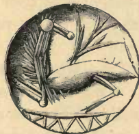
FIG. 6. Early "lenticular" gem, showing the use of the wheel, the drill and the diamond-point. Real size. The material is rock crystal.

Fig. 6, a lenticular gem, in the British Museum, dating