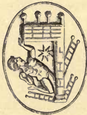
No. 100; double full size.