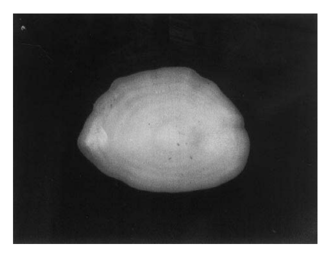
Figure 3 An otolith (ear bone) of an abyssal macrourid ( Coryphaenoides rupestris ) showing growth zones similar to the annual rings in shallow-water fish. If these rings are annual then this fish will be 6 years old.

The otoliths (earbones) of most deep-water fishes have well defined opaque and transparent zones typical of those found in shallow water where, at least in temperate latitudes, they correspond to seasonal changes in growth and hence can be used to age the fish (Figure 3). In shallow water the broader opaque zones are associated with faster summer growth, but it is not so obvious why fish living in the aseasonal deep sea should have changes in growth rate, unless they are linked to seasonal changes in food availability and/or quality. Although otoliths, and sometimes scales, have been used to estimate age of deep-water species on the assumption that the rings are laid down annually it has seldom been possible to directly validate these age estimates except in juvenile specimens. Radiometric aging, although controversial, has tended to confirm the generally held view that many deep-water species are long-lived. The commercially exploited grenadiers (Macrouridae) can live to about 50 years and the orange roughy in New Zealand waters lives to more than 100 years.