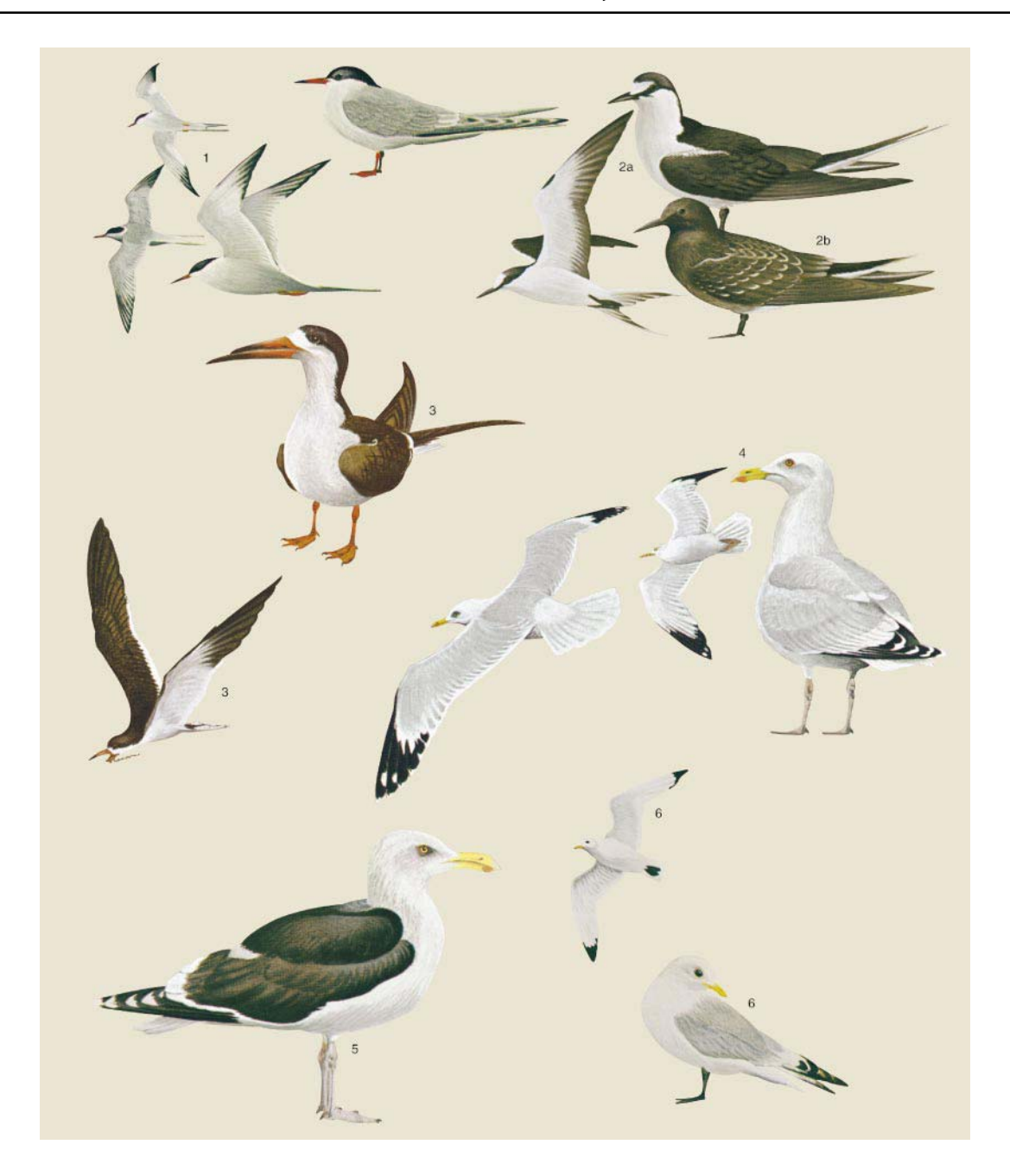
Figure 1 Examples of gulls, terns and skimmers. (1) Common tern ( Sterna hirundo ) Adult, breeding plumage. Length: 36 cm; wingspan: 80 cm; approximate body mass 120 g. Range: Widely distributed in Northern Hemisphere during breeding season, and coastal oceans of the world during the non-breeding season. (2) Sooty tern ( Sterna fuscata ). Other names: Wideawake. (a) Adult; (b) juvenile. Length: 44 cm; wingspan: 90 cm; approximate body mass: 195 g. Range: Tropical Oceans. (3) Black skimmer ( Rynchops niger ). Adult, breeding. Length: 45 cm; wingspan: 117 cm; Range: Coastal waters and some rivers of North and South America. (4) Herring gull ( Larus argentatus ). Adult, breeding plumage. Length: 61 cm; wingspan: 139 cm; approximate body mass: 1160 g. Range: Widespread in coastal waters of North Pacific and North Atlantic Oceans. Also along coasts of Mediterranean Sea and Indian Ocean. (5) Great black-backed gull ( Larus marinus ). Adult breeding plumage. Length: 75 cm; wingspan: 160 cm; approximate body mass: 1680 g. Range: North Atlantic Ocean. (6) Kittiwake ( Rissa tridactyla ). Other name: black-legged kittiwake. Adult breeding plumage. Length: 41 cm; wingspan: 91 cm; approximate body mass: 385 g. Range: North Pacific, North Atlantic and Arctic Oceans. Illustrations from Harrison P (1985) Seabirds, an identification guide. Revised edition. (Boston, Massachusetts: Houghton Mifflin).