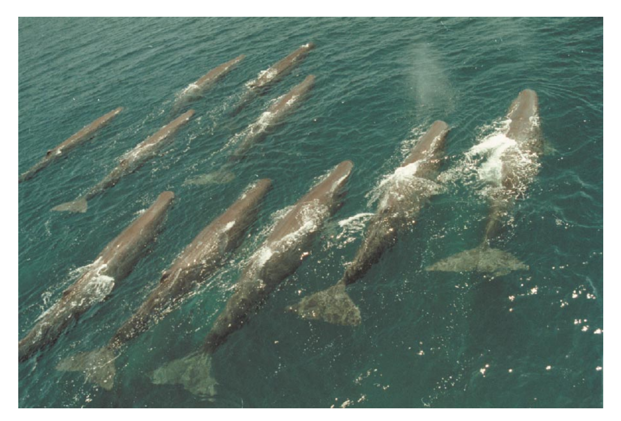
Figure 3 Group of female and juvenile sperm whales off the Galapagos Islands.

Whalers observed that sperm whale groups often exhibited epimeletic behavior, with individuals supporting and staying with harpooned, injured, and even dead group members. It is thought that this may be a result of the close genetic ties between the individuals in a group. Sperm whales have also been observed to exhibit allomaternal care (babysitting behavior). Calves remain on the surface when a group is feeding, presumably since they are unable to dive to the depths at which adults forage, and