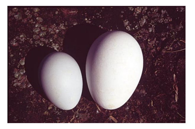
Figure 6 Extreme egg-size dimorphism in erect-crested penguin eggs.

a single clutch of two eggs, they only ever fledge one chick. Moreover, the eggs are of dramatically different sizes, with the egg laid second being substantially bigger than that laid first (this form of egg-size dimorphism is unique among birds). In those species with the most extreme egg-size dimorphism (erectcrested, royal/macaroni), the second egg can be double the size of the first egg ( Figure 6 ). Furthermore, although the laying interval between the first and second eggs is the longest recorded for penguins (4–7 days), the chick from the large second-laid egg usually hatches first.