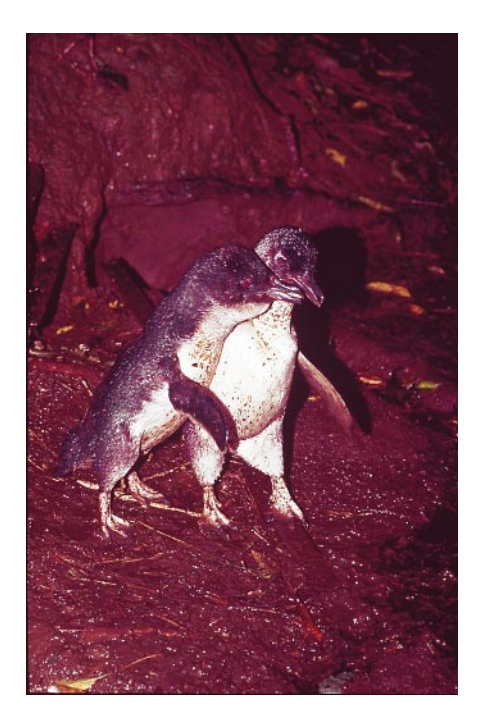
Figure 3 Little penguin chick, almost ready to fledge, begging for a meal from its parent.

penguins the plumage on the backs has more of a blue hue compared to the blackish coloration of other penguins (Figure 3).