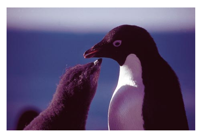
Figure 7 Adélie penguin with chick.

In some ways the breeding of king penguins is even more remarkable. It takes them over a year