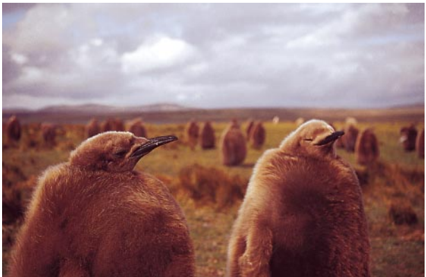
Figure 8 King penguin chicks on the Falkland Islands.