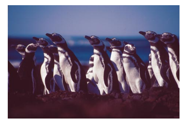
Figure 2 Magellanic penguins.