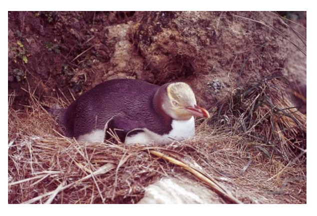
Figure 4 Yellow-eyed penguin on nest.

Typically they are described as inshore foragers (with foraging trips lasting 1–2 days), but there is evidence of plasticity in their feeding strategies. In some locations or in years of poor food supply, they may feed considerably farther offshore, with a concomitant increase in the duration of their foraging trips (up to 7 days or more).