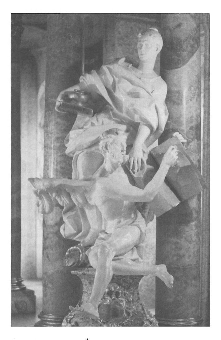
Entre la DélHIRURE par li temps aile' et l'écriture de l'Abstise et son stylet