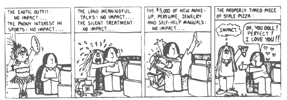
Cathy © 1986 Cathy Guisewite. Reprinted by permission of Universal Press Syndicate. All rights reserved.

Have you ever seen $10,000 in one dollar bills strewn about someone's living room? Well, neither have I—but one woman in the Romance Class reported that's what her husband did with a commission check he received one year after a big sale. He handed her a rake and said, "Honey, whatever you can fit into this paper bag is yours to spend!" (Being rather clever herself, she stacked the bills neatly and walked away with all of it!)