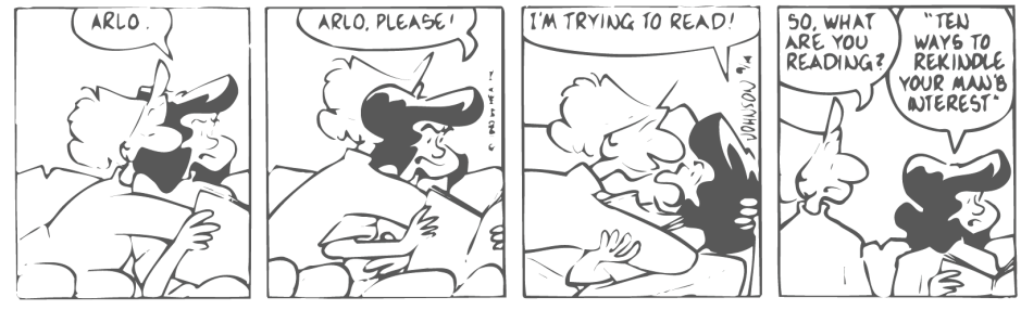
Arlo & Janis © 1993. Reprinted by permission of Newspaper Enterprise Association, Inc.