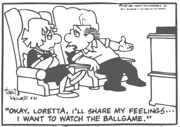
The Lockhorns

624 Sports fans love sports memorabilia. Pennants, posters, T-shirts and caps from favorite teams, signed photographs and signed balls—all make great gifts. And of course, there's always season tickets!