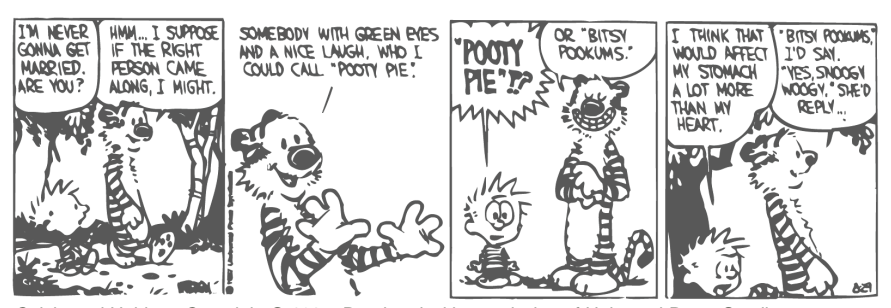
Calvin and Hobbes

874 During their seven years of dating he'd given her many flowers. During their long-awaited wedding ceremony she surprised him with a roomful of flowers—the very flowers he had given her. She'd had every flower he'd ever given her carefully and lovingly dried or pressed.