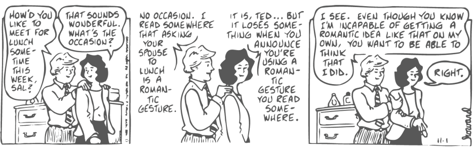
Sally Forth © 1998. Reprinted by permission of North America Syndicate, Inc.

329 Give your partner choices: Classic or avant-garde? Conservative or outrageous? Public or private? Here or there? Loud or quiet? McDonald's or Burger King? Big or small? Light or dark? Fast or slow? Today or tomorrow? Active or lazy? One or many? Gold or silver? Red or blue? Day or night? Expensive or inexpensive? Now or later? Right or left? Modern or antique? Serious or funny?