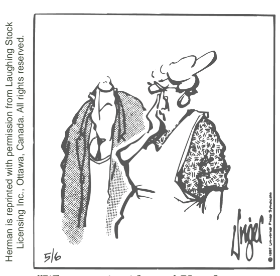
"What a coincidence! You forgot my birthday and I forgot how to cook."

596 Declare your lover's "Birthday Month," and do something special every day for the thirty days preceding THE day.