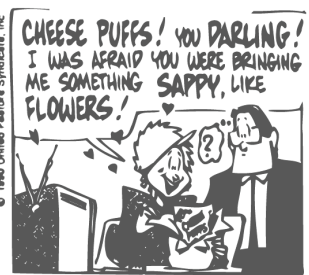
Rose Is Rose reprinted by permission of United Feature Syndicate, Inc. © 1990.

306 Contrary to popular belief, you should not use romance to apologize after a fight! If you do, you'll taint all your romantic gestures for a long time to come. (After a fight, a simple, sincere apology is best. Resume romantic gestures after you've both cooled down, or after a week—whichever is later.)