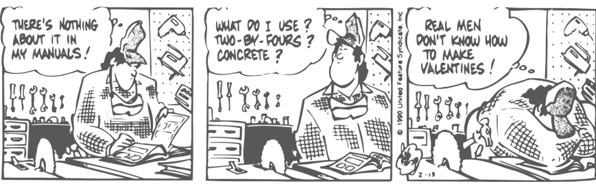
Rose Is Rose reprinted by permission of United Feature Syndicate, Inc. © 1990.

801 Keep your eyes open for pre-Valentine's Day articles in magazines and newspapers. Rip out the articles, circle the best ideas, and plan accordingly. (And don't forget to keep those articles for future reference!)