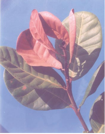
Shoot drying due to TMB