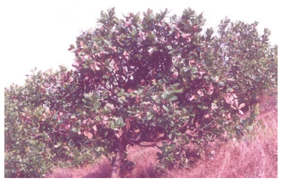
TMB damage on tree