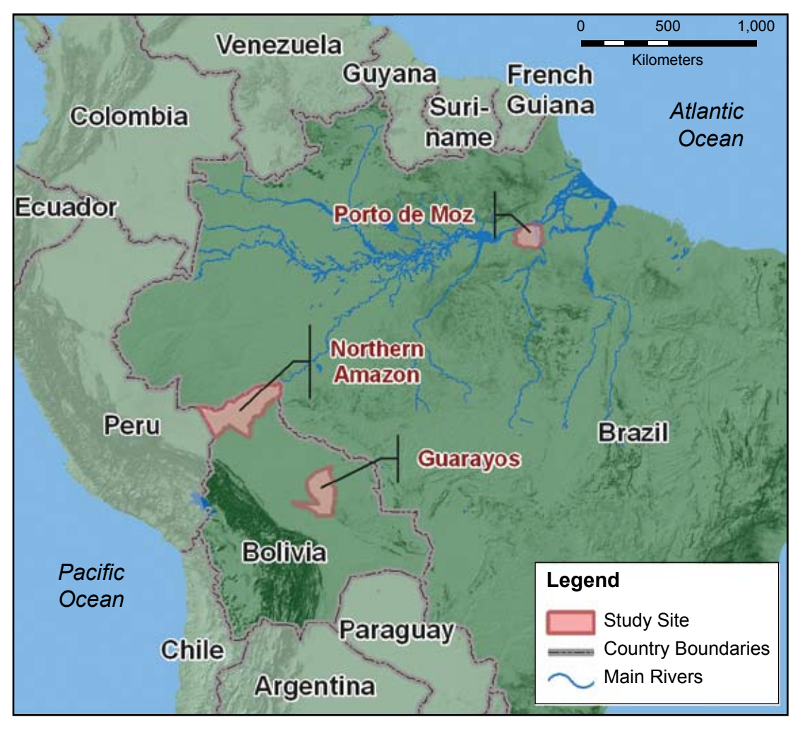
Figure 1. Map of the study sites in Bolivia and Brazil

an increasingly important contribution to household incomes in all the regions studied. Recognizing the context in which local forest users develop their livelihoods is fundamental for understanding the role of informal institutions for forest resources management, the impact of the formalization of community property rights, and the introduction of legal frameworks to promote sustainable forest management and formal market integration. Table 1 summarizes the relevant ecological and socio-cultural characteristics of the selected regions.