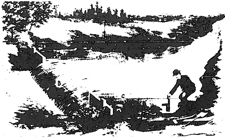
Measuring Flow of Water by Weir Method

After deciding upon suitable location for the new power plant, the following preliminary measurements must be obtained: