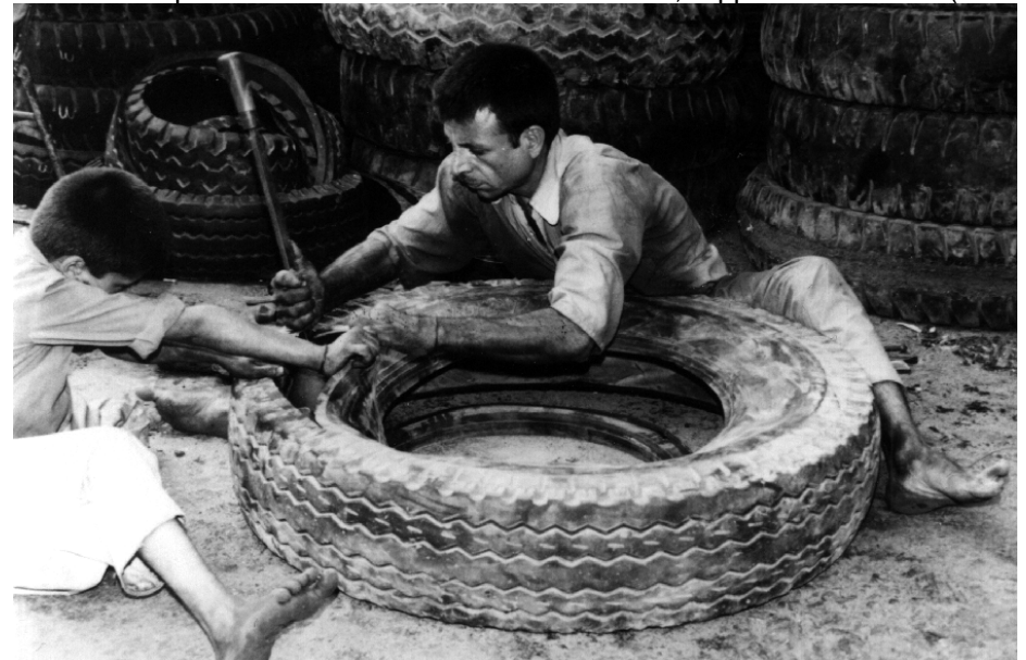
Figure 2: Manual Separation of the Tread from the Sidewalls, Karachi, Pakistan

In Karachi, Pakistan, for example, tyres are collected and cut into parts to obtain secondary materials which can be put to good use. The beads of the tyres are removed and the rubber removed by burning to expose the steel. The tread and sidewalls are separated – the tread is cut into thin strips and used to cover the wheels of donkey carts, while the sidewalls are used for the production of items such as shoe soles, slippers or washers (WAREN Report).