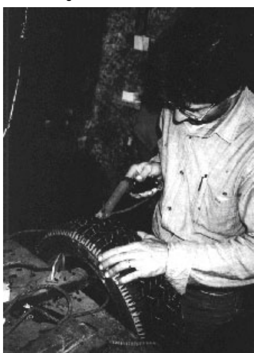
Figure 3: Following the grooves is a Labour –intensive process.

Secondary reuse of whole tyres is the next step in the waste management hierarchy. Tyres are often put to use because of their shape, weight, form or volume. Some examples of secondary use in industrialised countries include use for erosion control, as tree guards, in artificial reefs, fences or as garden decoration. In developing countries wells can be lined with old tyres, docks are often lined with old tyres which act as shock absorbers, and similarly crash barriers can be constructed from old tyres. Old inner tubes also have many uses; swimming aids and water containers being two simple examples.