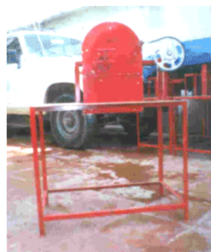
Figure 2: A simple slicing machine used in Bolivia. http://www.fao.org/inpho/content/compend/text/ch29/ch29_02.htm

The rhizomes are sliced before drying to reduce the drying time and improve the quality of the final product (it is easier to achieve a lower final moisture content in small pieces of rhizome without spoiling the appearance of the product). The rhizomes are traditionally sliced by hand, but there are small machines available to carry out this process. Figure 2 is a simple turmeric slicing machine designed in Bolivia. It is a simple structure that contains a transmission system and two stainless steel circular blades. The machine is easy to build and maintain and can cut up to 120kg turmeric per hour.