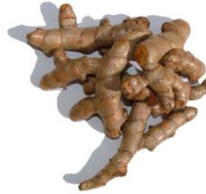
Figure 1: Fresh turmeric root.

Turmeric ( Curcuma domestica ) is an erect perennial plant that is grown as an annual crop for its rhizome. It belongs to the same family as ginger ( Zingiberaceae ) and grows in the same hot and humid tropical climate. The rhizome is a deep bright yellow colour and similar in size and form to the ginger rhizome. The plant originated in the Indian sub-continent and today India is the worlds leading producer and consumer of turmeric. It is also produced in China, Taiwan, Bangladesh, Indonesia, Sri Lanka, Australia, Africa, Peru and the West Indies. Turmeric plays an important role in Indian culture- it is an essential ingredient of curry, used in religious festivals, as a cosmetic, a cloth dye and in many traditional health remedies. The spice is sometimes referred to as 'Indian saffron'.