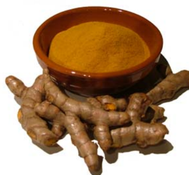
Figure 5: Ground turmeric.

Turmeric is one of the few spices that is usually purchased in a ground form. The whole rhizome pieces may be exported and then ground in the country of destination. Alternatively, the dried rhizomes may be ground at the place of origin.