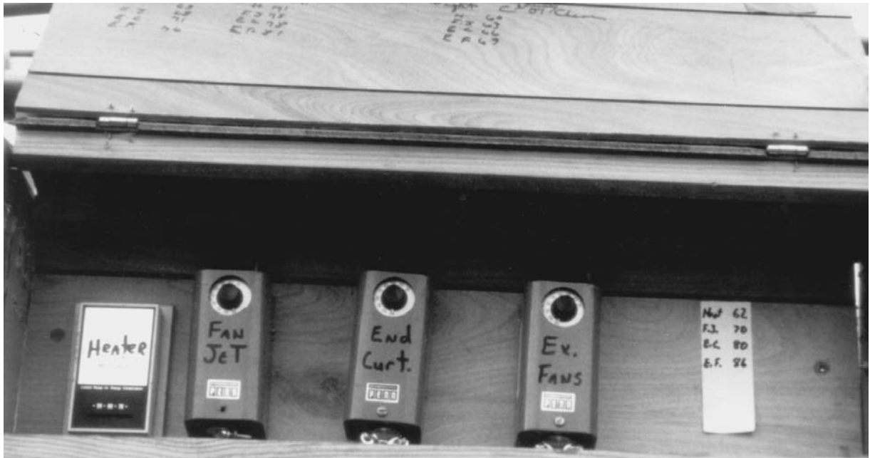
Locating thermostats in a box will avoid direct sun on them. An aspirated box is best.