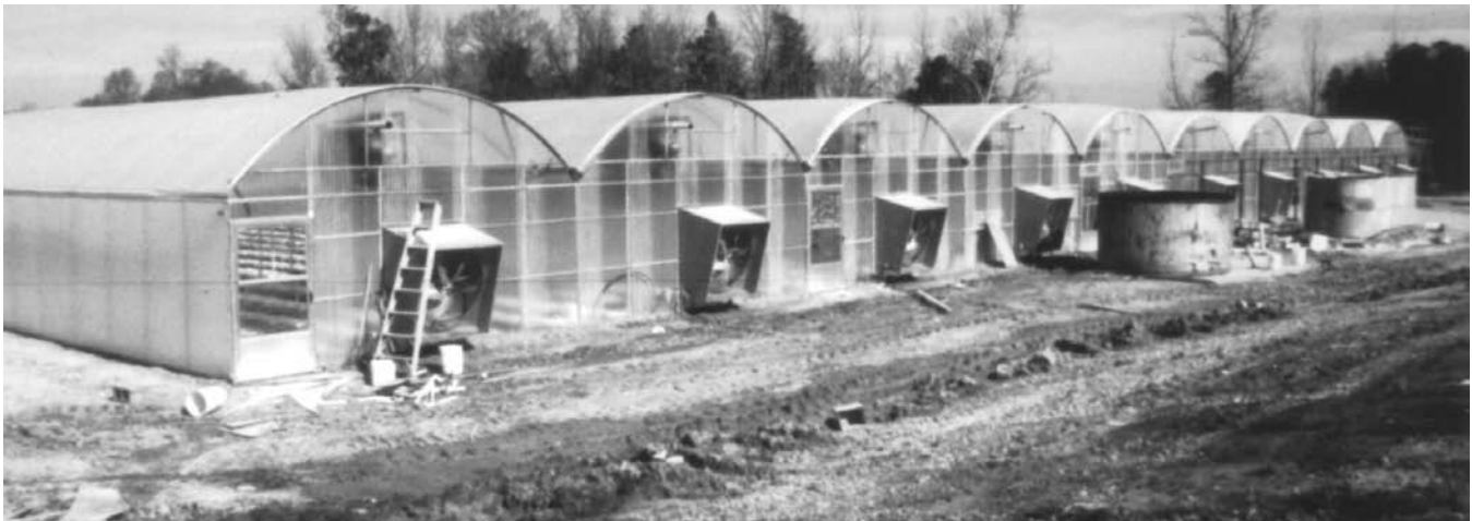
Shown are 10 greenhouse bays in a gutter-connected range (1/2 acre).

To determine how much acid to add to a bulk or concentrate tank of nutrient solution, take 1 gallon of solution and add 1 ml of acid at a time until the pH of the nutrient solution is within the range stated. Then, multiply the amount added to 1 gallon times the number of gallons in the tank. If