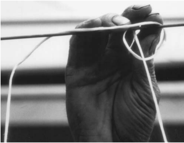
A simple slipknot is used to tie string to the plant support wire.

clockwise, continue clockwise; otherwise, when the plant gets heavy with fruit, it may slip down the string and break. Some growers prefer to use plastic clips to secure the plant to the string, either in combination with wrapping or to replace wrapping.