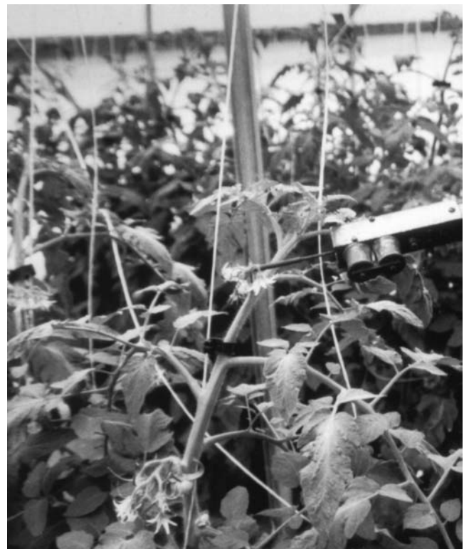
Pollination is best accomplished with an electric pollinator.

As you prune the plant to one main stem, wrap it around the support string. You can prune and wrap in one operation, doing both to a plant before moving on to the next plant. Always wrap in the same direction—if you start