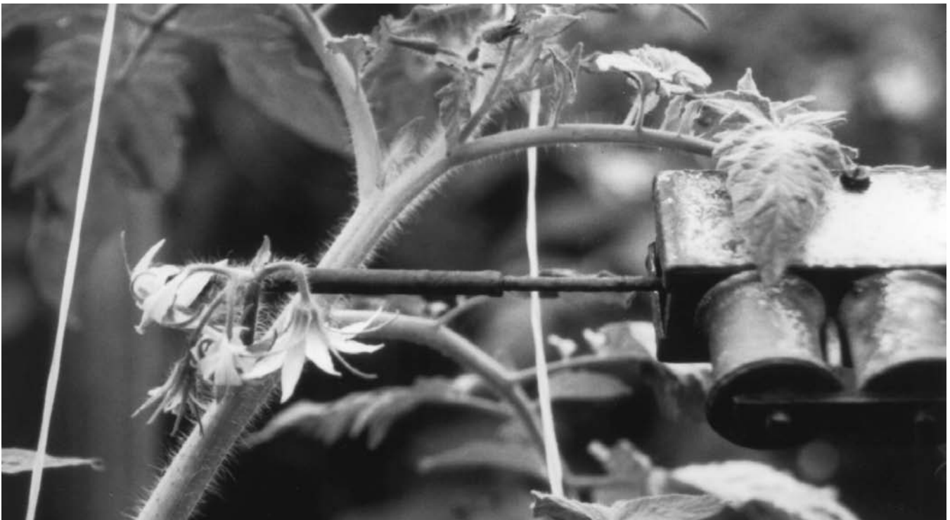
Touch the pollinator wand to the upper side of each pedicel (flower stem). Do not touch individual flowers.

In a hobby greenhouse, the expense of a pollinator is probably not necessary. You can purchase an electric polli-