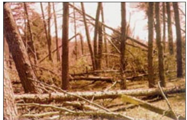
USDA Forest Service