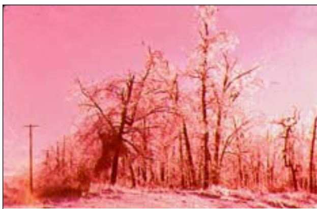
USDA Forest Service

A third damage category is blow-over of trees. Often trees that blow over have root failure from a disease (root rot), from shallow soils or those with shallow hard