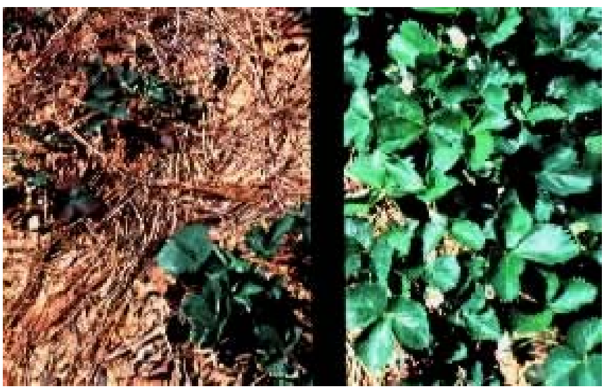
Strawberries infected with Red Stele

Fruit from affected plants is small, sour and few in number. Control is best achieved by removing any plants with coarse roots with no branching rootlets, by correcting faulty drainage that may exist in the berry bed, and, most important, by planting resistant varieties.