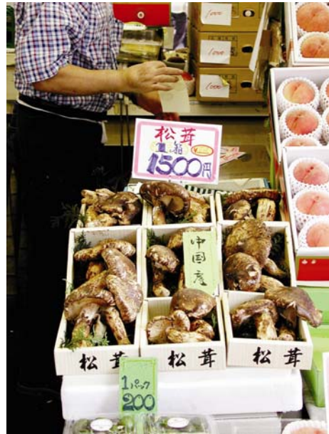
Matsutake on display, Japan