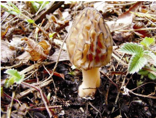
Morchella esculenta , Huang Tong, China