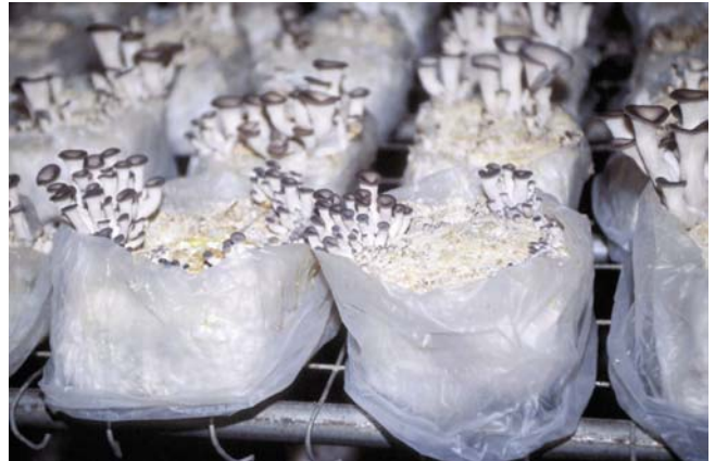
Horizontal shelf with bags