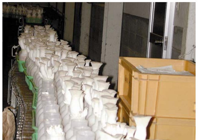
Bottles of king oyster mushroom