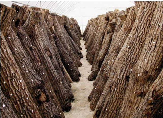
Inoculated logs of Lentinula edodes