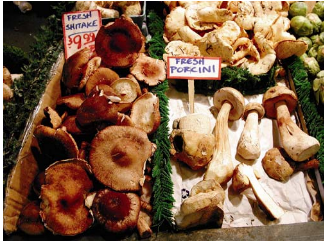
Wild mushroom market, U.S.A.