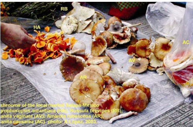
Local market, Mexico (by Armando Lopez)

shrooms of the local market Yaxapa-Mexico grophoropsis aurantiaca (HA), Russula brevipes (RB); anita vaginata (AV), Amanita roborascens (AR), anita caesarea (AC) photo: A. Lopez, 2003.