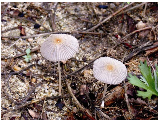
Coprinus plicatilis