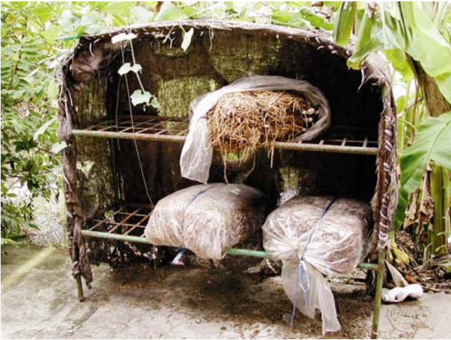
Bag cultivation of Coprinus comatus