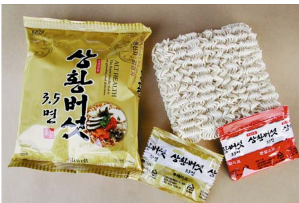
Phellinus baumii instant noodle, Korea