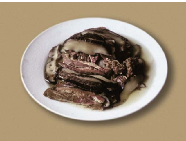
Sandwich with shiitake, China