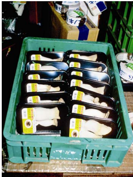
Fresh eryngii, Japan