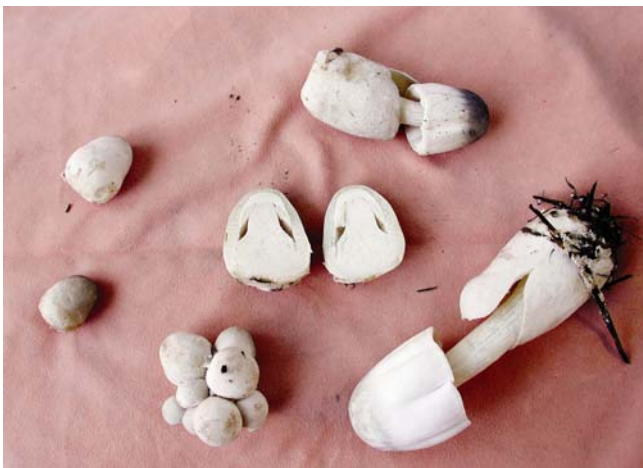
Volvariella volvacea , Shelf, Thailand