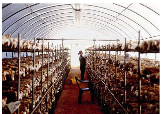
Bags of shiitake mushrooms in a green house