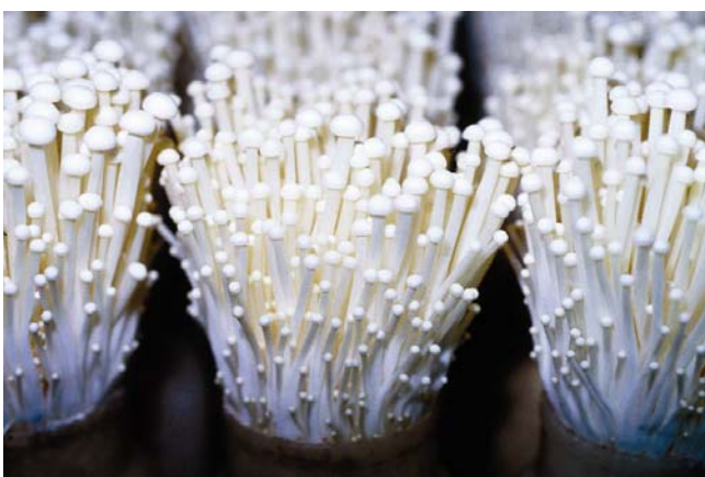
Flammulina velutipes , Bottle, Korea