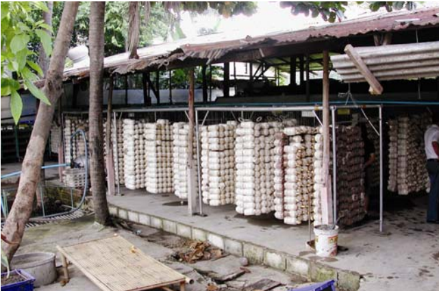
Bags hung in a wall formation