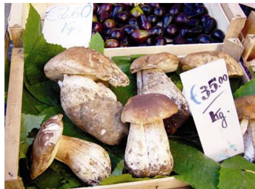
Boletus edulis , Rick Gush, Italia

These wonderful mushroom photos are contributed by MushWorld members from all around the world. You can also show off your mushroom images by contributing to Image MushWorld . Contact at info@mushworld.com http://www.mushworld.com More images (over 2,000) are available at Image MushWorld http://www.mushworld.com/image_search/