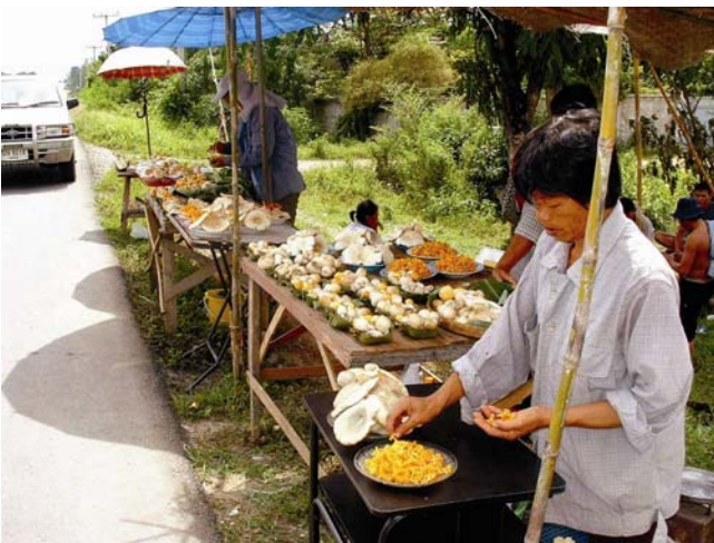
Wild mushrooms, Thailand (by Tawat)