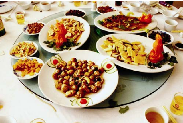
Straw mushroom and eryngii, china