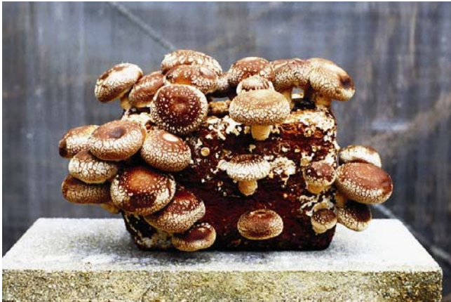
Lentinula edodes , Block, Japan