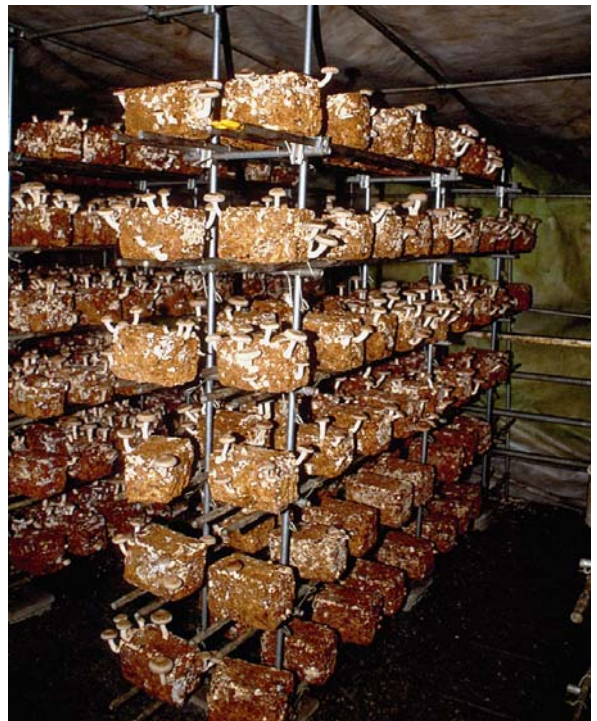
Sawdust blocks of Lentinula edodes