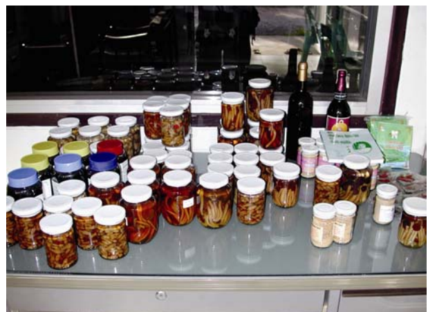
Mushroom pickles and wines, Thailand