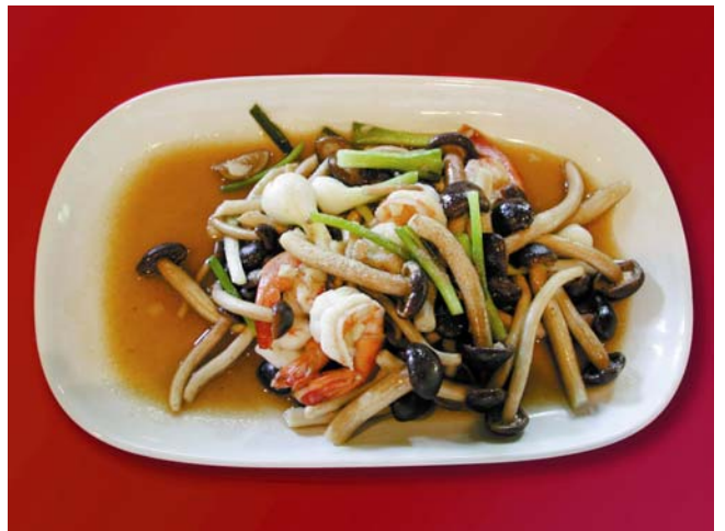
Agrocybe sp., Thailand