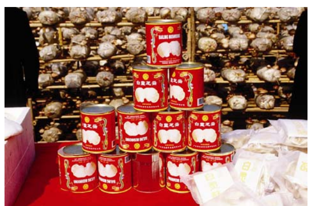
Canned mushrooms, China