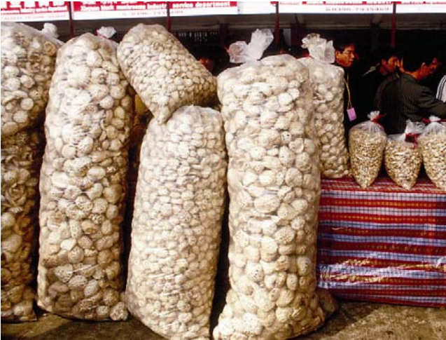
Dried shiitake (Huagu), China