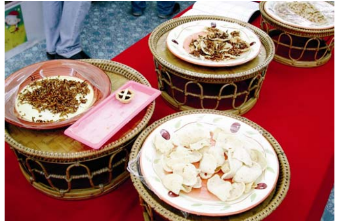
Various mushroom snacks, Thailand