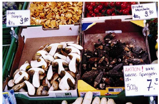
Local market, Switzerland

shrooms of the local market Yaxapa-Mexico grophoropsis aurantiaca (HA), Russula brevipes (RB); anita vaginata (AV), Amanita roborascens (AR), anita caesarea (AC) photo: A. Lopez, 2003.