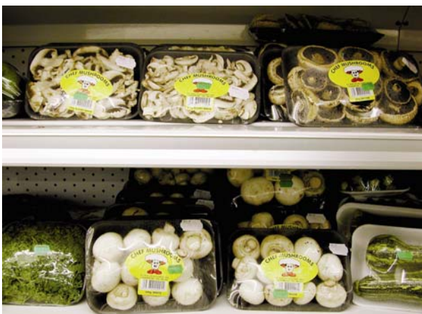
Fresh Agaricus imported from the Republic of South Africa / Swaziland