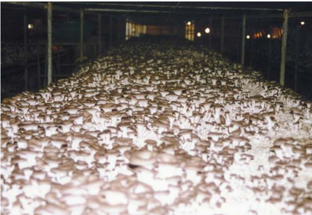
Shelf cultivation of Pleurotus sp.