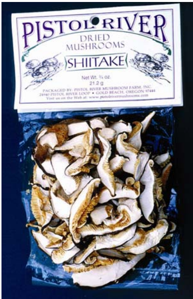
Dried shiitake slices, U.S.A