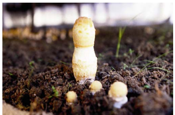
Coprinus comatus , Shelf, China