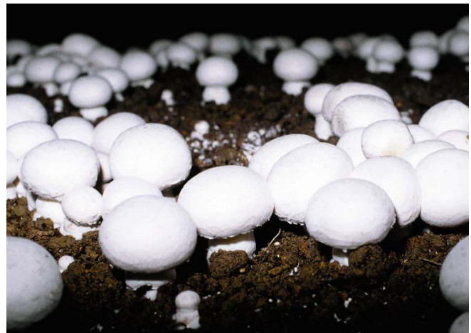
Agaricus bisporus , Shelf, Australia