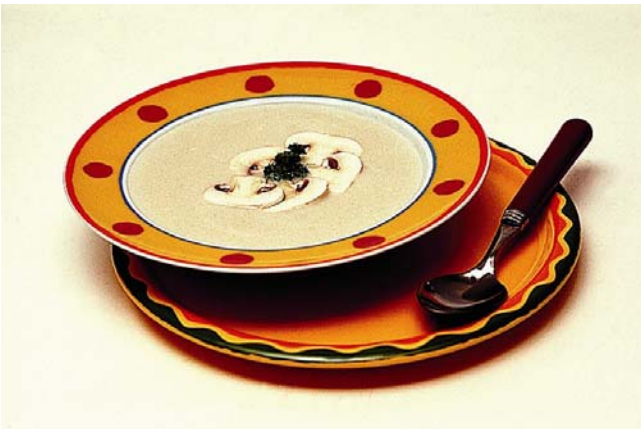
Agaricus mushroom cream soup, France