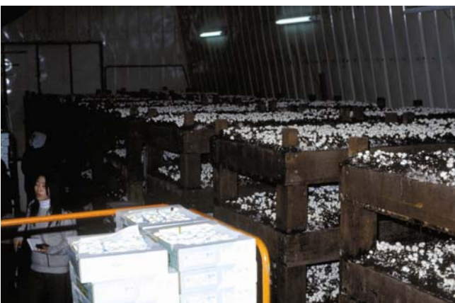
Tray cultivation of Agaricus mushroom