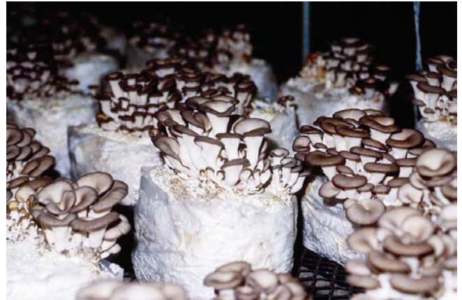
Pleurotus ostreatus , Bag, Korea