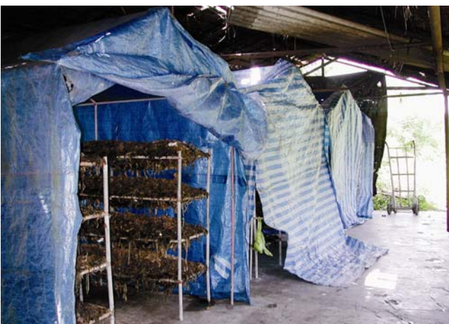
Shelf cultivation of Coprinus comatus