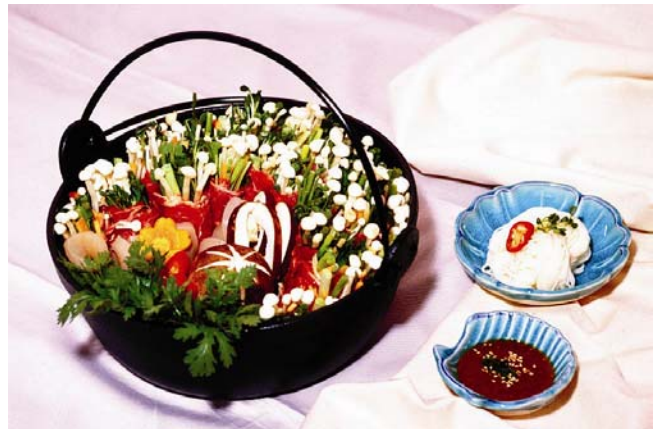
Mushroom shabu-shabu, Korea