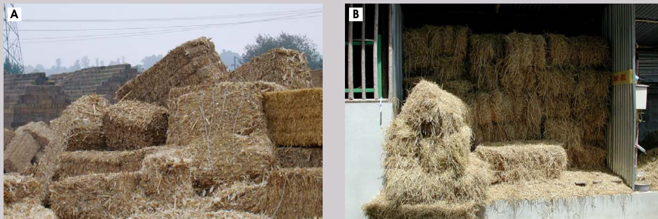
Figure 1. Cereal straw A: Wheat straw B: Rice straw