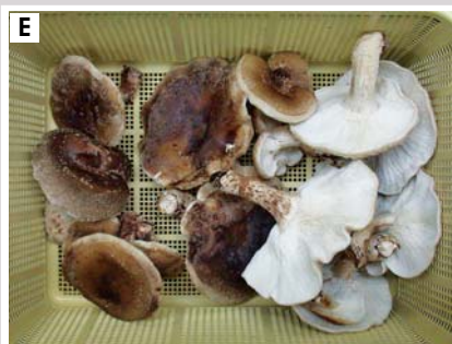
Figure 4. Shiitake fruit bodies production on wheat straw A: Pins with dark cap on the substrate surface B: Young fruiting bodies C: Commercial production of shiitake D and E: Mature shiitake fruit bodies