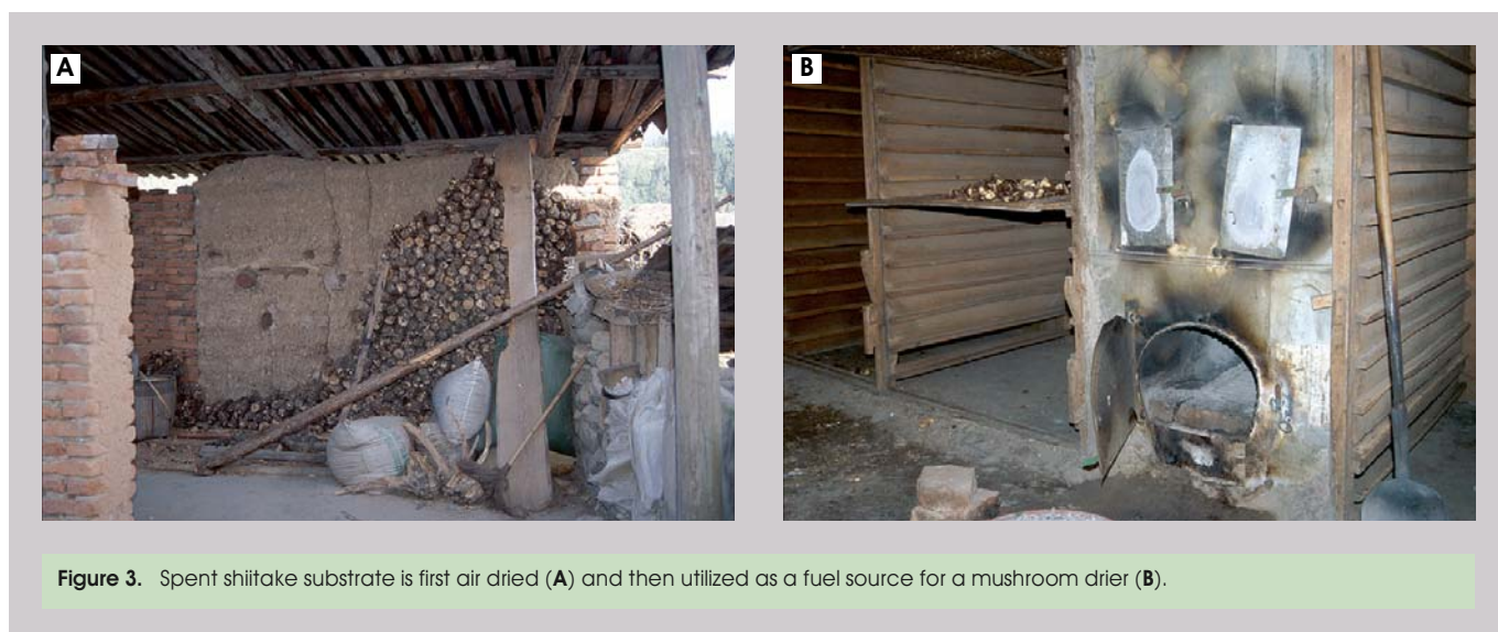
Figure 3. Spent shiitake substrate is first air dried (A) and then utilized as a fuel source for a mushroom drier (B).

7. Alternative fuel. Spent shiitake logs have been used as alternative fuel (Dias, E. S., Brasil, pers. com.; Pauli, 1999) (Figs. 3).