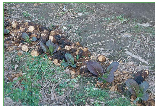
Figure 2. Spent shiitake substrate used as a crop fertilizer in China

4. Cultivation of other species. Lentinula edodes spent substrate has been recycled in the production of other mushroom species such as Pleurotus spp. (Jaramillo, C., Colombia, pers. com.; Royse, 1992; Nakaya et al. , 1999), or mixed into Agaricus substrate (Jim Yeatman, USA, pers. com.).