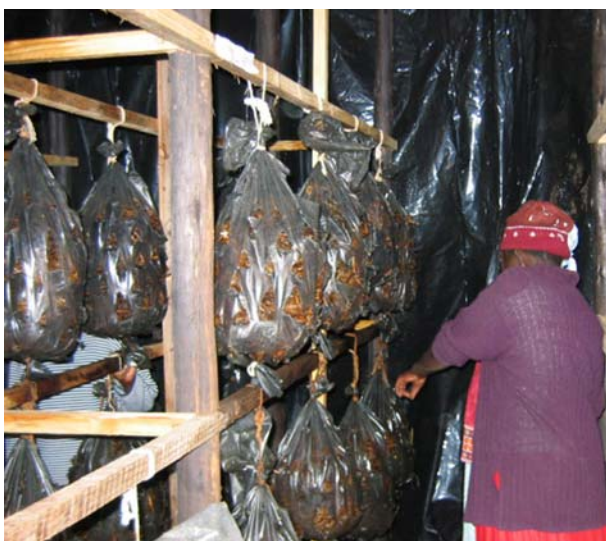
Figure 1: Growing oyster mushrooms in plastic bags inside a mushroom growing house in Zimbabwe.

This knowledge is no longer being passed on, especially in urban areas so people are becoming reluctant to eat wild mushrooms. The uptake of mushroom cultivation has been more noticeable in urban areas.