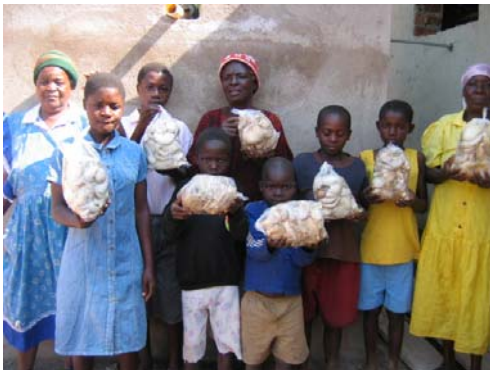
Figure 5: Oyster mushrooms ready for market.

Many mushrooms are sold fresh to retail outlets. Marketing of fresh mushrooms presents particular problems as they should be consumed within three or four days of harvesting to avoid spoilage. Often they are harvested in the day and sold in wholesale markets during the early hours of the following morning, or delivered directly to supermarkets and caterers.