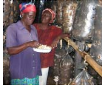
Figure 4: Harvesting

The total amount harvested from a stack can be 3 to 4kg. Once the harvest is complete the substrate is depleted and can not support any further crops. It is usually then used as a fertiliser for other crops.