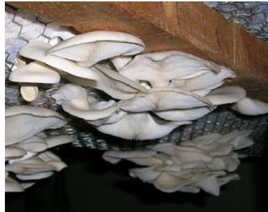
Figure 2: Oyster Mushrooms ( Pleurotus ostreatus ).

There has been a great amount of research into mushrooms and their cultivation in temperate climates but relatively little on varieties suitable for tropical climates although interest in this area is growing. Many commercial mushrooms only fruit at around 20°C and are therefore not suitable for tropical regions. Suitable tropical strains are harder to obtain but some commercial strains can be ordered such as strains of Agaricus bitorquis that fruit at 28°C.