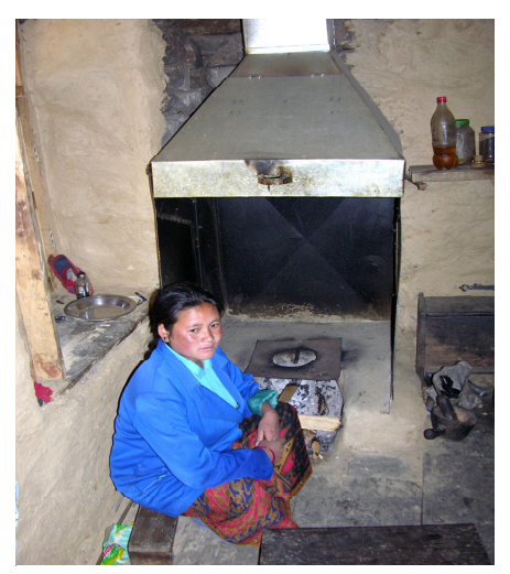
Figure 3 Woman sitting beside smoke hood, Nepal.

In Kenya, a well-known low-cost upesi stove is built under the hood in place of the open fire, as in Figure 2. The upesi is a well accepted ceramic stove which can be built into a base, with the hood set over the top to provide a neat safe environment – reducing the risk of burns and reducing the fuel costs. Currently, another type of stove, built on a principle called a 'rocket' stove, is being researched. If this research proves successful, the stove will reduce emissions and fuel costs, and the smoke hood can still be used for venting any residual smoke up the smoke hood. The smoke hood is sufficiently versatile to allow these changes to happen.