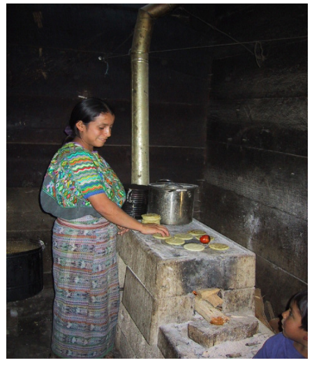
Figure 1: A well-designed chimney stove disseminated by HELPS International in Central America

In theory, a chimney stove seems a perfect solution. With nowhere else to go, the smoke vents into the open air outside the house. A well-constructed and maintained chimney stove can get rid of most of the smoke.