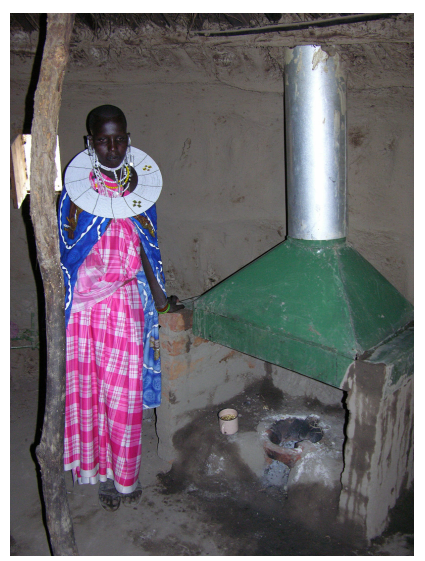
Figure 4: Maasai woman standing beside her smoke hood, Tanzania.

In Nepal, the traditional stove is a three-legged tripod with a circular metal ring on the top where the pots can sit. By building around the back of the stove, more heat is directed at the pot, increasing efficiency, whilst those sitting around the stove can still see the flames (Figure 3). The dry-stone walls of the houses have been insulated as part of the project, as shown around the smoke hood in Figure 3. This means that less heat goes out through the walls, compensating for the heat lost through the chimney in the vented smoke.