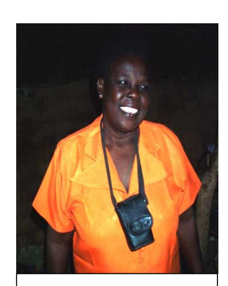
Figure 8: Woman wearing CO monitor around neck.

At the same time, the cook is asked to wear a CO monitor round her neck during monitoring: The monitor is attached and a check is made that she feels comfortable. Many people thought the participants were wearing mobile phones.