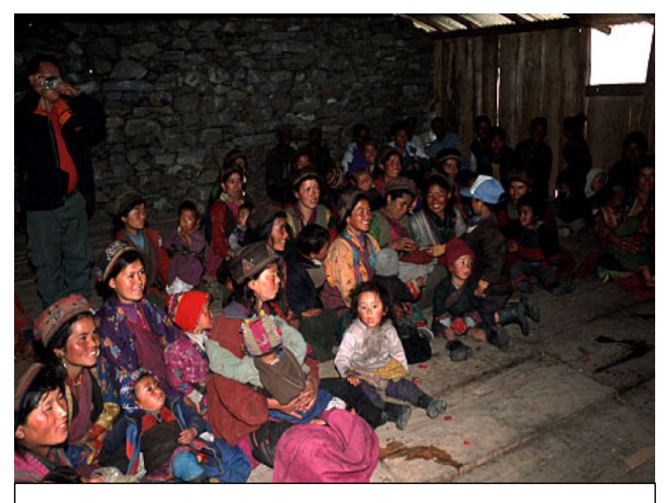
Figure 2: Nepal community meeting

Community participation (Figure 2) is essential from the start. Representative households should be identified by the community themselves, although various criteria can be required - eg children under five; enthusiastic to work with the project. Community meetings and discussion will promote participation and ensure that findings are relevant to the project communities.