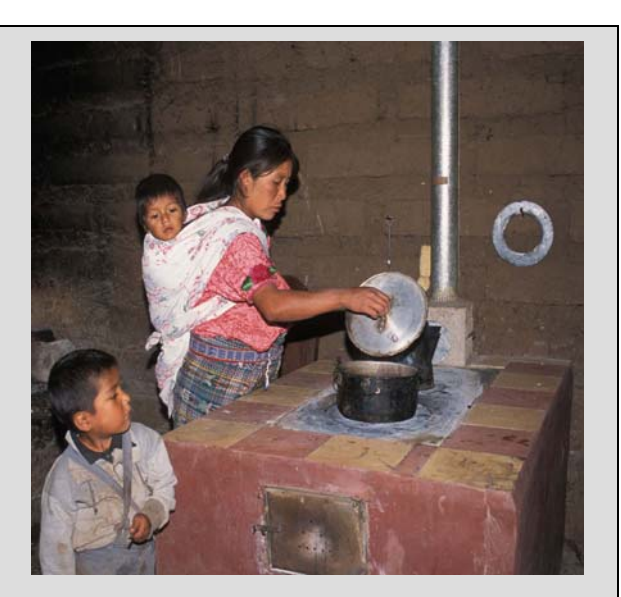
Figure 1: Woman using improved stove, Guatemala

At the end of the work, the remaining households in the study are provided with stoves.