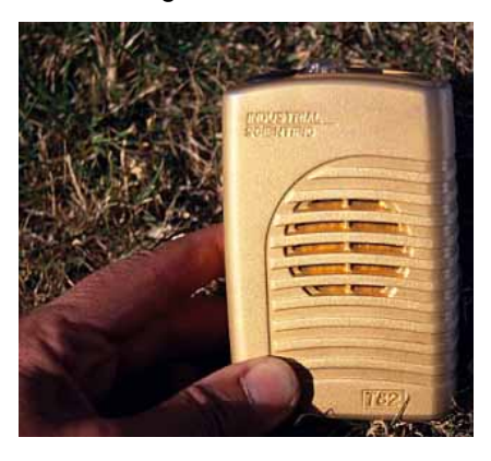
Figure 5: T82 Carbon monoxide monitor

There are two main types of equipment for monitoring carbon monoxide in this type of work. The first is a 'stain tube', which is a small tube, made of robust glass inside which is a sensor which changes colour with exposure to the gas. These tubes are useful if only a small number of measurements are to be made, but as they can only be used once, they are expensive for larger numbers of samples. They give an indicator of CO levels, but are difficult to interpret accurately and do not give real time data