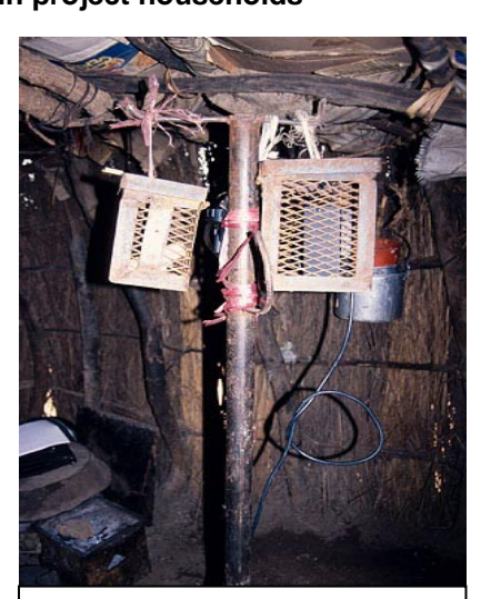
Figure 7: Equipment in metal cages – Sudan monitoring.

A particulate pump and a CO monitor are set close together 1.3m vertically and 1.3m horizontally away from the stove anad monitoring is conducted for 24 hours. Where possible, the equipment is set away from walls and draughts. In Figure 7, from Sudan, it can be seen that all the electrical equipment is housed in locked 'cages' to prevent children from tampering with it.