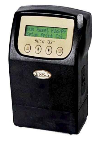
Figure 3: Buck lowflow sampling pump

http://www.apbuck.com/shop/item.asp?itemid=16