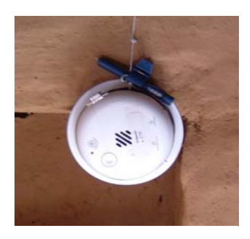
Figure 4: UCB monitor

The UCB monitor (Figure 4) relies on sensors from an inexpensive commercial household smoke detector that combines ionization chamber sensing (ion depletion by airborne particles) and photoelectric sensing (optical scattering by airborne particles) (UCB, 2006).