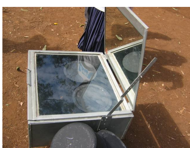
Figure 2: An ISC solar hot box in Kenya

The main disadvantages of hot boxes are their inability to reach higher temperatures and the length of cooking times. Only certain types of meal can be prepared and preparation must be done several hours before mealtime. On the other hand, there is little risk of burning food and so little attention is required, and many dishes, such as curries, sauces and soups, actually benefit from lengthy cooking.