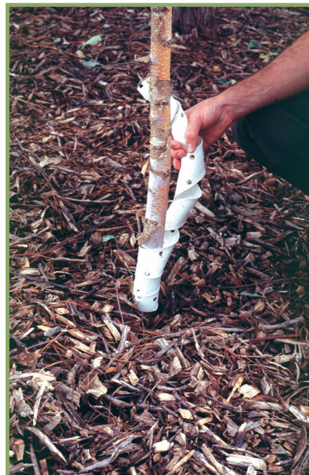
Figure 3. Plastic tree guards (polyurethane spiral wraps) can be reused for many years, allow good air movement between bark and guard, and will not girdle the trunk.

Tie the wrap firmly, but not tightly. Polyurethane wraps expand without binding the trunk. Start at the ground and wrap up to the first branch slightly overlapping as you go (Figure 4). Do not attach wraps with wire, nylon rope, plastic ties, or electrical tape.