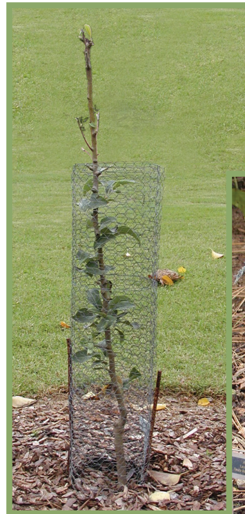
Figure 6. Chicken wire mesh can be used to protect trunks from animal damage.