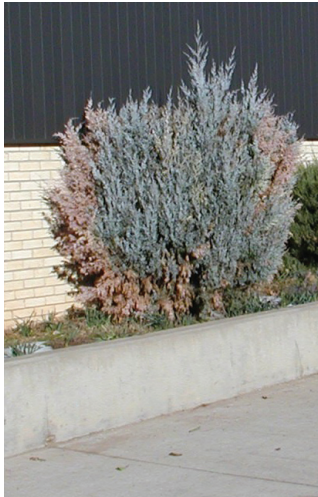
Figure 2. Reflected heat from a building may cause thawing and freezing on a winter day which may result in plant damage.

The second step is to keep plants healthy during the growing season. Plants in poor health or poorly adapted