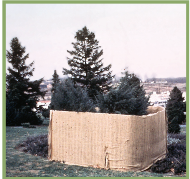
Figure 5. Temporary barriers may help protect evergreen plants from dry, cold winter winds.

The finer textured the mulch, the thinner the layer required. For example, one or two inches of sawdust will insulate as much as four or five inches of hay or straw. Leaves should not be used unless they have been shredded or composted. Avoid using diseased tree leaves, etc. for mulching. Use leaves or grass clippings with caution as they can pack and prevent air and water from entering the soil.