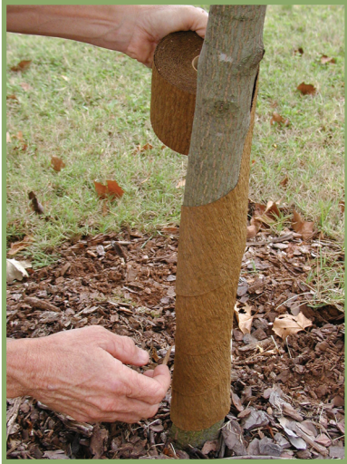
Figure 4. Apply paper wraps starting at the base of the tree, overlapping as you go, up to the first branch.

Plants prone to winter desiccation, such as broadleaf evergreens, when planted in open windy areas may require additional protection. Temporary protective barriers such as sheets of burlap, lathe fencing, bales of hay etc. can be constructed to provide protection from the drying winds (Figure 5).