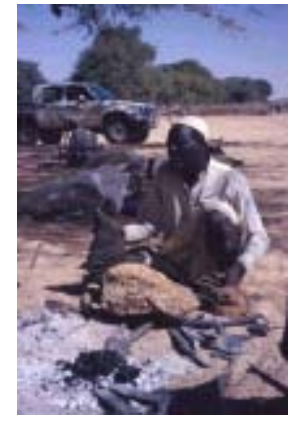
Figure 3: Metalworking in Darfur

The new design is based on the more traditional design but using an all-metal structure. The metal comes from scrap, which is usually obtained from old vehicles.