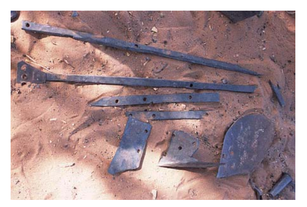
Figure 5: The plough before assembly

The conditions in which the ploughs are manufactured are fairly basic and the tools available to the blacksmiths are limited.