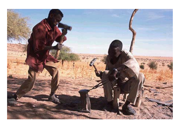
Figure 4: hammering one of the component parts of the plough

After initial trials in the project area (Kebkabiya), this technology was scaled up and disseminated to other areas in North Darfur including Azagarfa Village,