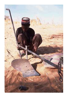
Figure 6: Assembly of the plough

The donkey plough demonstrates the relationship between the different aspects of Practical Action's work from the adaptation of a traditional technology to the development of an intermediate technology and brings together farming, metalworking and the production of improved harnesses.