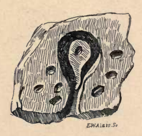
Inscribed Rocks in Kamaon, (Indian)