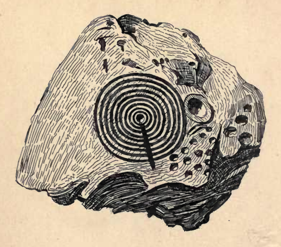
The Youghal Stone , (Irish)