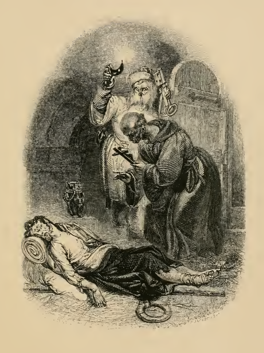
Their uncle having dyed in gaol. Where he for debt was layd---