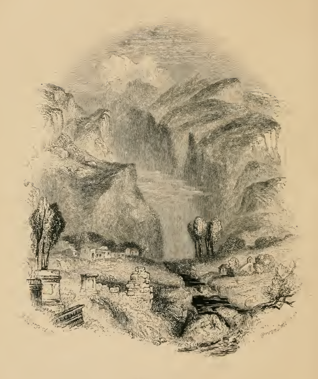
VILLAGE OF CASTR' ON THE SITE OF THE DELPHI.