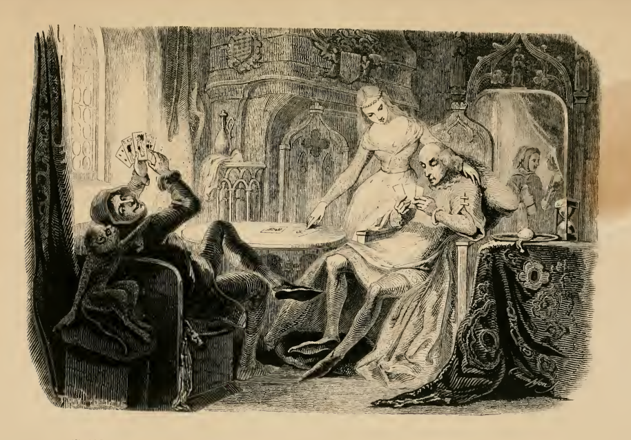
CHARLES VI OF FRANCE, ATTENDED BY "LA PETITE REINE," PLAYING AT CARDS WITH HIS JESTER.