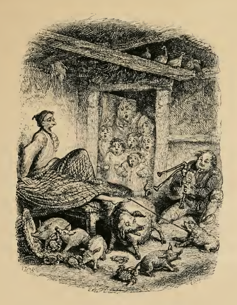
AN IRISH ROW.