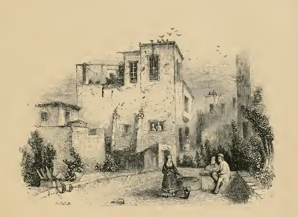
HOUSE OF CAPO D'ISTRIA.