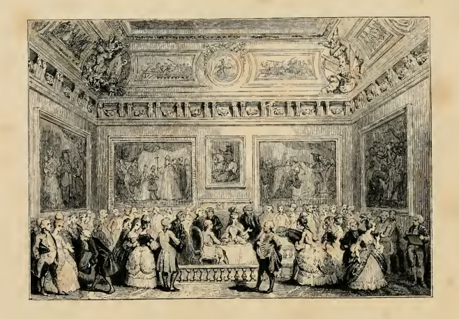
THE DINNER ROYAL AT VERSAILLES.