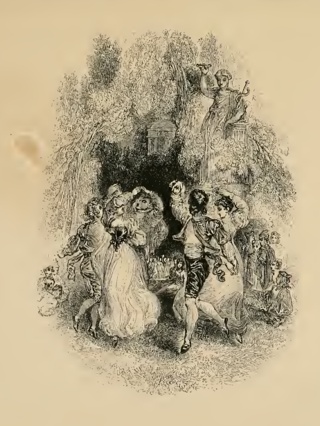
DANCE AL FRESCO.