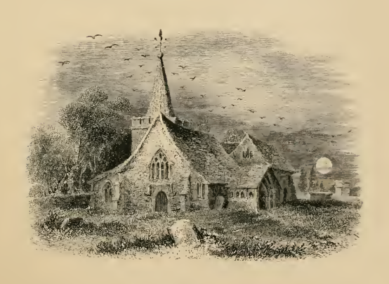
PRINTED BY & BENTLEY