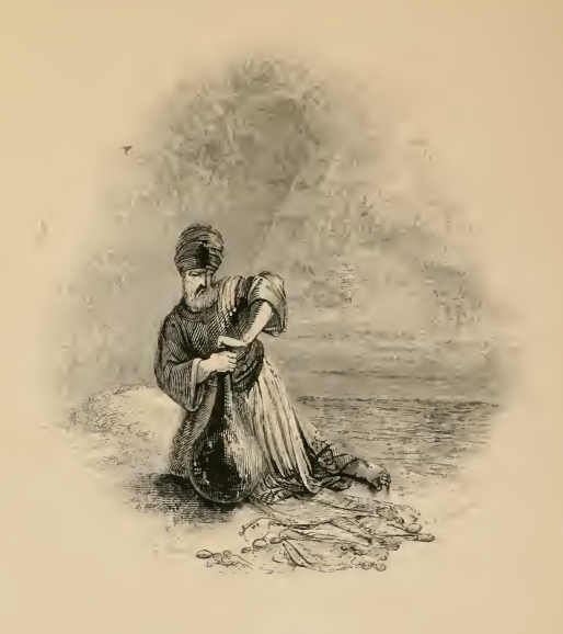
ENCLOSING THE EFREET IN THE BOTTLE