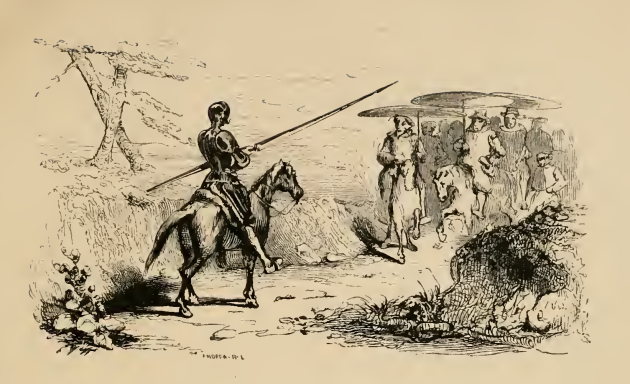
DON QUIXOTE AND THE MERCHANTS OF TOLEDO.