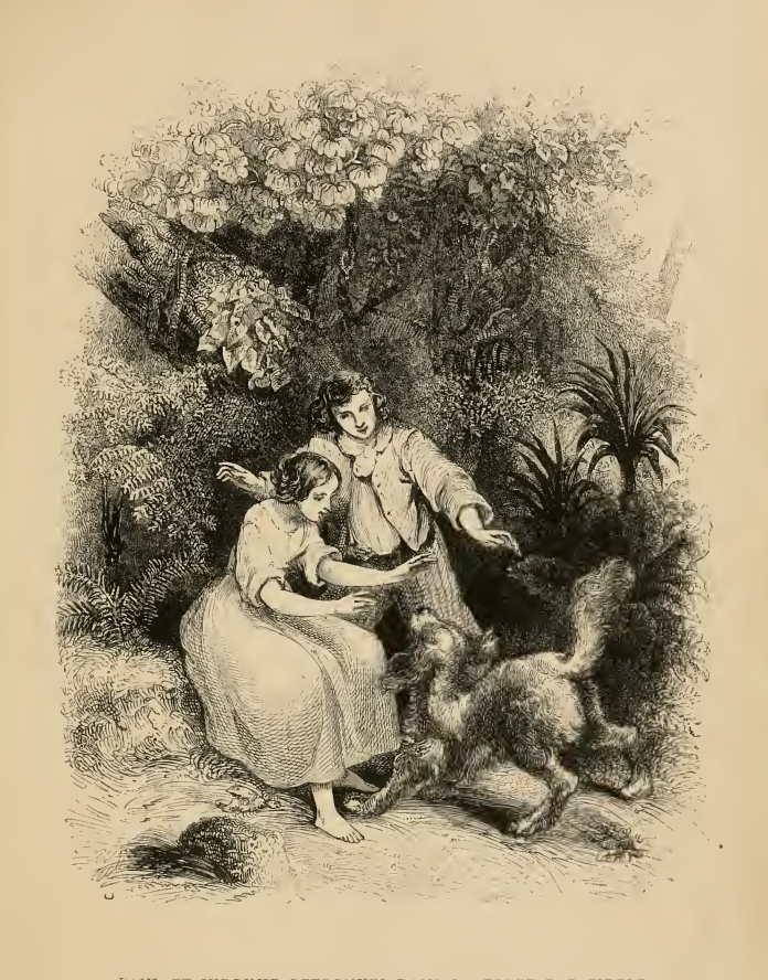
PAUL ET VIRGINIE RETROUVES DANS LA FORET PAR FIDELE.