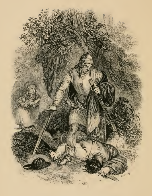
And he that was of mildest mood did slaye the other there, Within an unfrequented wood, while babes did quake for feare