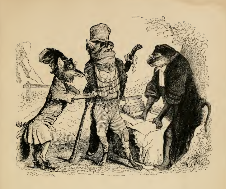
LE LOUP PLAIDANT CONTRE LE RENARD, PAR-DEVANT LE SINGE.