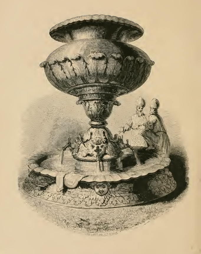
THE BRAZEN LAVER.