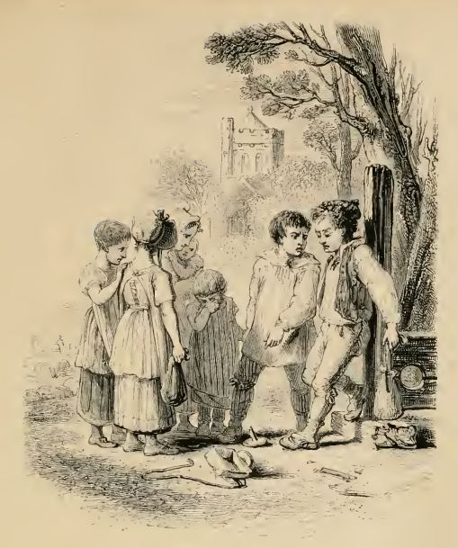
XV. Some village Hampden, that, with danntless breast, The little tyrant of his fields withstood; Some mute, inglorious Million,—here may rest; Some Cromwell, guiltless of his country's blood.—Gray's Elect.