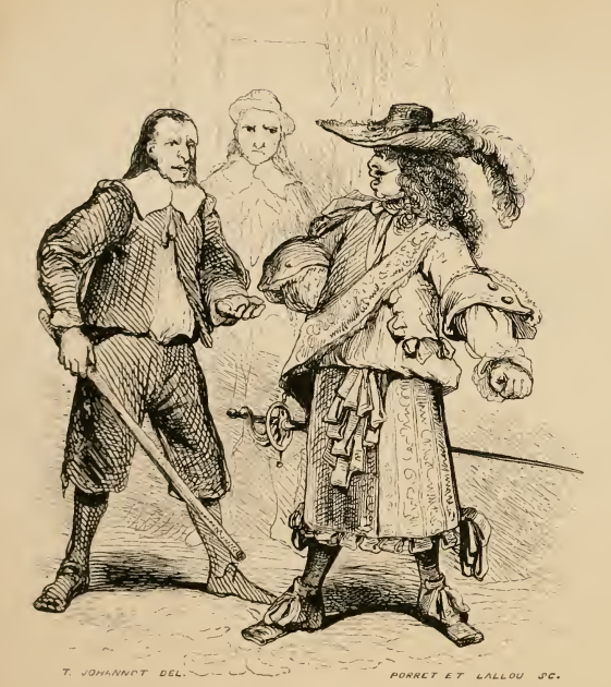
DEUXIEME PORTEUR. Je dis, Monsieur, que vous nous donniez de l'argent, s'il vous plait.

MASCARILLE lui donnant un sonfflet. Comment, coquin! demander de l'argent à une personne de ma qualité! Passules l'Onieura prenant un des batons de su chaise. Ca, payez nous