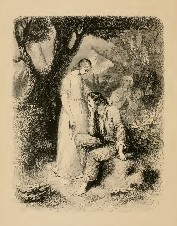
VIRGINIE CONSOLE PA' L.