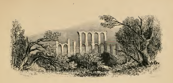
AQUEDUCT AT MYTELENE.