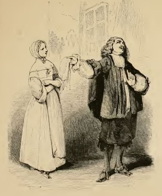
TARTUFFE. Couvrez ce sein que ne saurois voir, Par de parelis objets les ames sont blessées, Et cela fait venir de coupables pensées. Le Tartuffe.