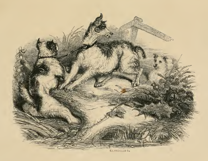
A FAMILY PICTURE.