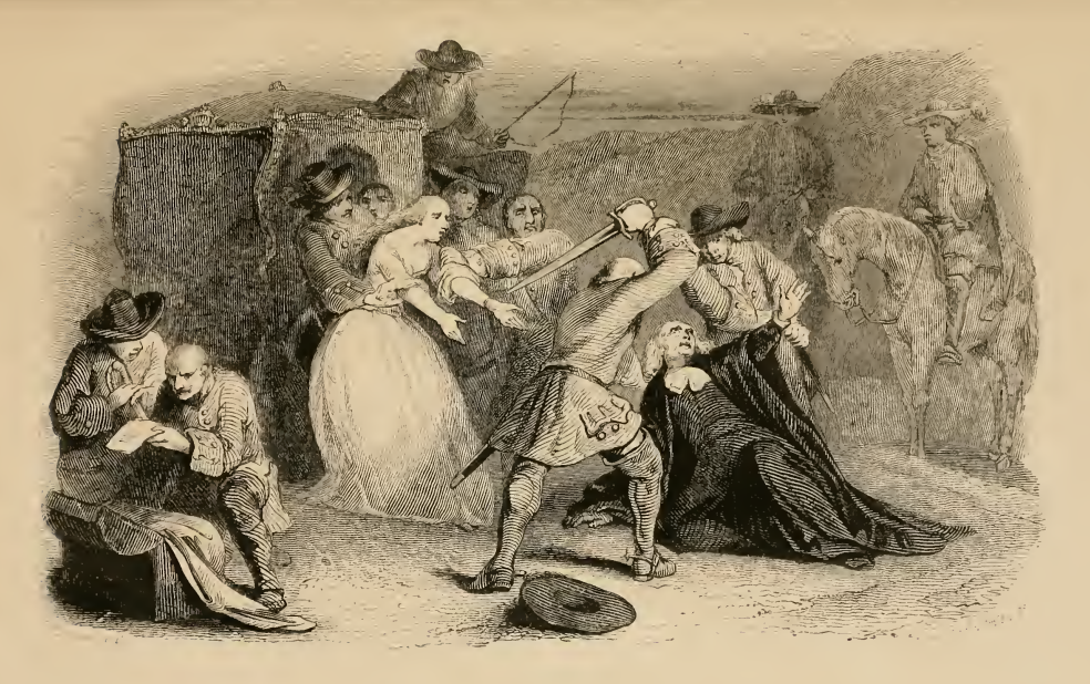
MEURTRE DE SHARP, PRIMAT D'ECOSSE.