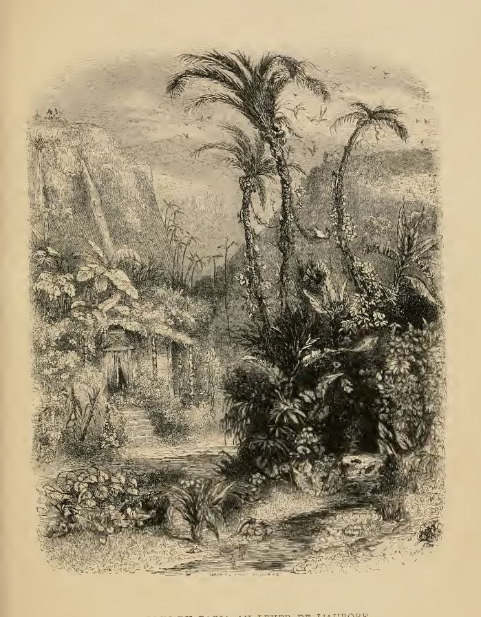
LE JARDIN DU PARIA AU LEVER DE L'AURORE.