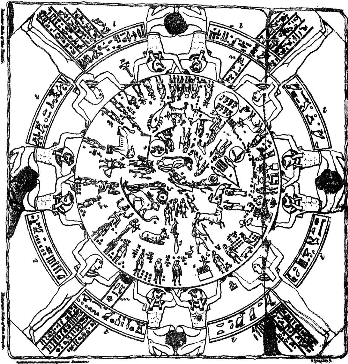
1. The Lion. 2. The Virgin. 3. The Balance. 4. The Scorpion. 5. The Sagittarius. 6. The Capricorn. 7. The Aquarius. 8. The Pisces. 9. The Ram. 10. The Bull. 11. The Twins. 12. The Cancer.

The jackal Occupies The Center Of. The Zodiac THE AXE WAS GOD By Henry Binkley Stein