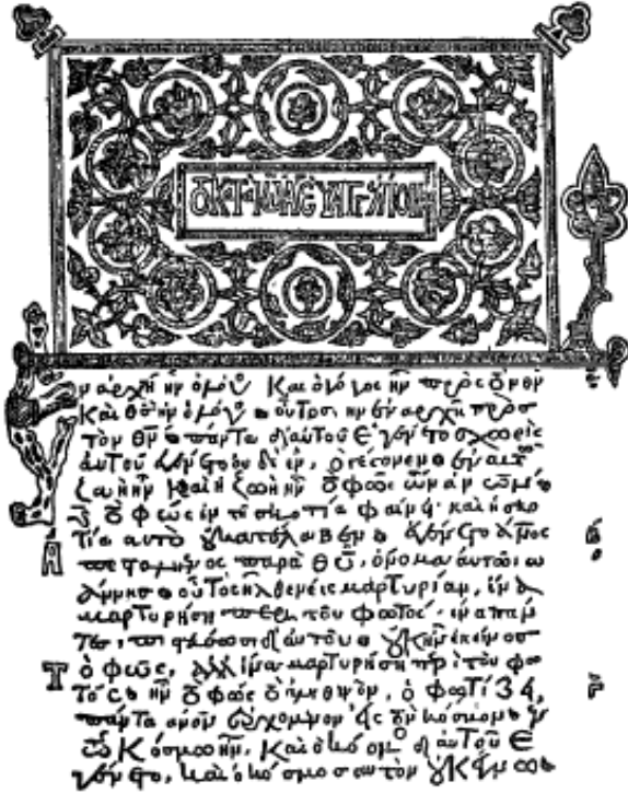
Codex Ebnerianus. John 1: 1-10.

The Vatican, No 1209 in the Vatican Library at Rome. It is very corrupt, has evidently been tampered with, and is remarkable for omissions, lacking the Apocalypse , Hebrews ix. 4 to the end, I. and II. Timothy , Titus