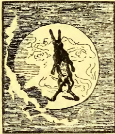
SÂKYAMUNI AS A HARE IN THE MOON.

formation of a learned and intelligent French gentleman recently arrived from Ceylon, who adds that the Cingalese would often request of him to permit them to look for the hare through his telescope, and exclaim in raptures that they saw it. It is remarkable that the Chinese represent the moon by a rabbit pounding rice in a mortar. Their mythological moon Jut-ho is figured by a beautiful young woman with a double sphere behind her head, and a rabbit at her feet. The period of this animal's gestation is thirty days; may it not therefore typify the moon's revolution round the earth." 79