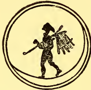
REPRESENTATION IN GYFFYN CHURCH, NEAR CONWAY.

would have said "the thief," for stealing appears to be more antique.