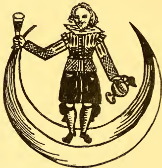
“THE MAN IN THE MOON DRINKS CLARET.”

the moon always drunke claret." 6 Several astronomers assert the absence of water in the moon ; if this be the case, what is the poor man to drink? Still, it is an unsatisfactory announcement to us all ; for we are afraid that it is the claret which makes him look so red in the face sometimes when he is full, and gets a little fogged. We have ourselves seen