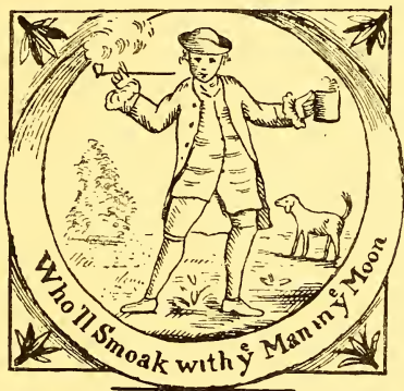
BANKS' COLLECTION OF SHOP BILLS.

Some old authors and artists have represented the