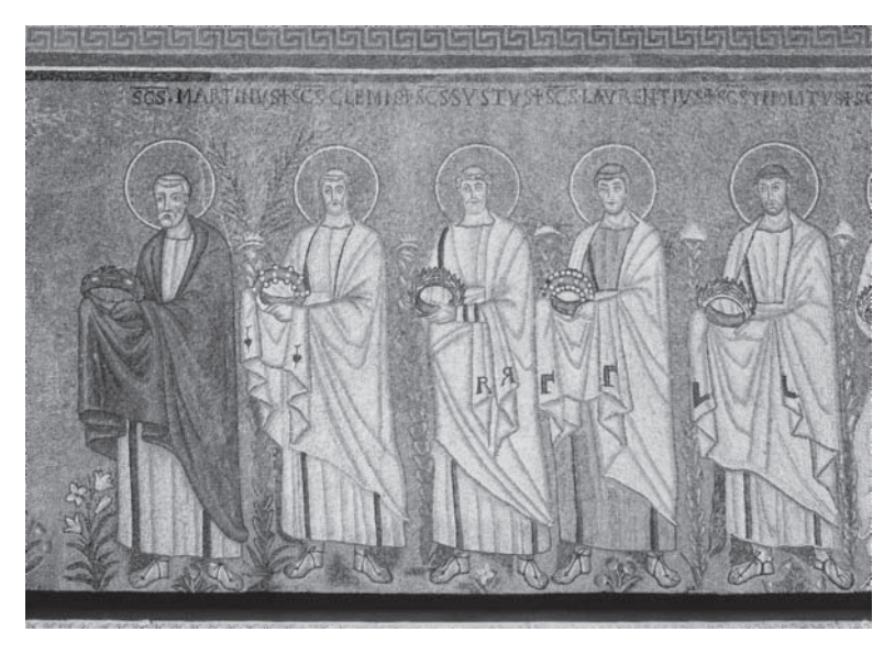
Plate 1 Procession of saints in the Church of Sant'Apollinare Nuovo in Ravenna, Italy.

moving in the same direction as the worshiper looking towards the altar.