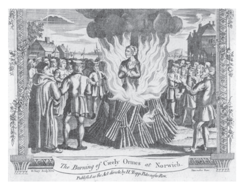
Plate 5 A woodcut from Foxe's Book of Martyrs (1563).

enhanced with vivid woodcuts, went through three more expanded editions within his lifetime. It has been said that, along with the King James Version of the Bible and the Book of Common Prayer, Foxe's work gave definitive shape to England as a Protestant nation. The Book of Martyrs , brought to the New World by dissidents who left England, became a staple of religious reading in North America well into the eighteenth century. To this day it is cited as an example of Christian witness among certain fundamentalists who have strong anti-Catholic sentiments as part of their worldview.