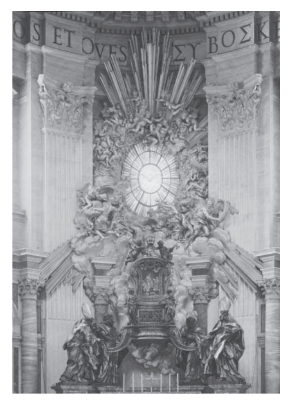
Plate 6 The Altar of the Chair in St Peter's Basilica, Rome.

now either of purely historical interest (for example, the moral theology of the eighteenth-century theologian and bishop, Alphonsus of Liguori) or not quite in the first rank of theology (Saints Antony of Padua, Lawrence of Brindisi) so people have discussed whether or not other appropriate names might merit inclusion. If outstanding doctrine (i.e. teaching; the term means more than dogmatic theology) includes spiritual teaching (as it manifestly does in the case of Saint Thérèse of Lisieux, Saint