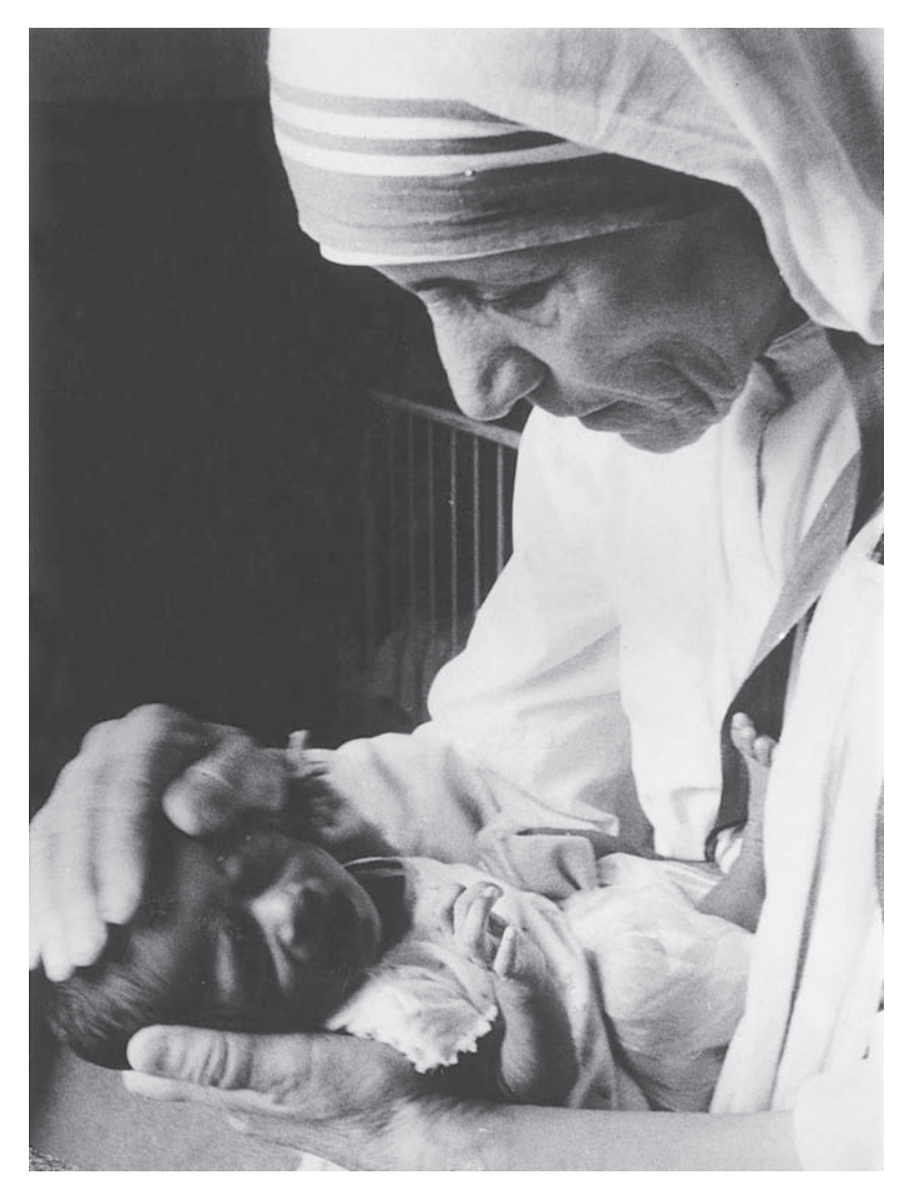
Plate 9 Mother Teresa of Calcutta (1910–1997).