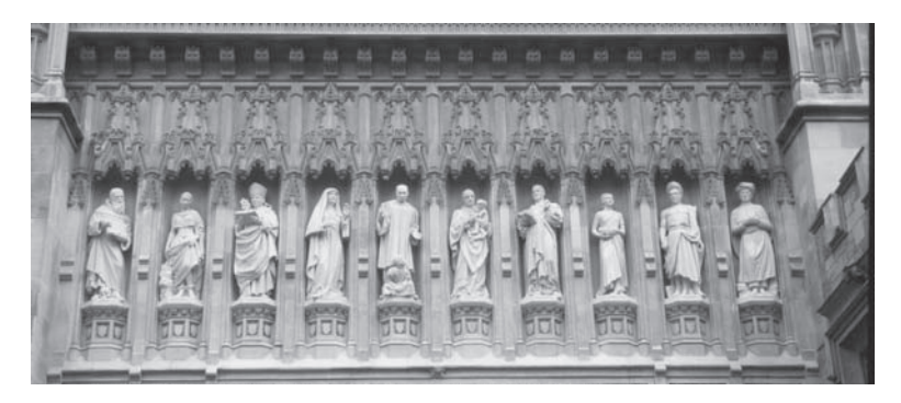
Plate 11 Westminster Abbey's homage to the contemporary martyrs.

passive martyrs (the Jesuanic martyrs about whom Sobrino has written) – the disenfranchised who simply "disappeared," dead who remain nameless.<sup>13</sup>