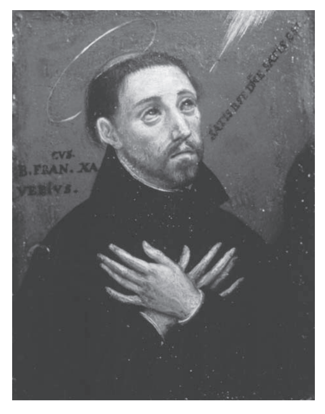
Plate 3 Saint Francis Xavier (1506–1551). Museo Casa de Murillo, La Paz.

great Spanish contemplative whose religious sisters would establish in France convents that had a tremendous impact on French spirituality in the seventeenth century.