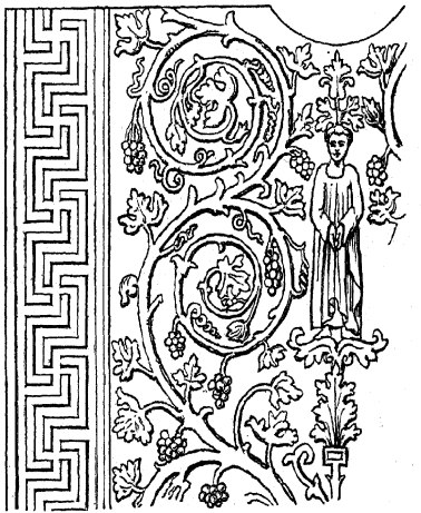
No. 3. Byzantine. Sixth Century: Tomb of Galla Placidia,