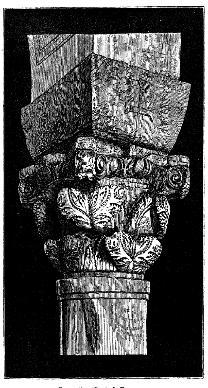
Byzantine Capital, Ravenna.