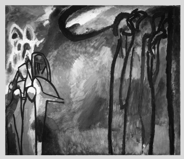
Figure 3 Wassily Kandinsky, Improvisation 19, 1911. (Inv. no. GMS 79. Städtische Galerie im Lenbachhaus, Munich. Reproduced by permission.)

Underpinning On the Spiritual in Art is Kandinsky's principle of "inner necessity." <sup>34</sup> In keeping with the dialectical nature of Kandinsky's concept of the creative spirit, "inner necessity" involves both the universal and individual. It is an eternal "invariable law of art" inherent to the creative work itself <sup>35</sup> and an active, incessantly changing, creative force of emotion in the artist. For Kandinsky, this was thus no less than the foundation for "the expression of the