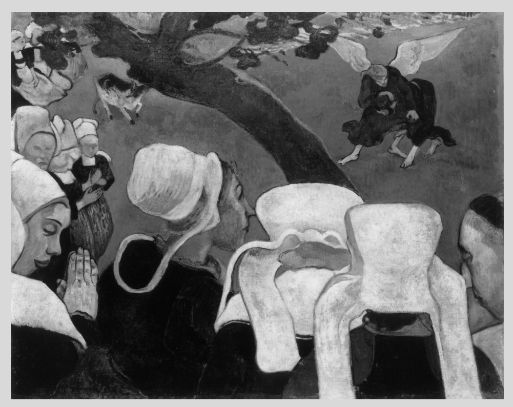
Figure 2 Paul Gauguin, The Vision After the Sermon, 1888. (National Galleries of Scotland, Edinburgh. Reproduced by permission.)

vision of the mystic Emanuel Swedenborg's "inner eye of man." Aurier calls for an art that eschews illusionism and instead uses all the means necessary (including simplification, exaggeration, and distortion) for the expression of the Idea. We can also find in Aurier's definition of "the strict duty of the ideist painter... to use in his work only the lines, forms, general and distinctive colors that enable him to describe precisely the ideic significance of the object," a close equivalent to the concept of "significant form" in the work of Fry and Bell more than 20 years later (Part I). The high estimation of the "primitives" of the quattrocento is also common to all three critics. Aurier's elevation of "decorative" painting and his final demand to give Gauguin "walls! walls!" is compatible with Gauguin's own working methods, for as Maurice Denis recalled: "[Gauguin] loved the matte effect of frescoes and that is why he prepared his canvases with thick coats of white gesso.... His art contains more of tapestries and stained glass than it does of oil painting." 25