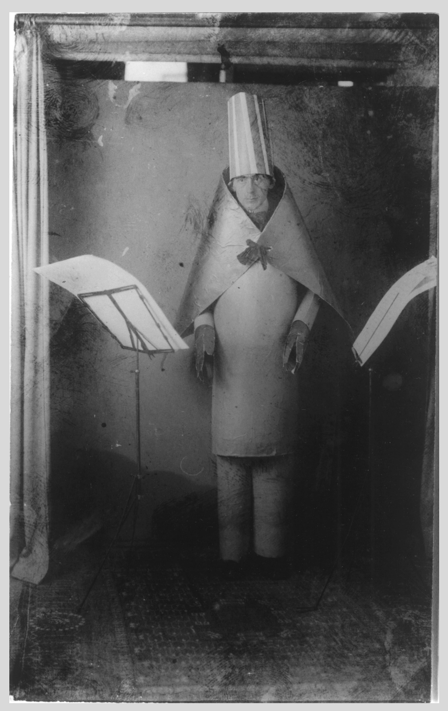
Figure 1 Hugo Ball in cubist costume, Zürich, 1916.