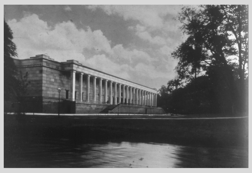
Figure 6 The "House of German Art," Munich, 1937.

Artists and intellectuals on the Left across Europe had been inspired by the revolution in Russia at the end of the war, Soviet culture to the mid-1920s, and their own hopes for the revolutionary potential of art. However, by the mid-1930s, evidence of the regimentation of Russian culture under Stalin, the campaign against formalism, and events such as the show trials of prominent