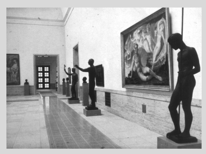
Figure 5 The interior of the "Great German Art Exhibition," Munich, 1937.