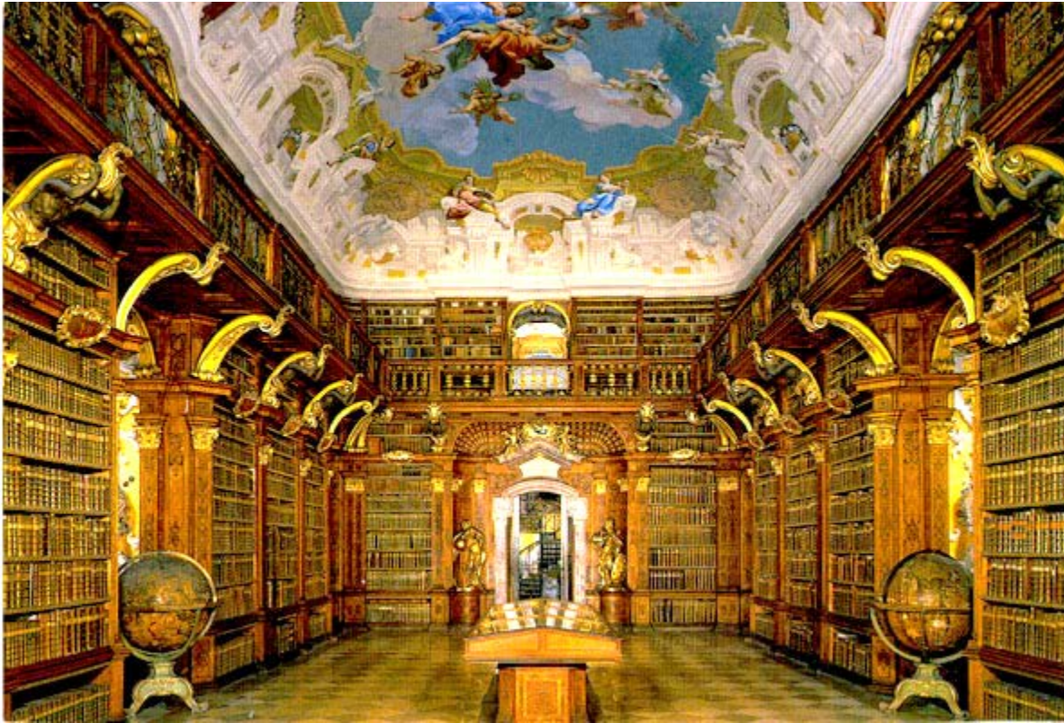
Melk Monastery Library, Melk, Austria