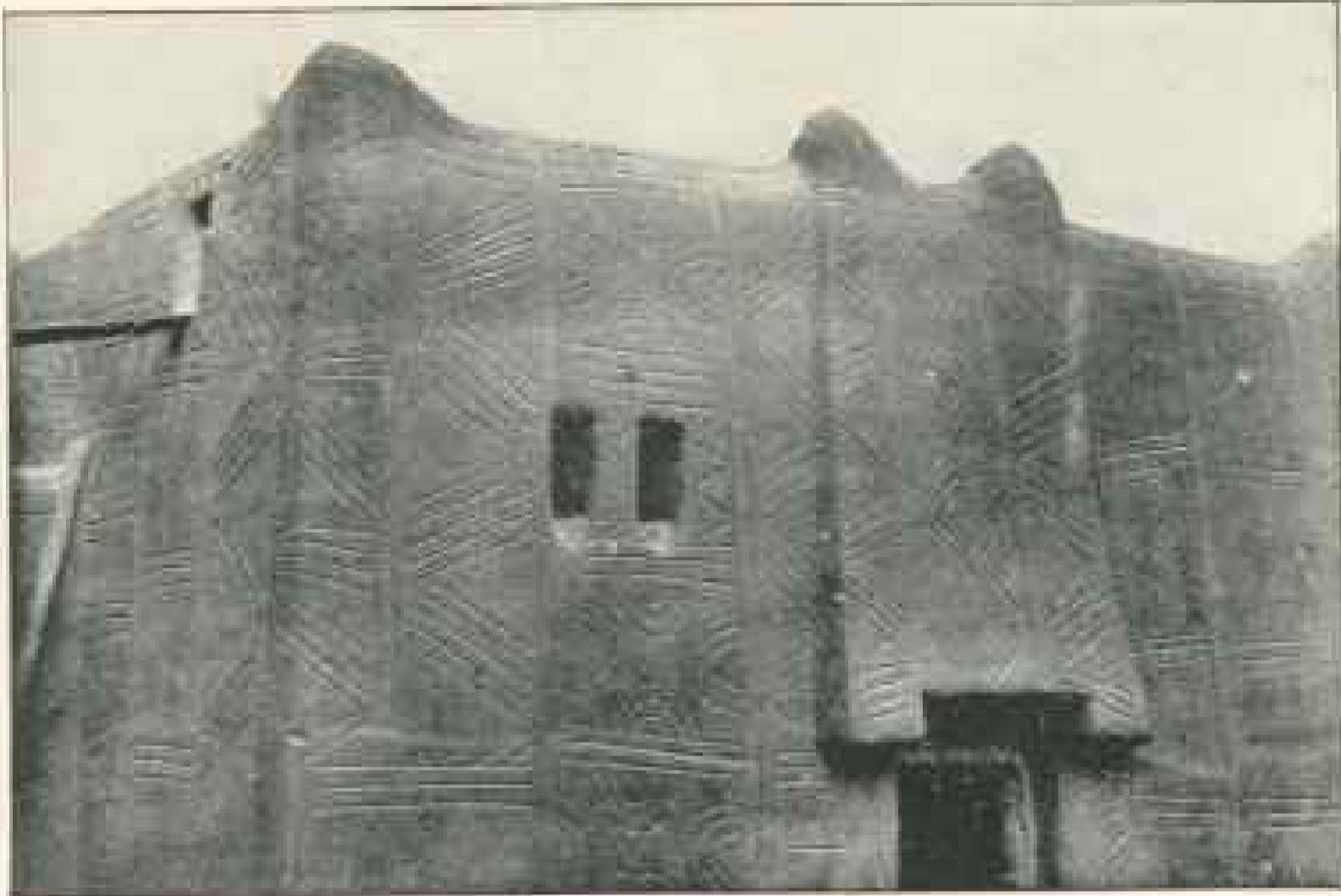
Exterior of the Emir of Kano's Harem