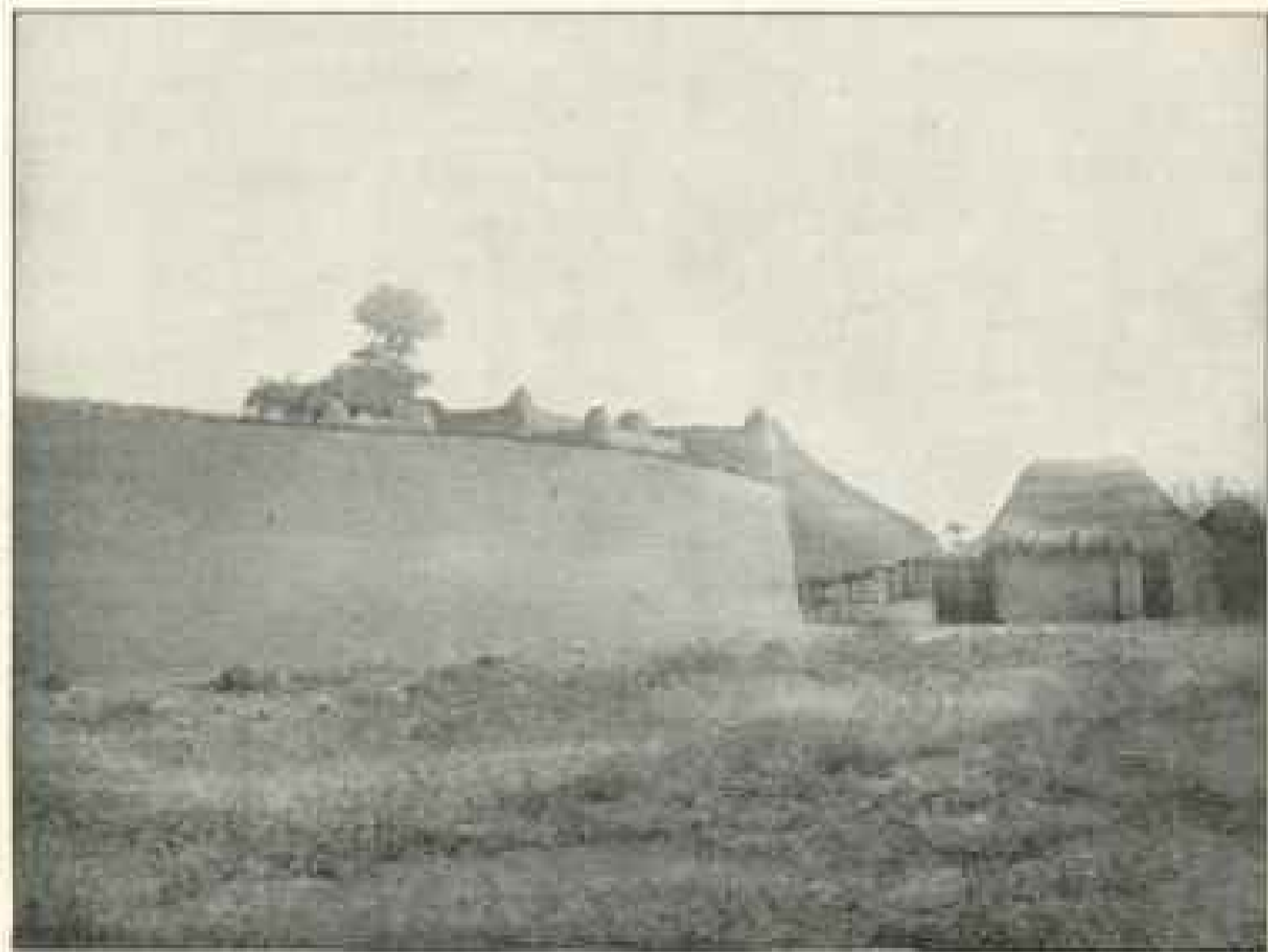
Wall of Emir of Zaria's Compound