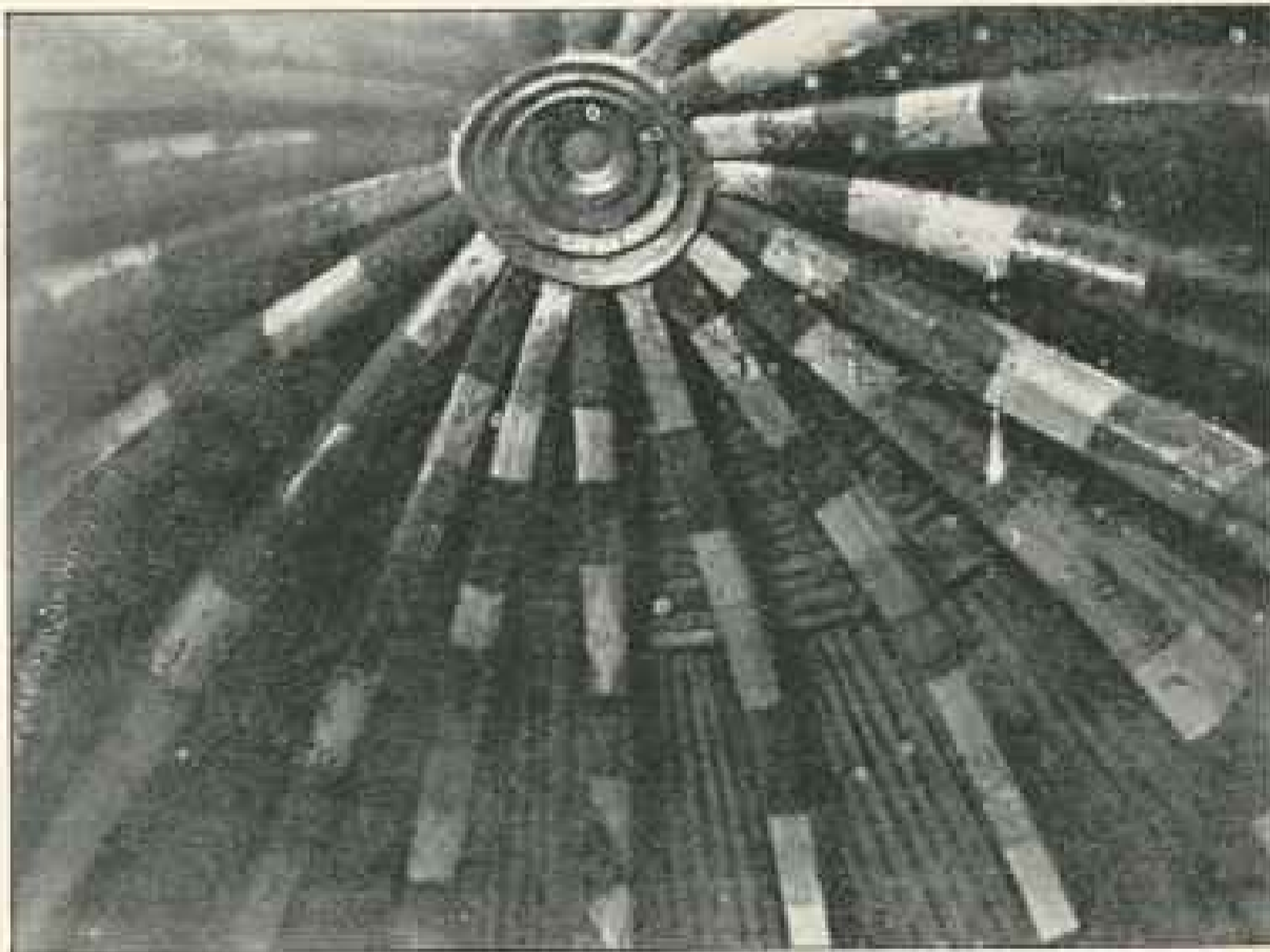
Ceiling of the Emir of Kano's Audience Chamber