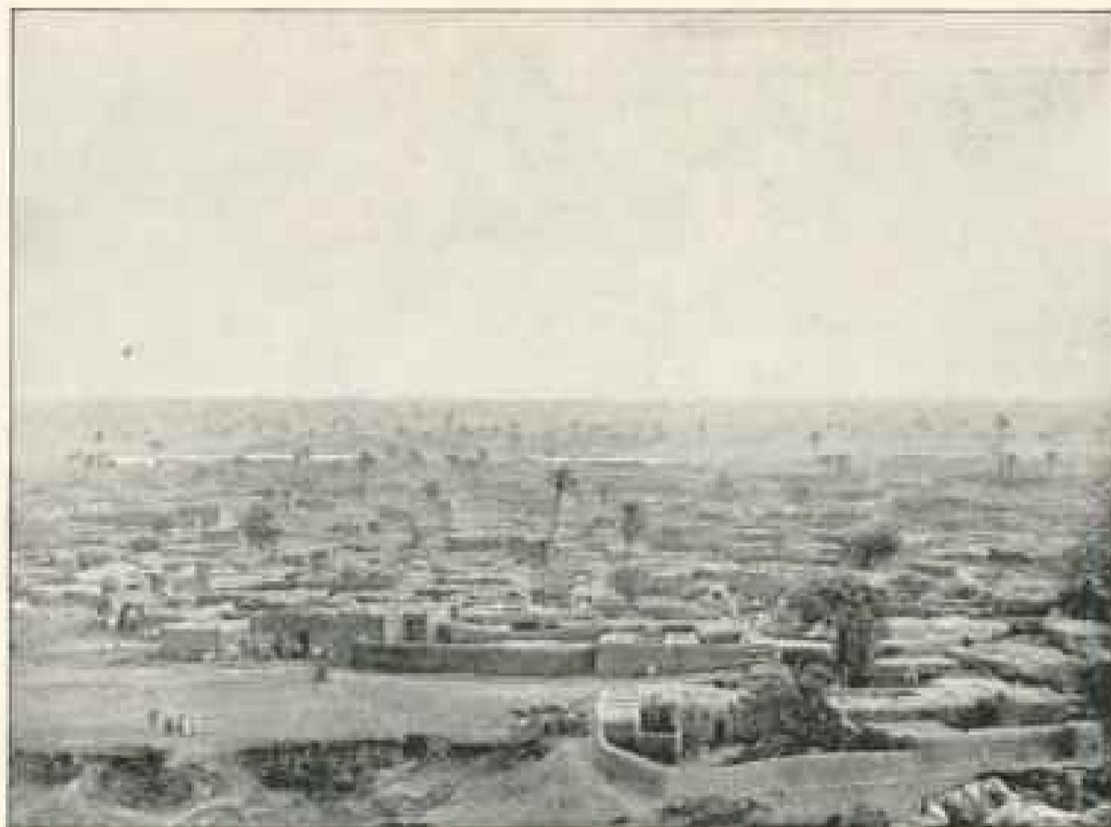
View of Kano from the Dallah Hill