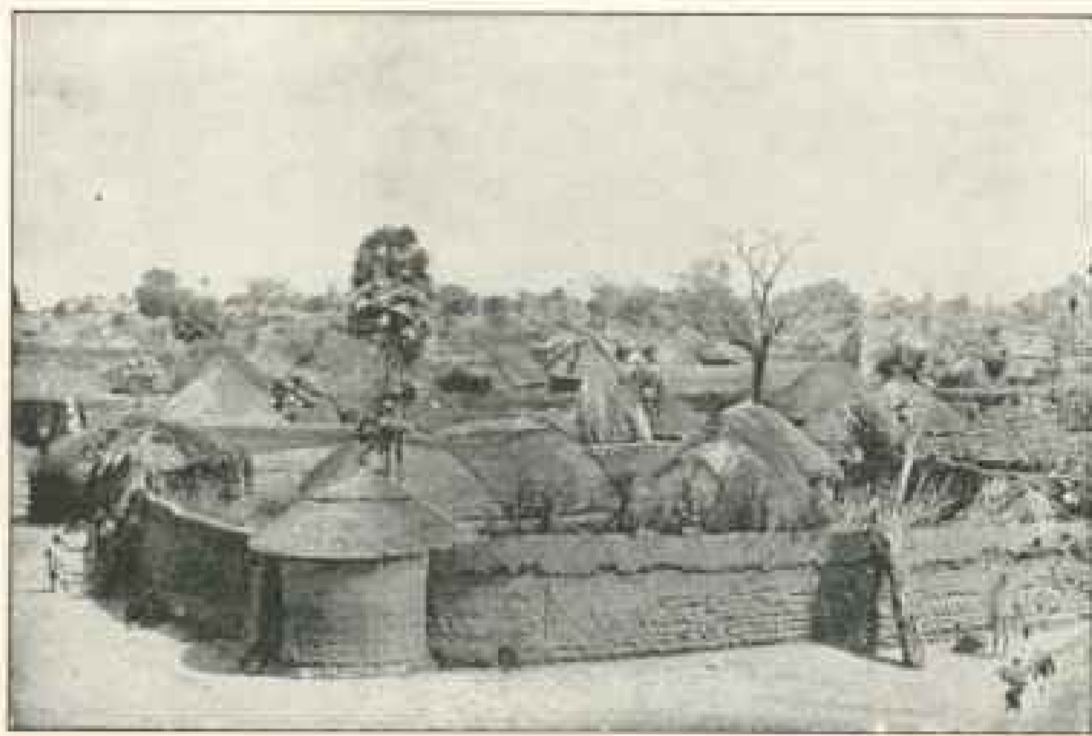
View Inside Zaria