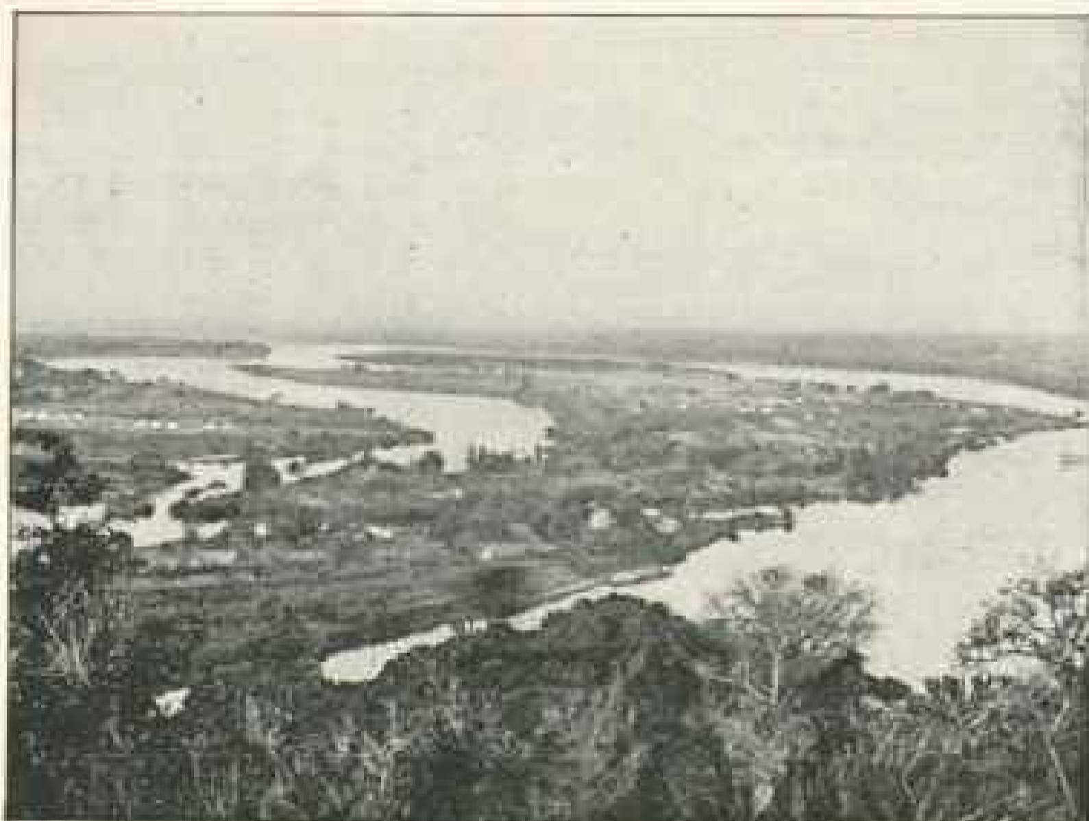
View of the Niger from Jebba

done wells. Year by year they had to be deepened to catch the failing supply of water, till it ceased. Three times in a few years had the chief of the Tawana to shift his capital because the apparently inexhaustible supply had wholly failed at each turn. In Nyassaland, as I have pointed out in former writings, the old surface level of the lake may be seen far inland today, and it is possible to trace various different levels on the surface of the water-worn rocks; and so it is in West Africa.