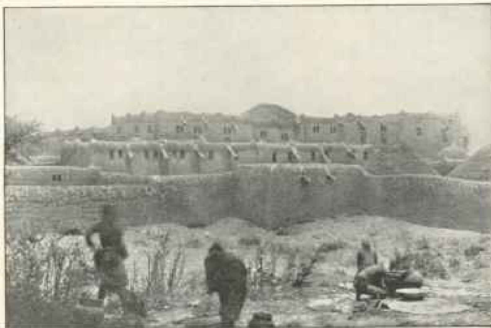
The Emir of Kano's Palace