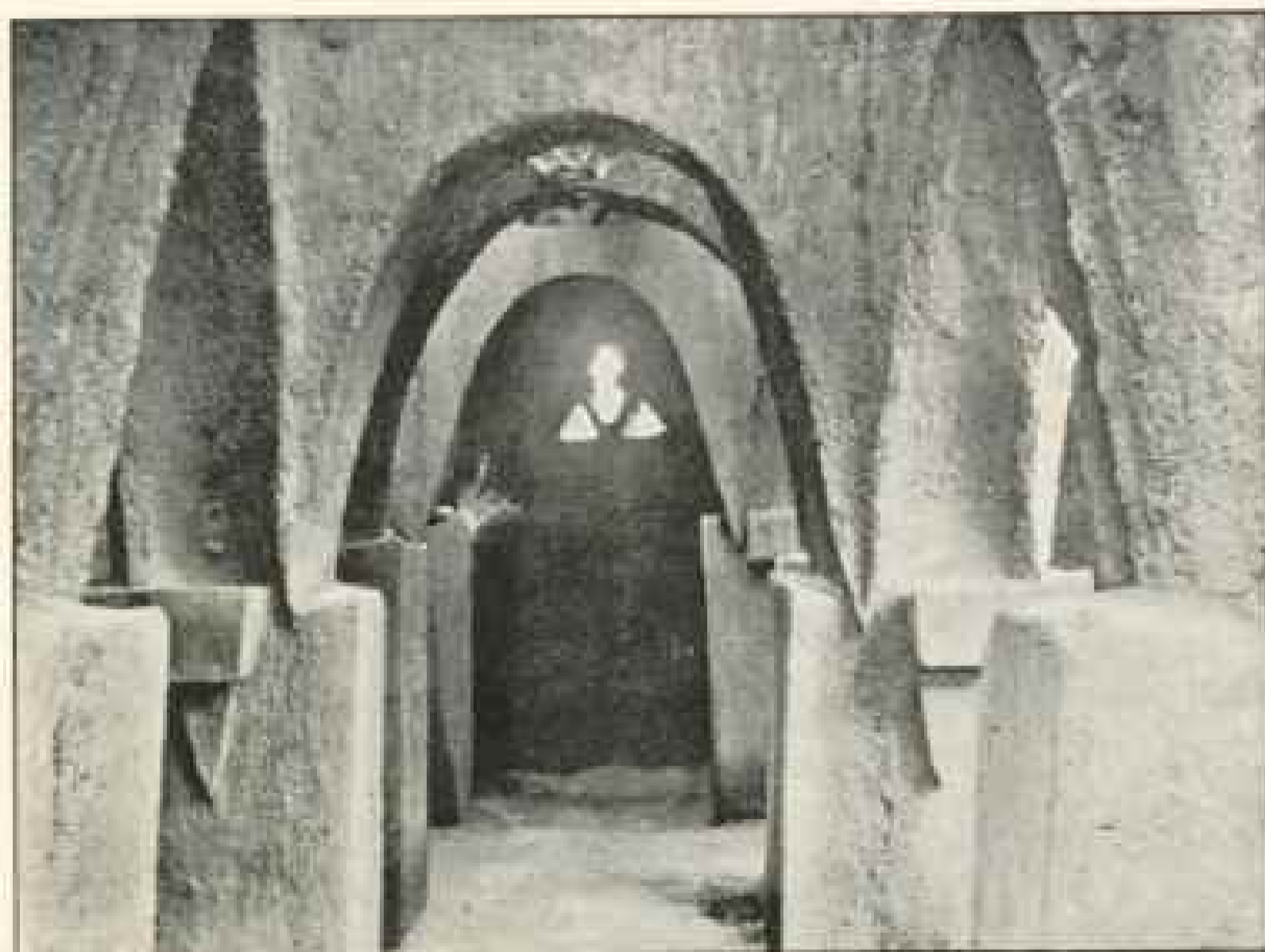
Interior of Native Emir's Palace