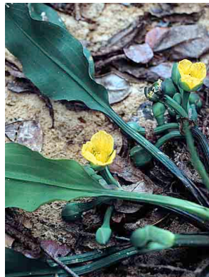
19 Limnocharis flava LIMNOCHARITACEAE