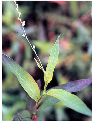
29 Polygonum punctatum POLYGONACEAE