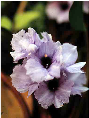
31 Eichhornia azurea PONTEDERIACEAE