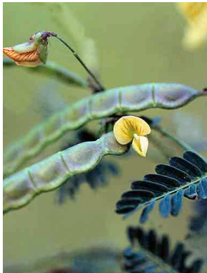
14 Aeschynomene FABACEAE