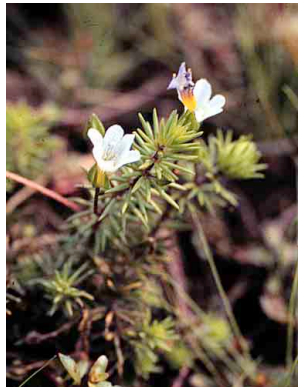
35 Bacopa myriophylloides SCROPHULARIACEAE