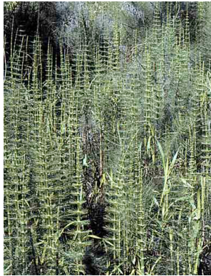
39 Equisetum giganteum PTERIDOPHYTA