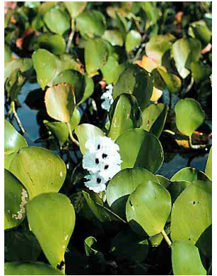
30 Eichhornia azurea PONTEDERIACEAE