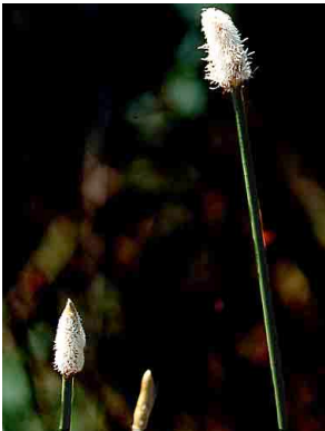
11 Eleocharis CYPERACEAE