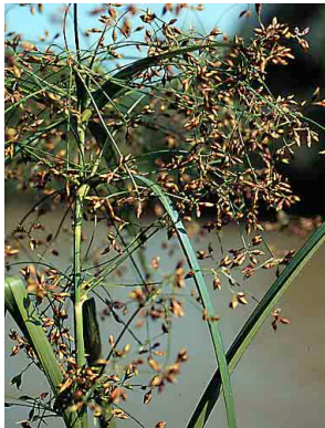
12 Rhynchospora corymbosa CYPERACEAE