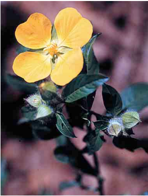
26 Ludwigia lagunae cf. ONAGRACEAE