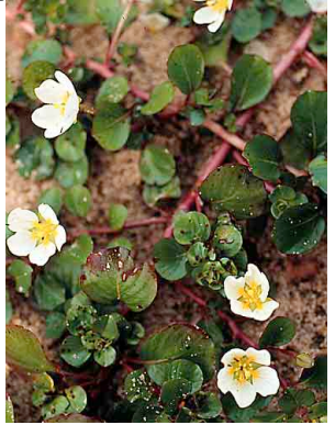
25 Ludwigia helminthorrhiza ONAGRACEAE