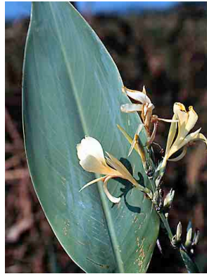
9 Canna glauca CANNACEAE