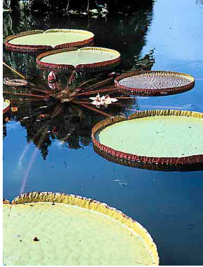
23 Victoria amazonica NYMPHAEACEAE