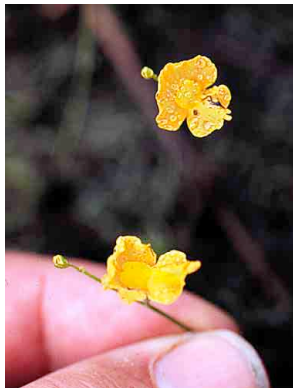
18 Utricularia gibba LENTIBULARIACEAE