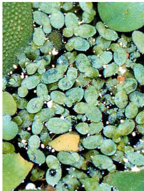
17 Lemna aequinoctialis LEMNACEAE