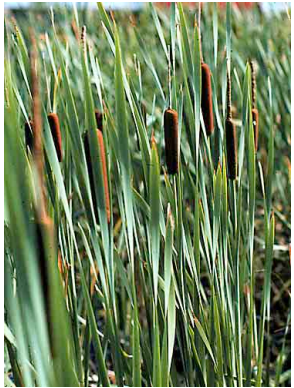
36 Typha domingensis TYPHACEAE