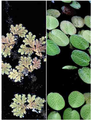
37 Azolla Salvinia PTERIDOPHYTA