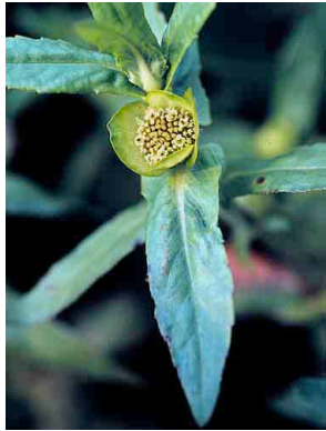
7 Enydra anagallis ASTERACEAE