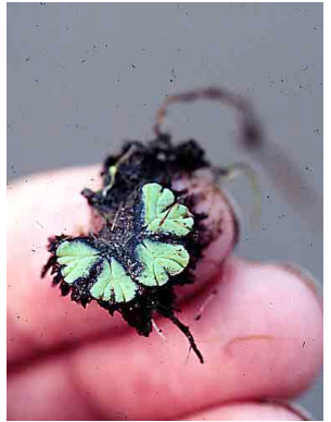
40 Ricciocarpus natans BRYOPHYTA