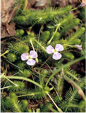
21 Mayaca fluviatilis MAYACACEAE