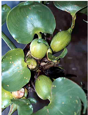
32 Eichhornia crassipes PONTEDERIACEAE