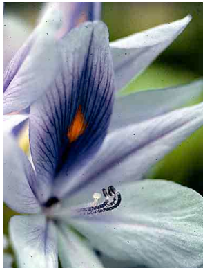
33 Eichhornia crassipes PONTEDERIACEAE