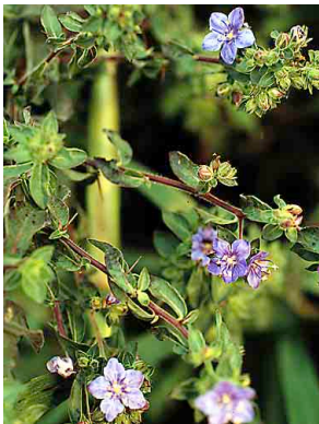
16 Hydrolea spinosa HYDROPHYLLACEAE