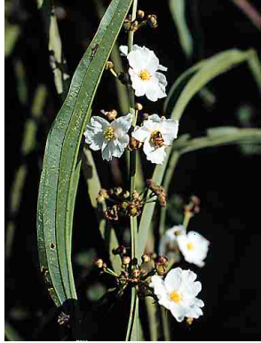
2 Echinodorus paniculatus ALISMATACEAE