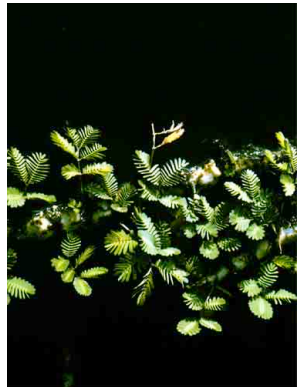
15 Neptunia natans FABACEAE