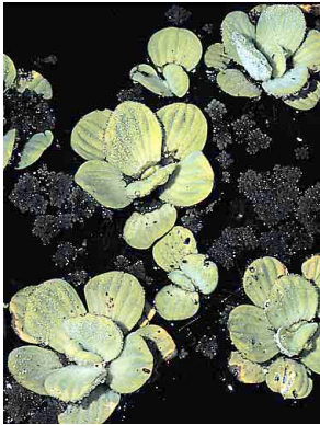
6 Pistia stratiotes ARACEAE