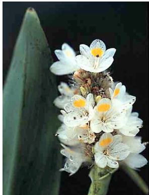
34 Pontederia parviflora PONTEDERIACEAE