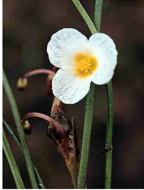
3 Sagittaria rhombifolia ALISMATACEAE