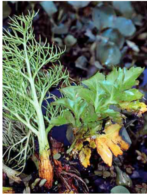
38 Ceratopteris pteridoides PTERIDOPHYTA