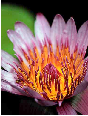
22 Nymphaea NYMPHAEACEAE