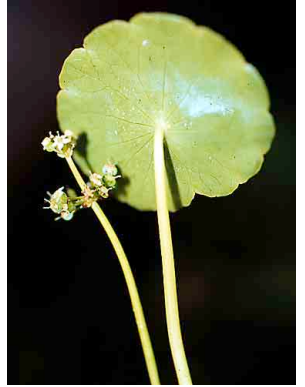
5 Hydrocotyle ranunculoides APIACEAE