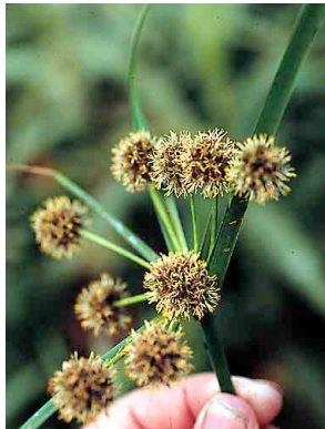
13 Scirpus cubensis CYPERACEAE