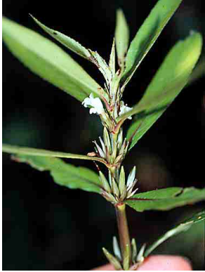
1 Hygrophila guianensis ACANTHACEAE

©V.J. Pott-EMBRAPA; y Environmental & Conservation Programs, The Field Museum, Chicago, IL 60605 USA. [RRC@fmnh.org] Rapid Color Guide # 9 version 1.6