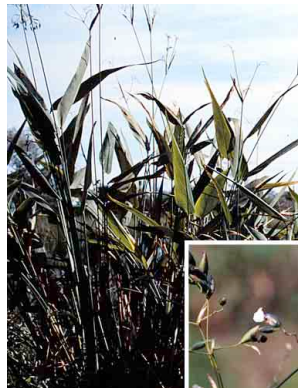
20 Thalia geniculata MARANTACEAE