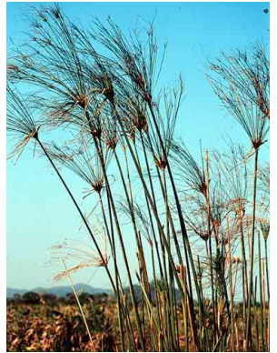
10 Cyperus giganteus CYPERACEAE