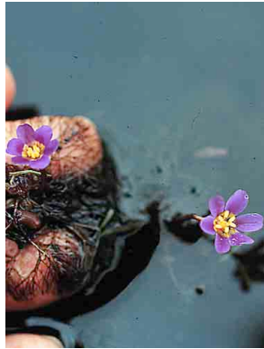
8 Cabomba furcata CABOMBACEAE