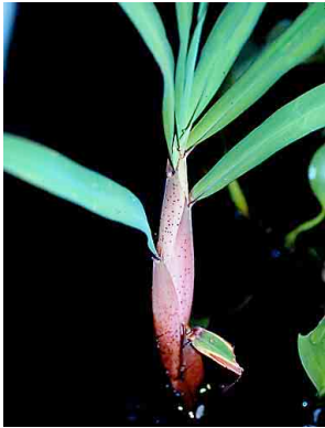
27 Paspalum repens POACEAE