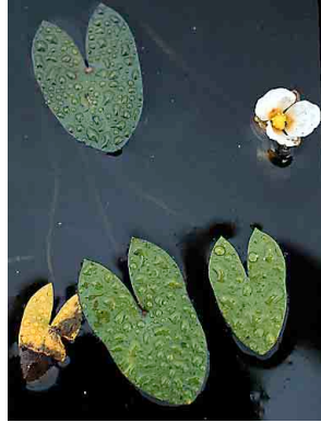
4 Sagittaria guianensis ALISMATACEAE