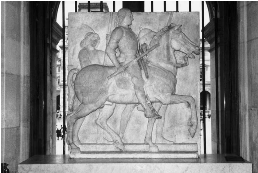
Tomb sculpture (anon.), Roberto Malatesta, papal commander (d.1482) (Musée du Louvre).

The Mantuan cardinal, who had arrived in Ferrara on 5 January to a rapturous welcome from Duke Ercole d'Este, wrote about the prospects and progress of the war not only to his brother but also to the Pope and to Girolamo Riario, and to the master of his household