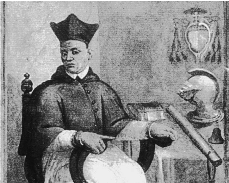
'Portrait' of Cardinal Giovanni Vitelleschi, with helmet and baton (anon., seventeenth century) (Tarquinia, Palazzo Comunale).

since antiquity. 60 In the Palazzo Comunale of Tarquinia, formerly Corneto, the small city north-west of Rome that the Vitelleschi family dominated, there is a mural painting dated 1629 that includes the artist's version of the projected statue of the cardinal on horseback. He is shown fully robed and hatted, bearing his baton of command; the setting is supposed to represent a meeting of the Roman civic council that commissioned the sculpture. In the same palace there is also a seated 'portrait' of Cardinal Vitelleschi, of about the same date, which includes his baton of command and helmet. It has been suggested that this might be based on a copy of the destroyed portrait head that, according to Vasari, Piero della Francesca painted in Nicholas V's apartments in the Vatican. 61 If that seems rather implausible, at least both works suggest that in the seventeenth century citizens of Corneto still took pride in Vitelleschi's violent reputation, or were meant to do so; but it is unlikely that these later portraits bore any to resemblance to him. Perhaps the nearest we can get to Vitelleschi's appearance and far from straightforward