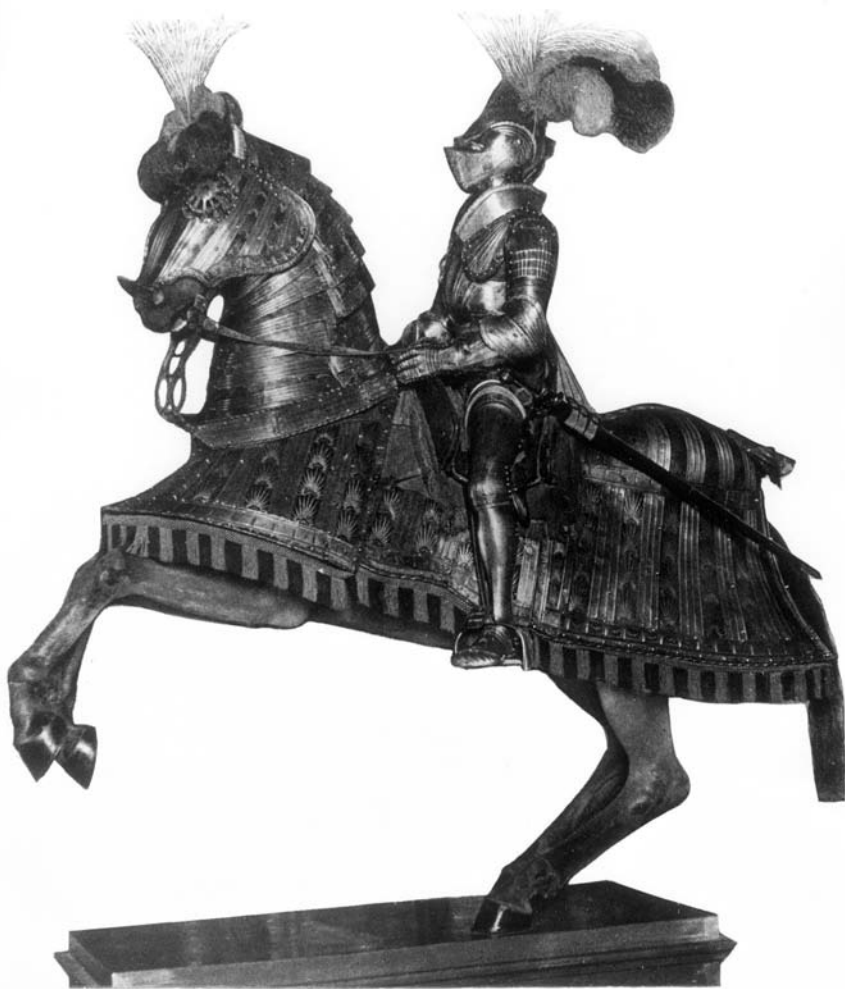
Armour supposedly made for Cardinal Ascanio Sforza (Armeria Reale, Turin).

The character of members of the Sacred College, in both ideal and reality, was nevertheless a topic that excited contemporary interest. It was, for example, expressed in the form of letters by Pius II's protégé Cardinal Jacopo Ammannati, particularly by a short tract in the form of a letter addressed to Cardinal Francesco Gonzaga in the summer of 1468, advising him about the lofty moral role of a cardinal. 130 In another letter to Francesco, in October 1474, Ammannati struck a slightly