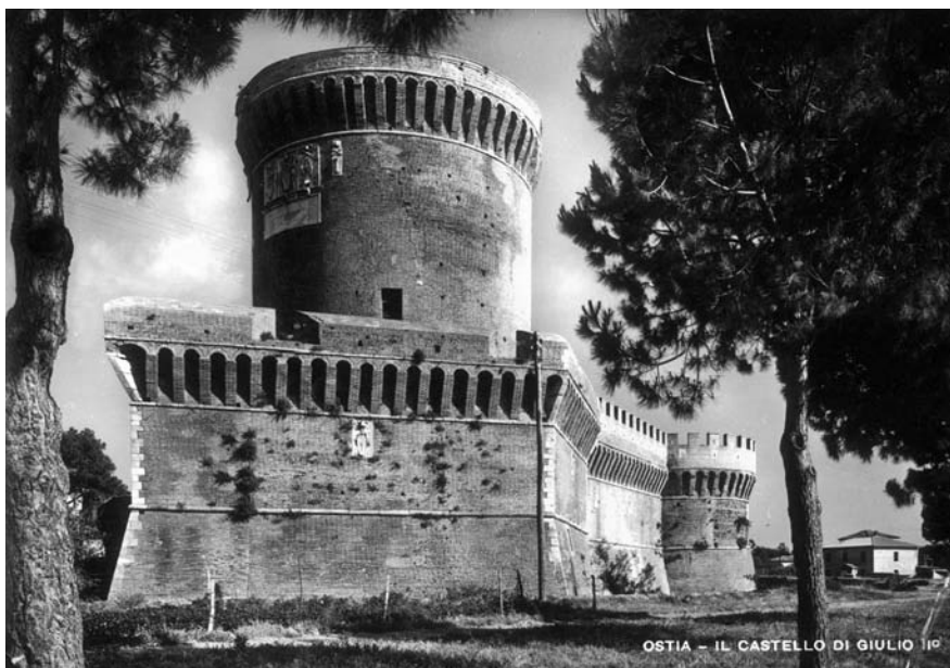
Fortress of Ostia, built for Cardinal Giuliano della Rovere.

in Rome? Even without the specially dangerous circumstances of 1484, at the close of Sixtus's reign and beginning of Innocent's, it had become habitual, and long remained so, for most cardinals to keep – as did the Pope himself – a well-stocked armoury. This was not just for use in the event of being sent on a military legation or even a crusade, but also as defence against insurrection and looting at the time of a papal election, or just security against each other, or against baronial private armies. Meanwhile, war games had also become an accepted norm, which perhaps is hardly surprising in view of the numbers of underemployed knights and squires or other armed retainers in papal and cardinals' households. Jousts and mock battles were frequently held in papal Rome. Among many such events were the three-day-long tournament held in honour of the marriage of Girolamo Riario and Caterina Sforza in April 1476, the joust commemorating the conquest of Granada held in February 1492 at the expense of Cardinal Alessandro Farnese, and the one in August the same year to celebrate the election of Alexander VI. 112 More sinister than these elaborate games, the Borgia Pope adopted the practice of having a military escort when he moved around Rome. For example, at his first public appearance after the coronation, to attend