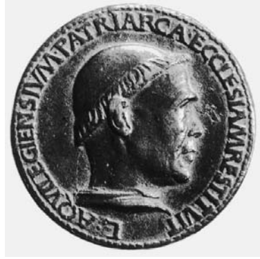
Cristoforo di Geremia, medal of Cardinal Ludovico Trevisan, commemorating the Battle of Anghiari, 1440, obv. and rev. (British Museum, Department of Coins and Medals).

contemporary poem, which will be discussed later, praised his valour and leadership. 68