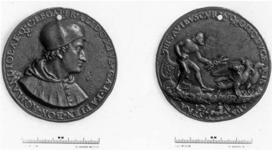
Medal of Cardinal Francesco Alidosi, probably commemorating Romagna campaign, 1509, obv. and rev. (Warburg Institute).

A certain share in the running of this campaign was held by Cardinal Francesco Alidosi, Julius's protégé and former secretary, now in his mid-fifties (b. 1455, made a cardinal in 1505), who had been legate of Bologna and the Romagna since July 1508. The partnership was stressful, and their army was a curious mixture of Spanish infantry, 867 of them, described at the time as 'beastly, badly equipped and robbers', and over twice as many Swiss. 14 Alidosi, however, lost no time in strengthening the fortress of Galliera, at the south-eastern entrance to Bologna, against possible Venetian attack. The Pope's instructions to him were explicit: to recover places in Romagna, especially Faenza, still occupied by the Venetians, 'those sons of iniquity'; to devastate the territory of Faenza if there was no submission; and to bring war machines to the walls of the city and destroy it 'by fire and iron'. Francesco Maria della Rovere took Solarolo, and Brisighella, north of Faenza in the Val Lamone, was besieged, and after its surrender on 29 April was subjected to a horrendous massacre by the Spanish troops. 15 Faenza presented greater problems, not least because the cardinal legate had allegedly failed to supply the Captain General with sufficient munitions; but Alidosi apparently gained the surrender of Faenza by the stratagem of subverting or corrupting some of its defenders. The Venetian governors of Faenza