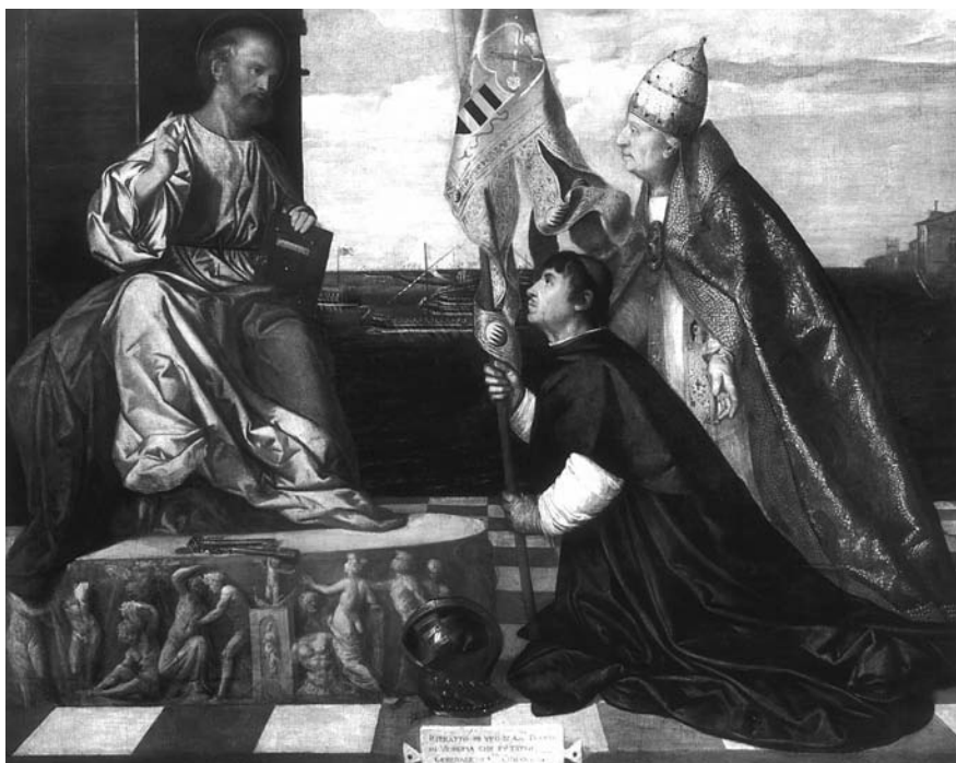
Titian, Pope Alexander VI presenting a papal banner and Jacopo Pesaro to St Peter (Koninklijk Museum voor Schöne Kunsten, Antwerp).

It also continued to be expressed, on a growing scale, by military building. By the end of the fifteenth century the papal state, that large wedge bisecting the Italian peninsula, had become one of the most formidably defended zones of Europe. It has even been claimed that it