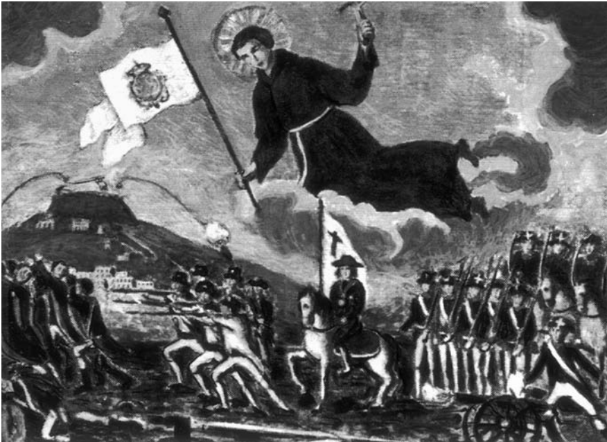
Cardinal Ruffo, protected by St Anthony, leading the Sanfedisti, 1799 (popular print).

Ruffo's campaign aroused and still arouses controversy. Direct participation in bloodshed and cruelty was attributed to him by his enemies, much of it unjustified, though even his apologists can only manage to excuse the sack of Altamura on the grounds that the republican garrison there had previously massacred royalist prisoners; he did his best to restrain the looting and to restore discipline. 51 If not quite in the mode of the notorious military cardinals of the fifteenth century, such as Vitelleschi or Forteguerri, or indeed Giuliano della