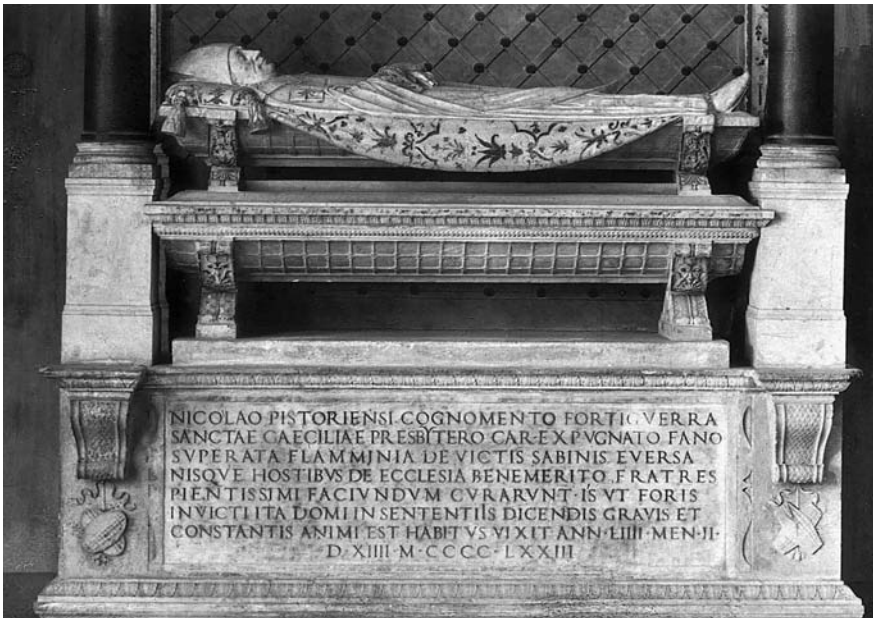
Mino da Fiesole, detail of tomb of Cardinal Niccolò Forteguerri (Santa Cecilia, Rome).