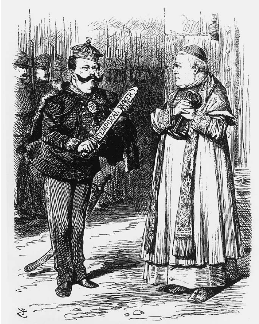
Pius IX reluctantly surrenders the material sword to King Vittorio Emanuele II, but insists that he retains the keys (cartoon in Punch magazine, 1870).

Minister or 'Pro-Minister of Arms'. 69 By July 1860 General Lamoricière was planning to concentrate the army (henceforward known as the papal Zouaves) into two enormous camps at Spoleto and Pesaro, in anticipation of a great campaign to win back the March of Ancona and Romagna, in the footsteps of the armies of earlier popes. Pio Nono tried for the time being to sound wary: 'The duty of the Pope,' he observed