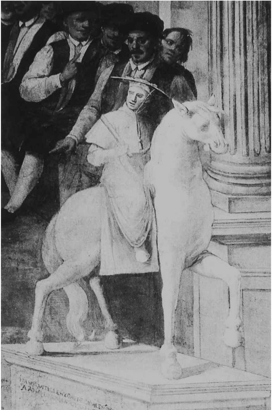
Artist's conception of the proposed equestrian statue of Cardinal Giovanni Vitelleschi. Detail of fresco (anon., seventeenth century) (Tarquinia, Palazzo Comunale).