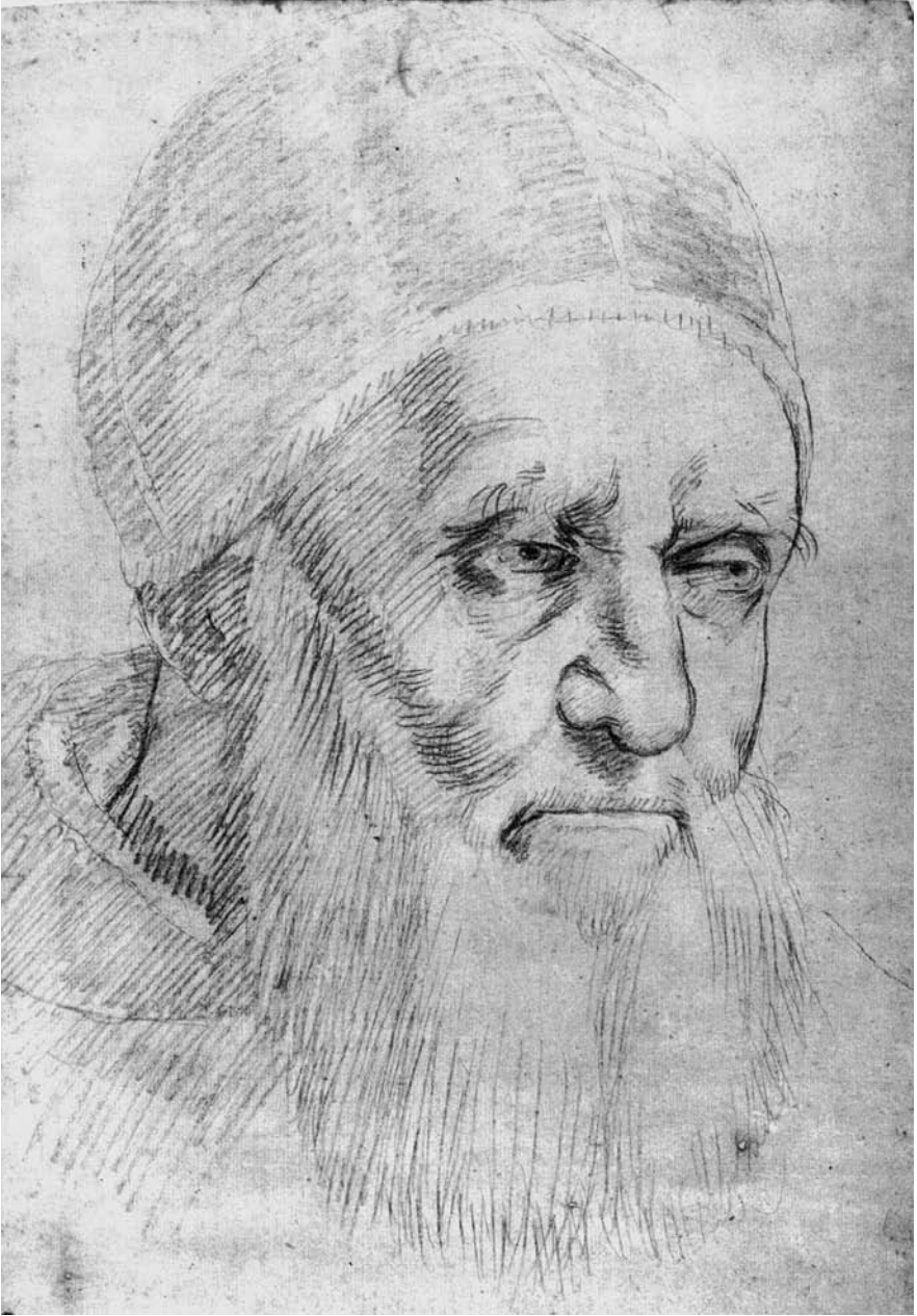
Raphael (attrib.), Julius II: this drawing is thought to be a contemporary copy of the portrait in the National Gallery, London, rather than a preliminary sketch. Reproduced by permission of the Duke of Devonshire and the Trustees of the Chatsworth Settlement. Photograph: Photographic Survey, Courtauld Institute of Art, Devonshire Collection, Chatsworth.