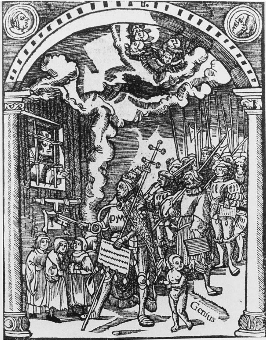
'Julius Exclusus': anon. woodcut, ca.1522-23 in a German version of the text, printer and place of printing unknown (Beinecke Rare Book and Manuscript Library, Yale University).

Christianity, but 'holy war' was not only to be fought in the east, in defence of the faith or (even more of a catch-all slogan) defence of the Church. It was also to be fought in the west, sometimes against heresy, schism or disobedience committed by secular rulers but more