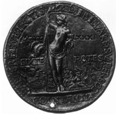
Medal of Sixtus IV commemorating the recapture of Otranto, 1481 obv. and rev.