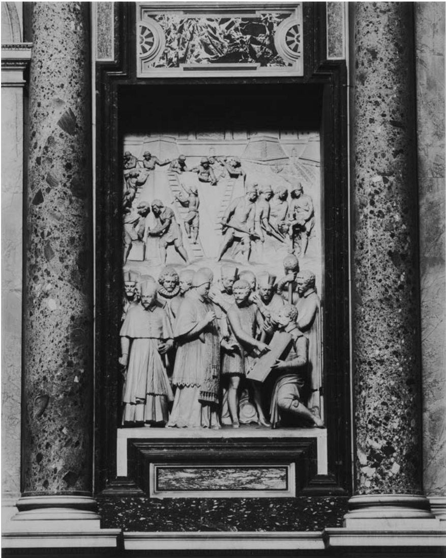
Pope Paul V approving the plan for a fortress at Ferrara (tomb of Pope Paul V, Santa Maria Maggiore, Rome).

The two long-lived, lavish popes of the earlier seventeenth century – Camillo Borghese, Paul V (pope 1605–21) and Maffeo Barberini, Urban VIII (pope 1625–44) – were far from pacific. Paul V continued Sixtus V's erection of bellicose papal tombs in Santa Maria Maggiore in his own Capella Paolina. Clement VIII was commemorated there with reliefs depicting the siege of Esztergom (Hungary) and the conquest of