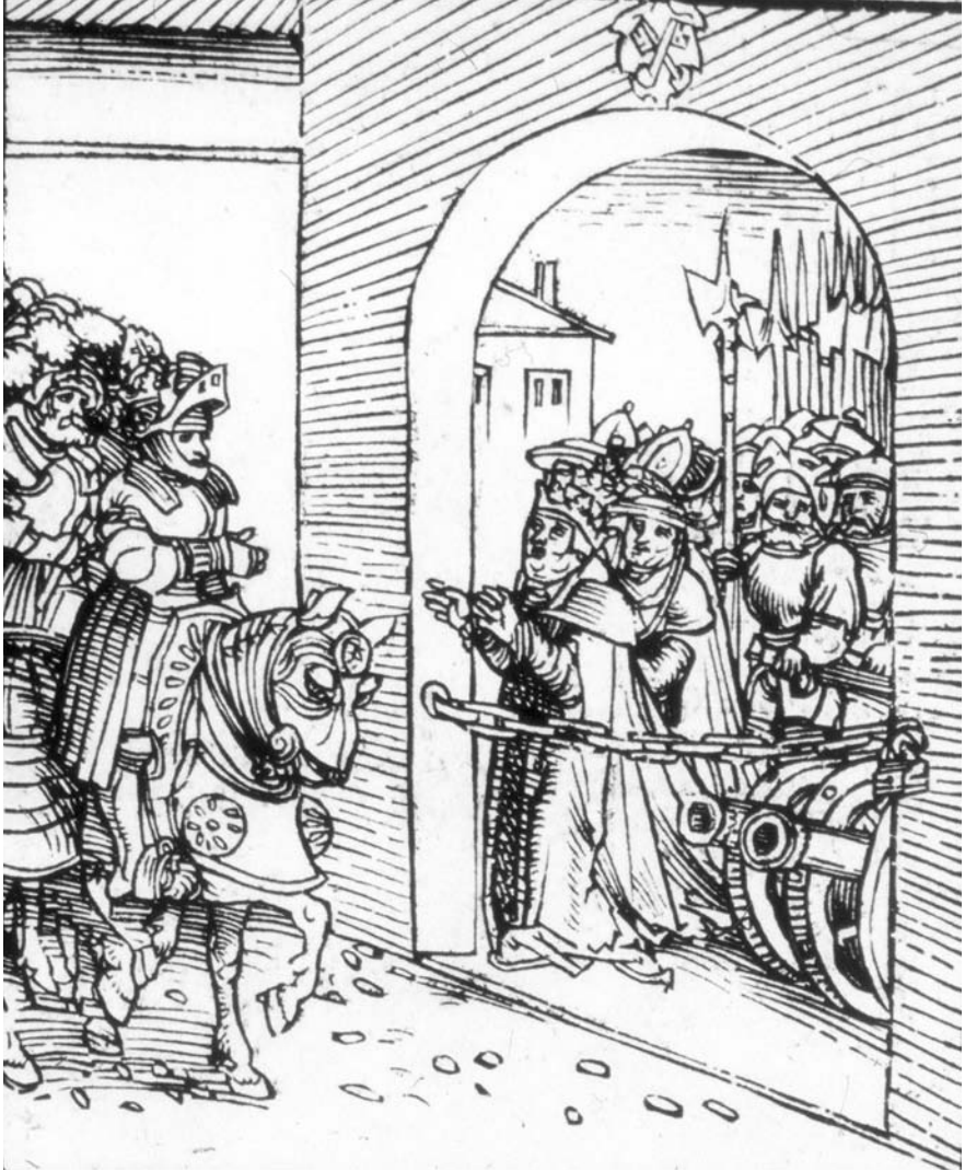
Print showing a pope with cardinals, cannon and armed men confronting the Emperor (Cranach, Passio Christi et Anti-Christi, 1521).