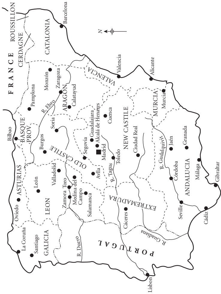
Map 1 Spain in the late Fifteenth Century Source: based on Edwards, J. The Monarchies of Ferdinand and Isabella (Historical Association pamphlet), p. 4