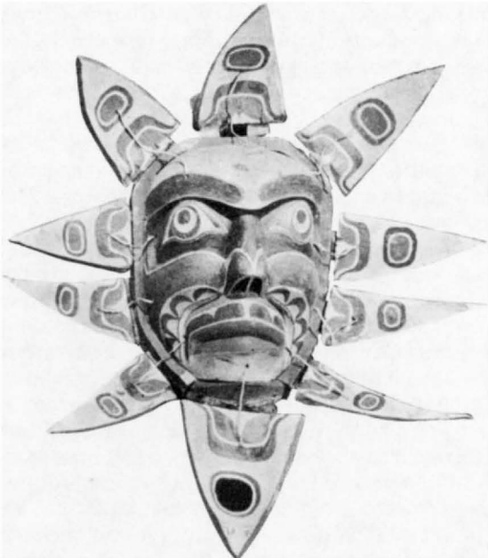
This Kwakiutl mask represents the sun or moon. Hinged triangular pieces close over the face. At one moment in the dance, the music stops and the dancer opens the mask by pulling on strings to reveal the human aspect of the mythical personage.

Of all the regions of Northern America, in the northwestern coast the plastic arts are the most highly developed. Proof of this development are their tall sculpted totemic poles, and their wooden masks, sculpted and painted, trimmed with leather or fur, and set with mother of pearl and animals' teeth. They often represented several characters or different aspects of the same divinity, and were sometimes animated by straps and strings. As a result, they could produce sensational effects in celebrations. The head of the mythical raven could be opened in two or four parts, revealing a human face which had been hidden from the spectators; cannibalistic birds could clap their beaks; the Spirit of Sleep could alternately open and close his eyelids, and roll his eyes while moving his jaws; and birds perched on an immobile head could beat their wings. A bladder filled with blood, surreptitiously burst, allowed the sorcerer-conjurer to simulate the public severing of a slave's head.